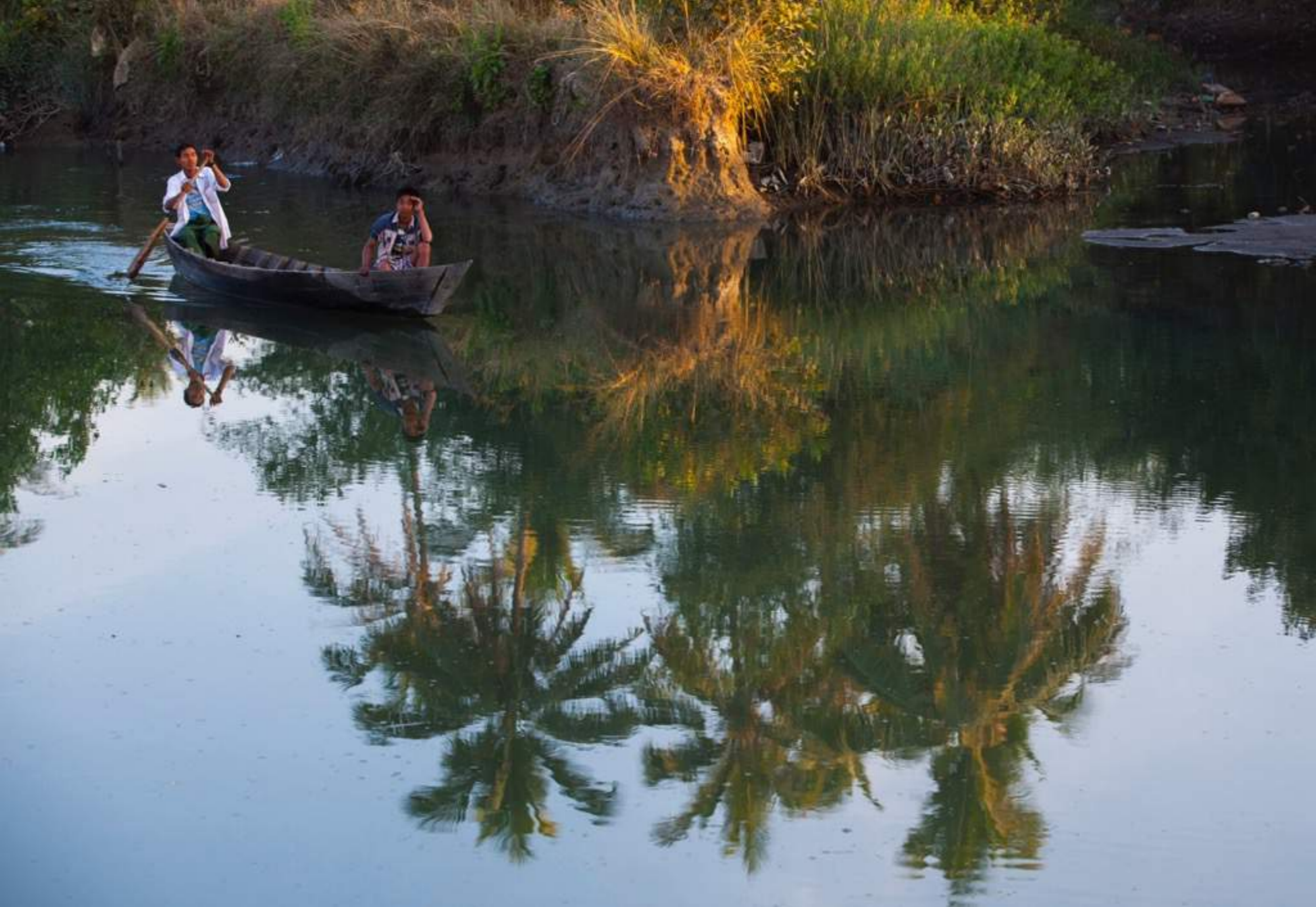
Backwaters, rivers, lakes, mangroves: before reaching the city, you can witness local life in an idyllic landscape... The Kingdom controlled large coastal areas from western Myanmar to India, all the way to the Ganges River.