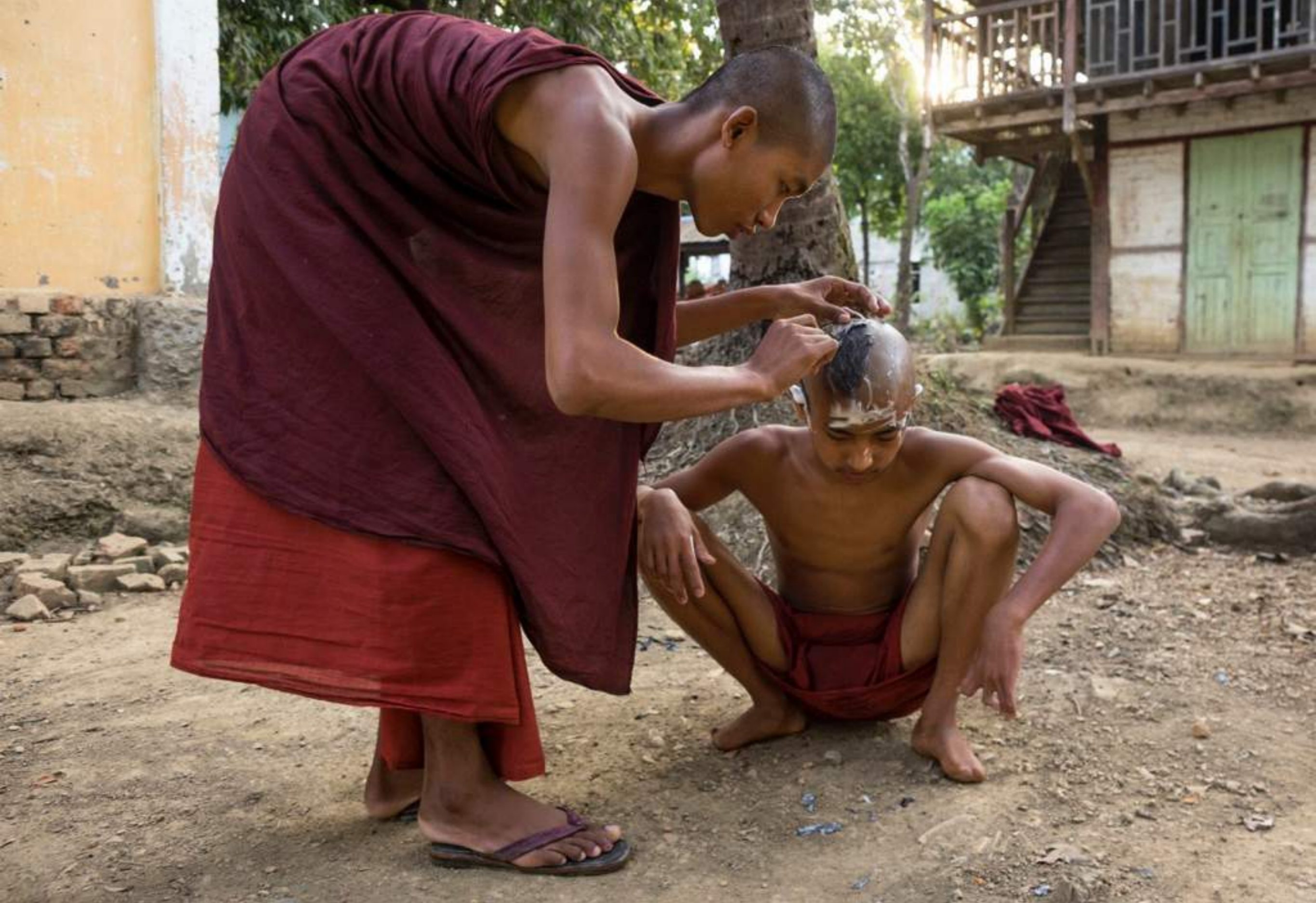
Visiting the monasteries is a highlight of a trip to Mrauk U, as novices will welcome you like nowhere else in Burma. With vivacious curiosity, they try asking you questions despite their English being as poor as your Burmese!