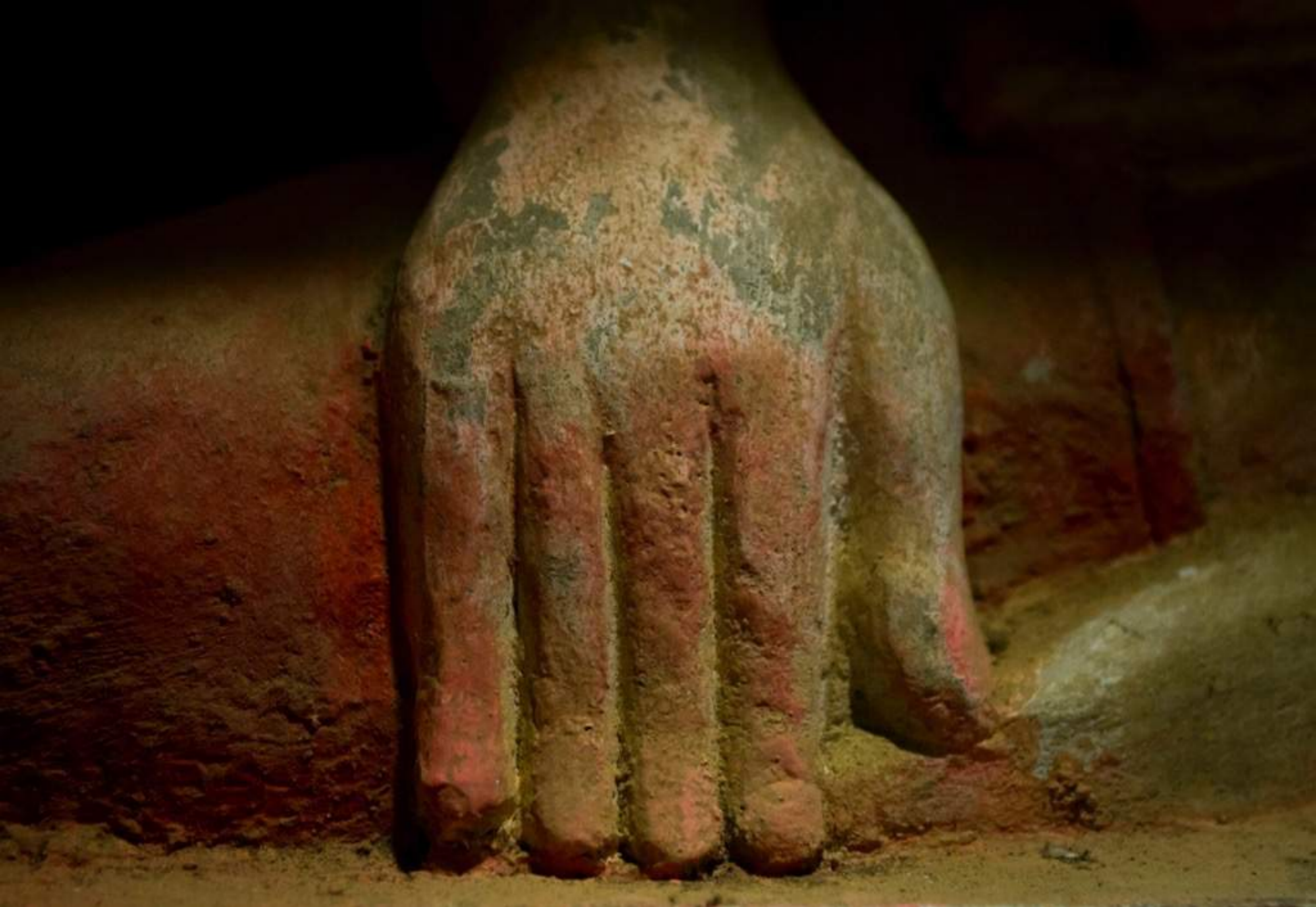
Detail of the hand of a Buddha statue in Kothaung temple. Thousands were inside the temple. Most of them are still in good condition.