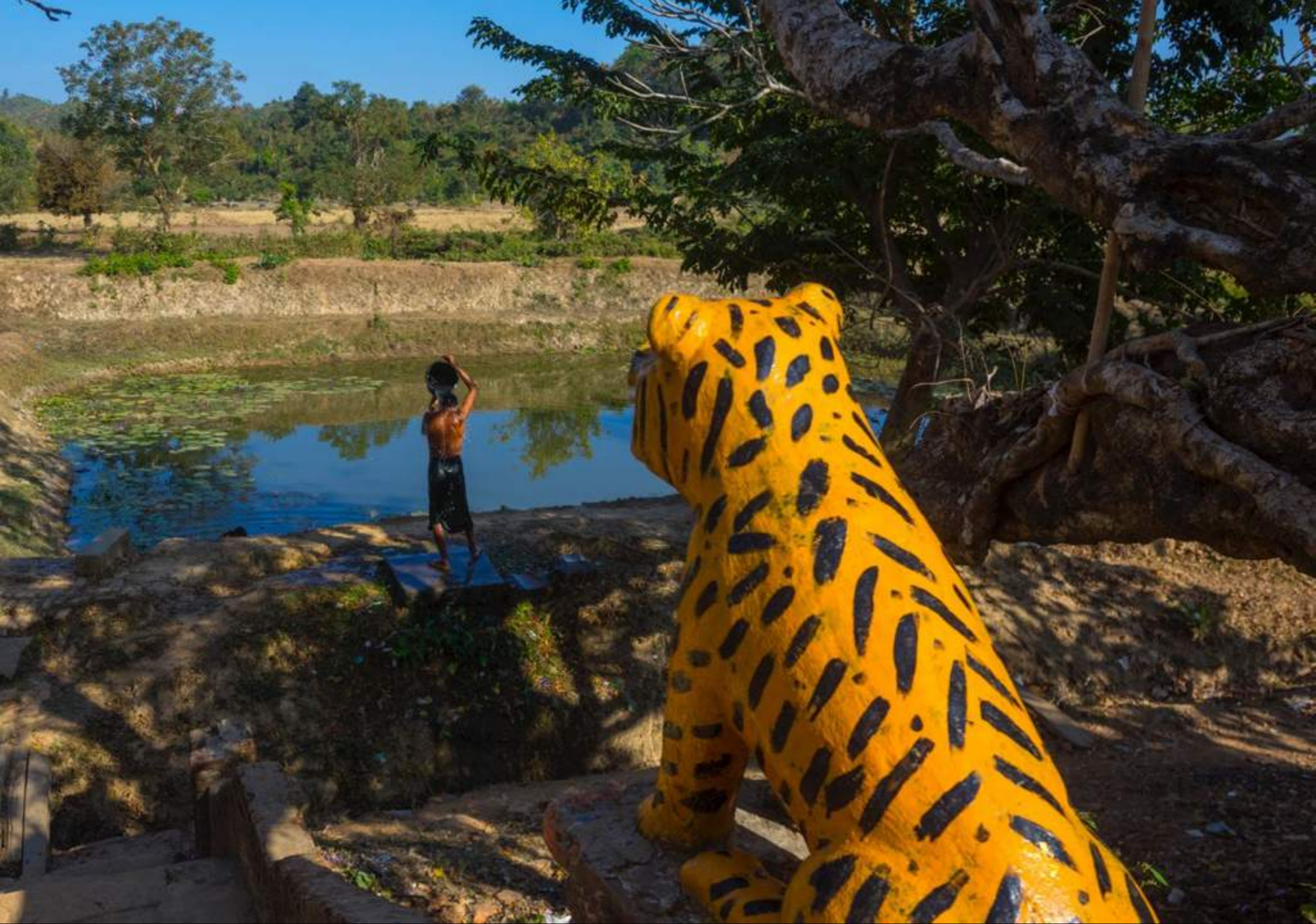
... or the area by a temple reservoir.