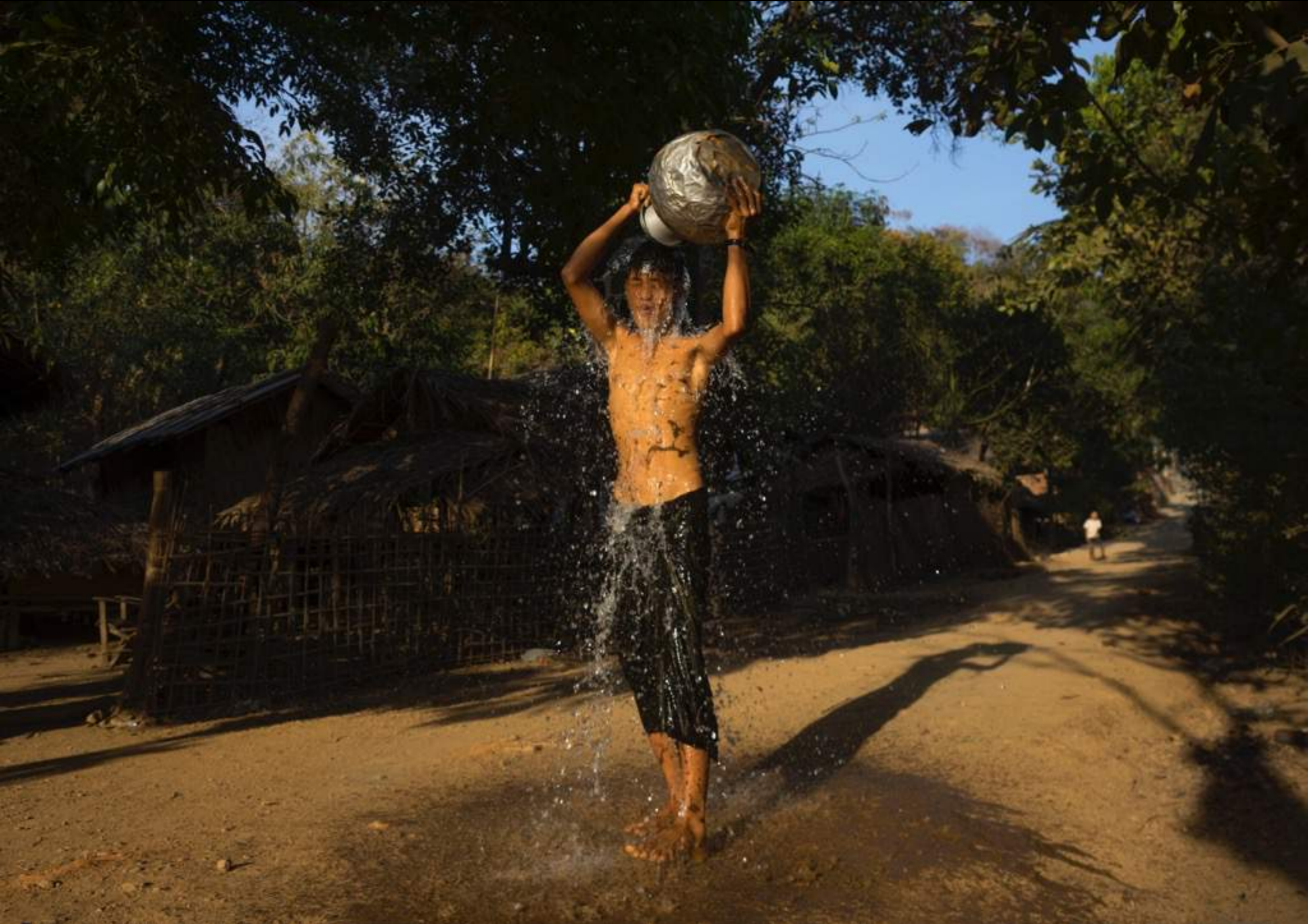
There is no running water in the villages, only wells and pumps. So, the bathroom is the street...