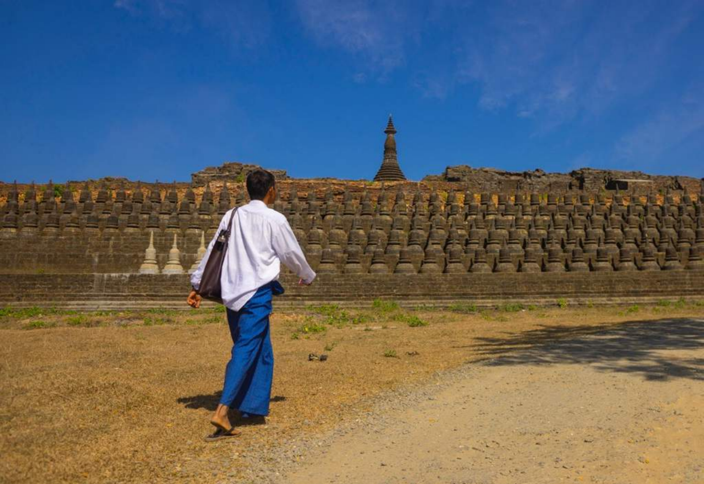
The Kothaung temple built in 1553 is one of the highlights in Mrauk U. It looks similar to the famous Borobudur temple in Indonesia. Its name refers to the 90,000 Buddha images it is said to contain.