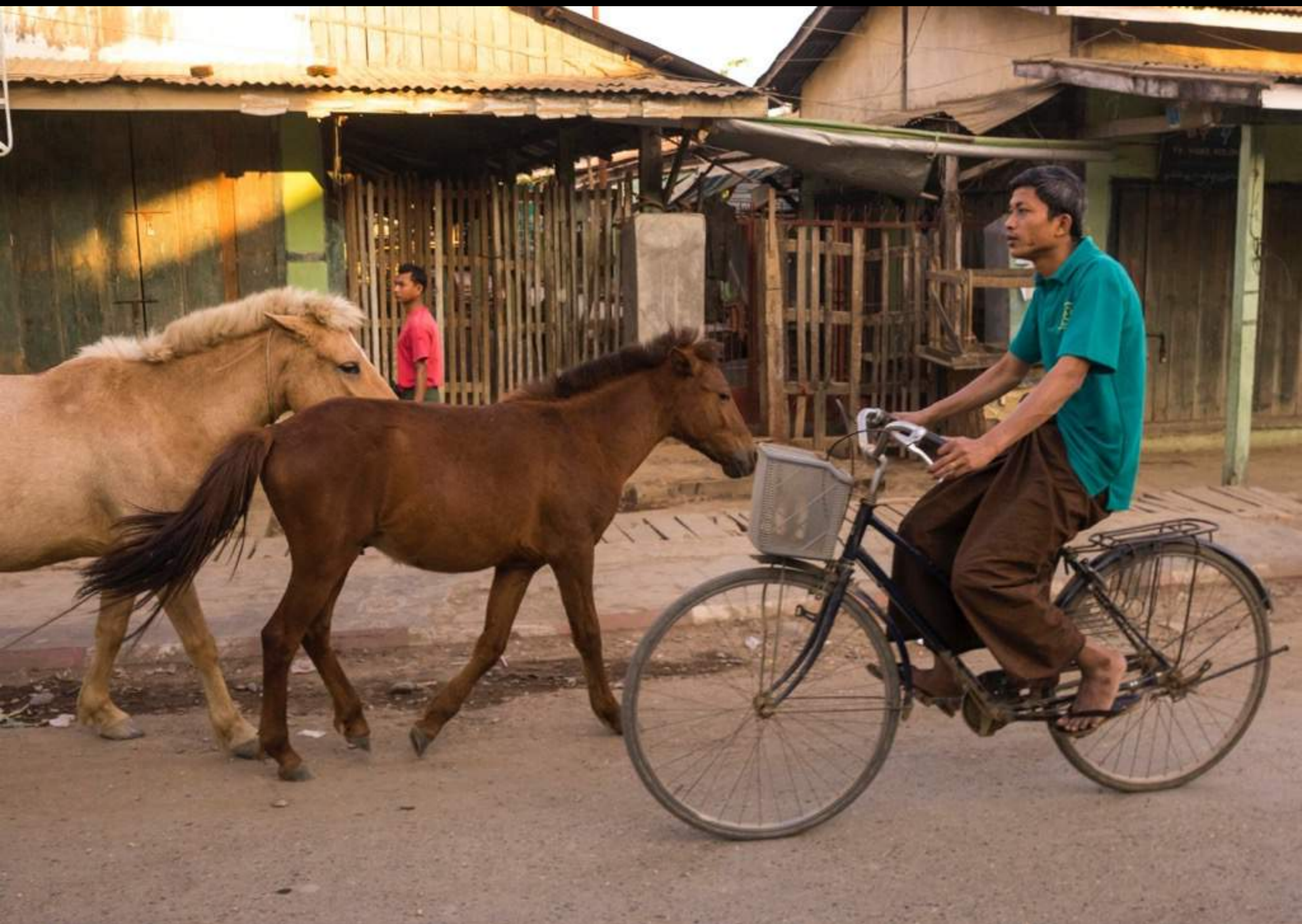
Bicycles and horses in the town center. Forget about wifi, you're entering a totally different world!