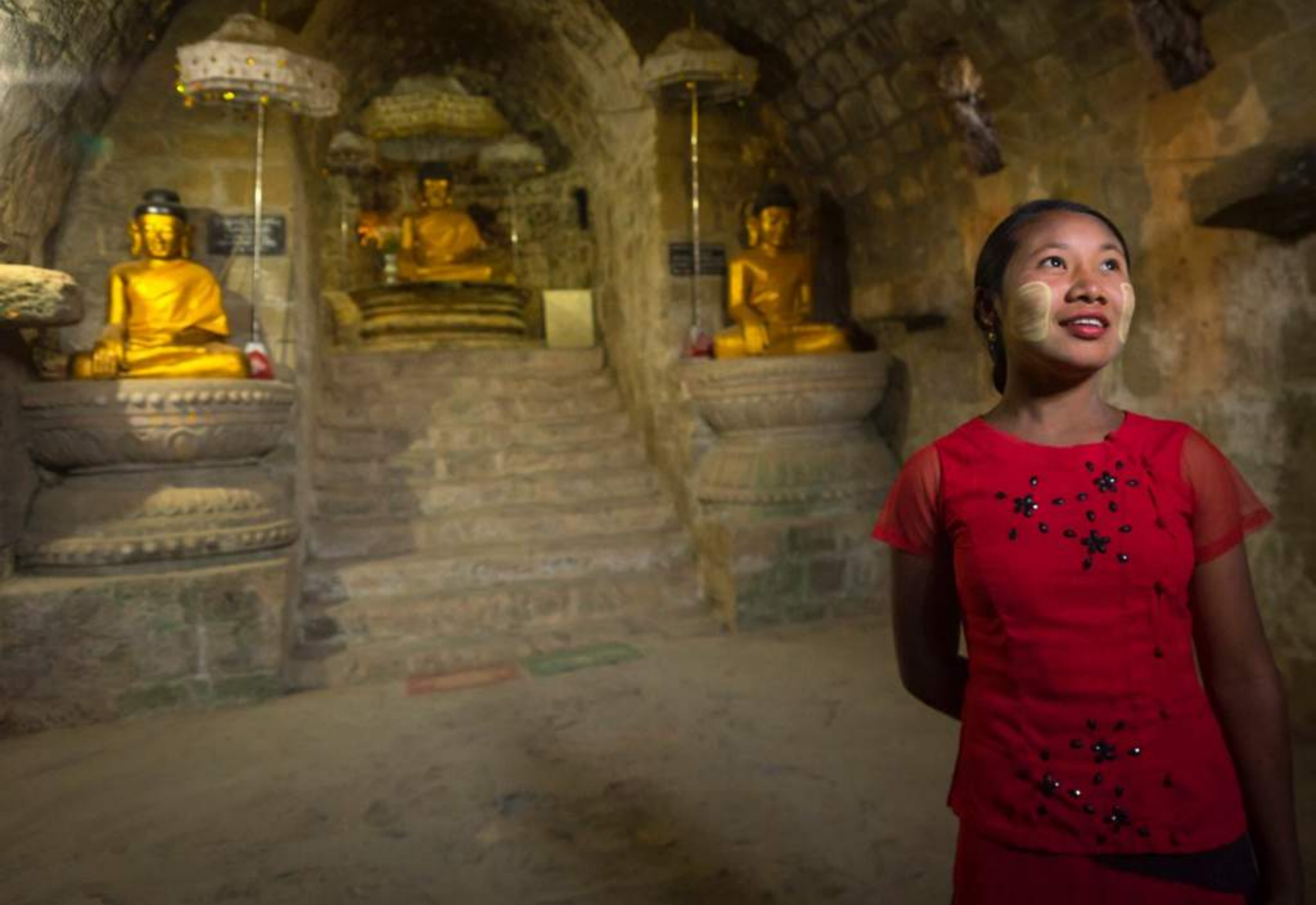
Inside, you can wander alone in the swirling halls, passing hundreds of Buddha statues. The air is cool and silence is only broken by local children playing hide-and-seek!