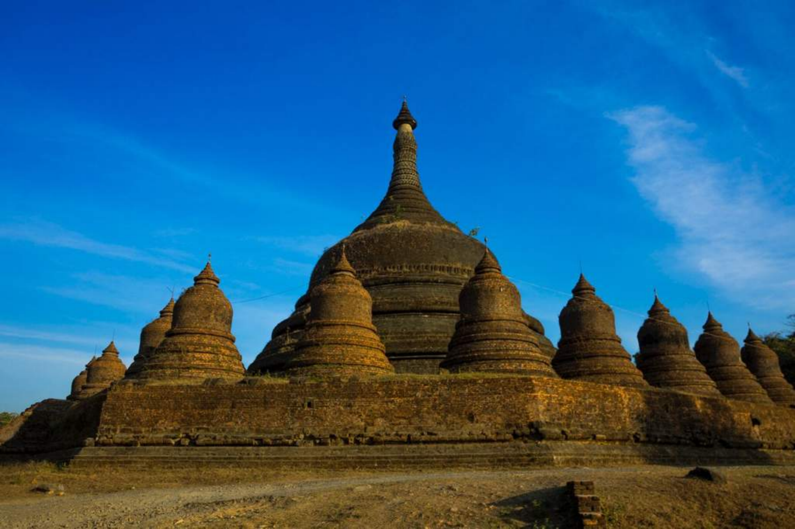
The Ratanabon stupa, which name means "Pile of Jewels." According to local legends, jewels were once kept in the central stupa. The temple was built in 1612 and nobody has found any jewels. The temple has a lovely bell shape and is surrounded by smaller stupas. The sun changes the color of the stone throughout the day.