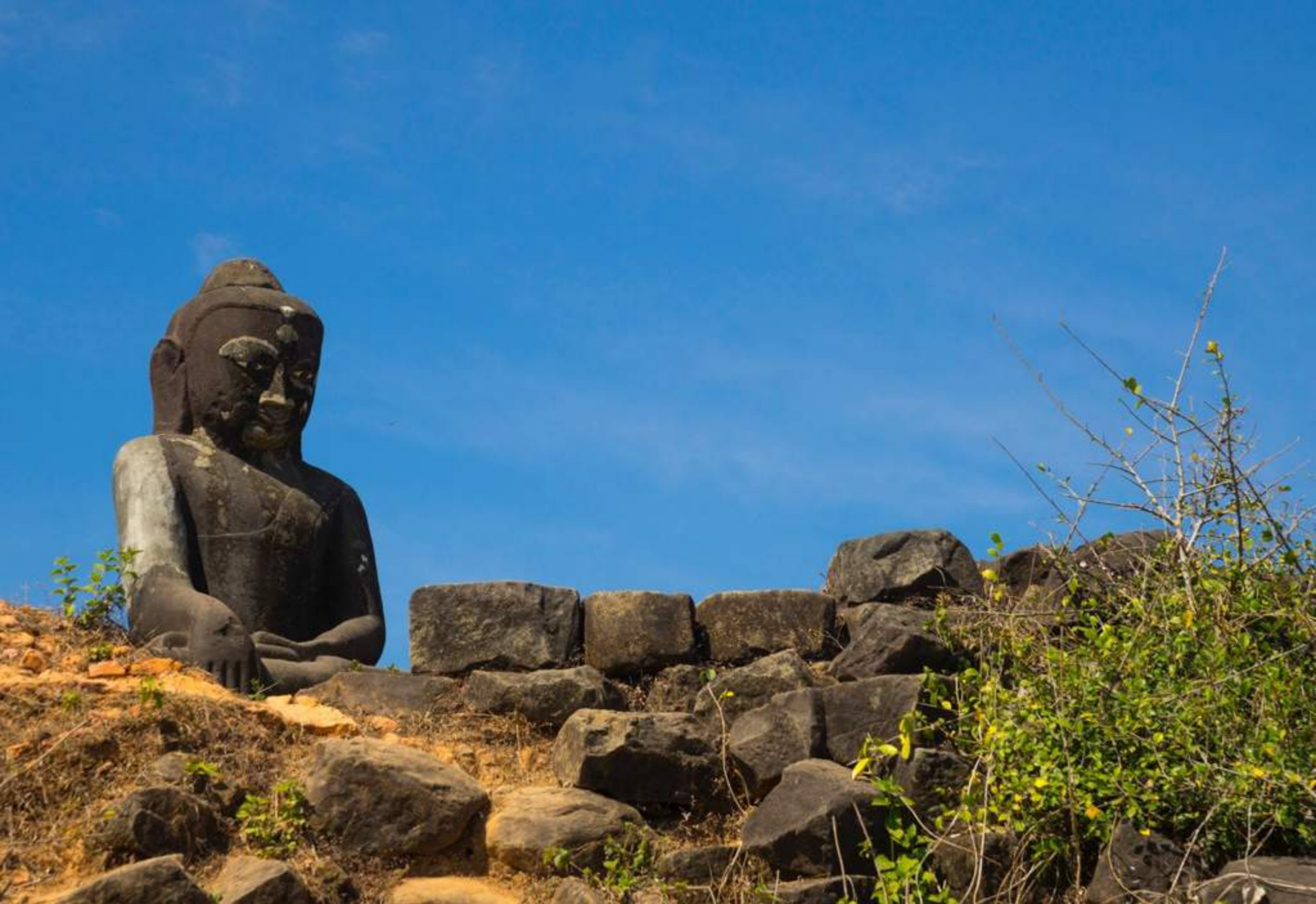
A giant Buddha statue outside of Kothaung temple. The landscape naturally lends itself to mystery, with statues and stupas jutting out of the rocks. You definitely feel like Indiana Jones at times!