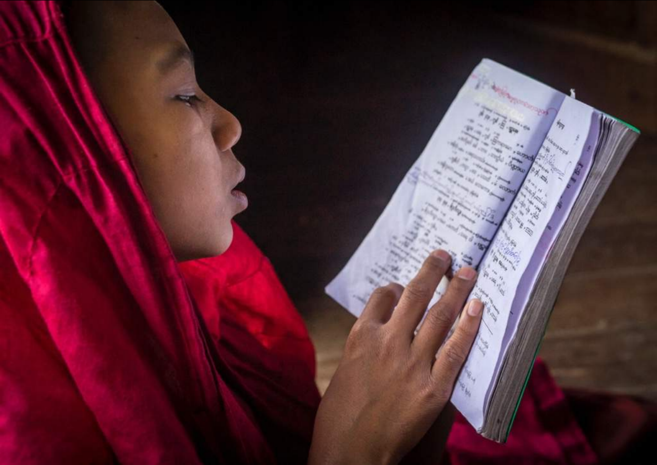
Novices spend part of the day studying. But as soon as they can, they return to their favorite games like chinlone.