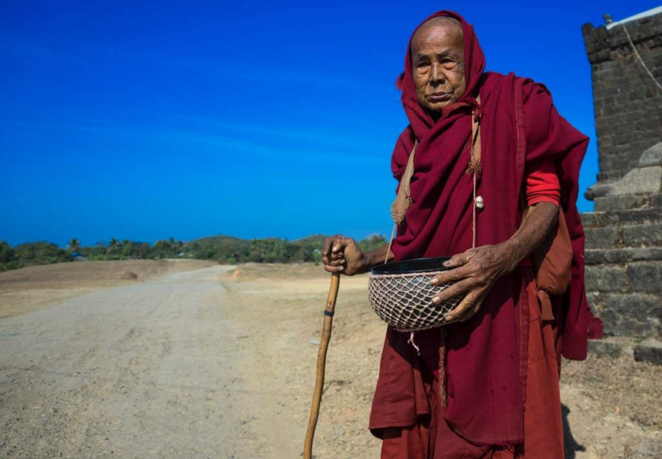
An old monk begging for food in the temple area. The tradition is to offer food to the monks in the early morning, when they leave their temple to go out for alms.