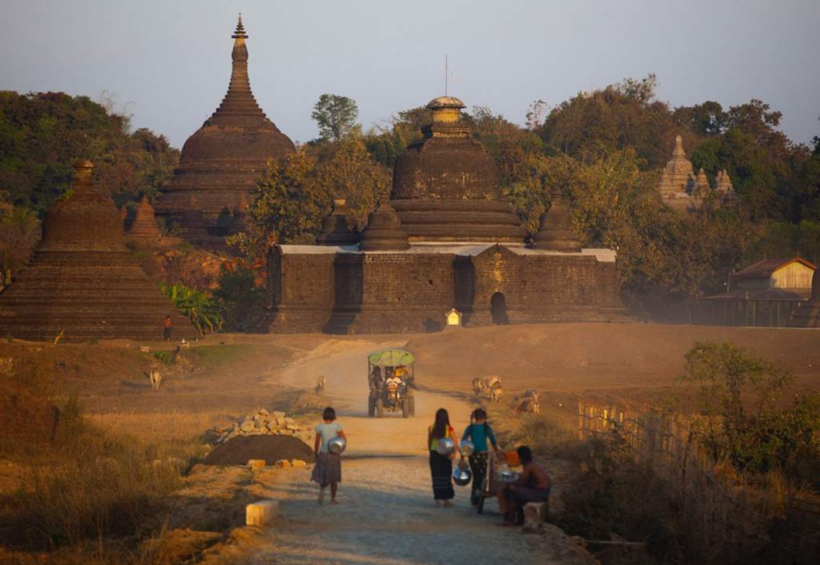
Le-myet-hna temple is one of the oldest temples in Mrauk U. It was built in 1430 by King Min Saw Mon, the founder of the Mrauk U Kingdom.