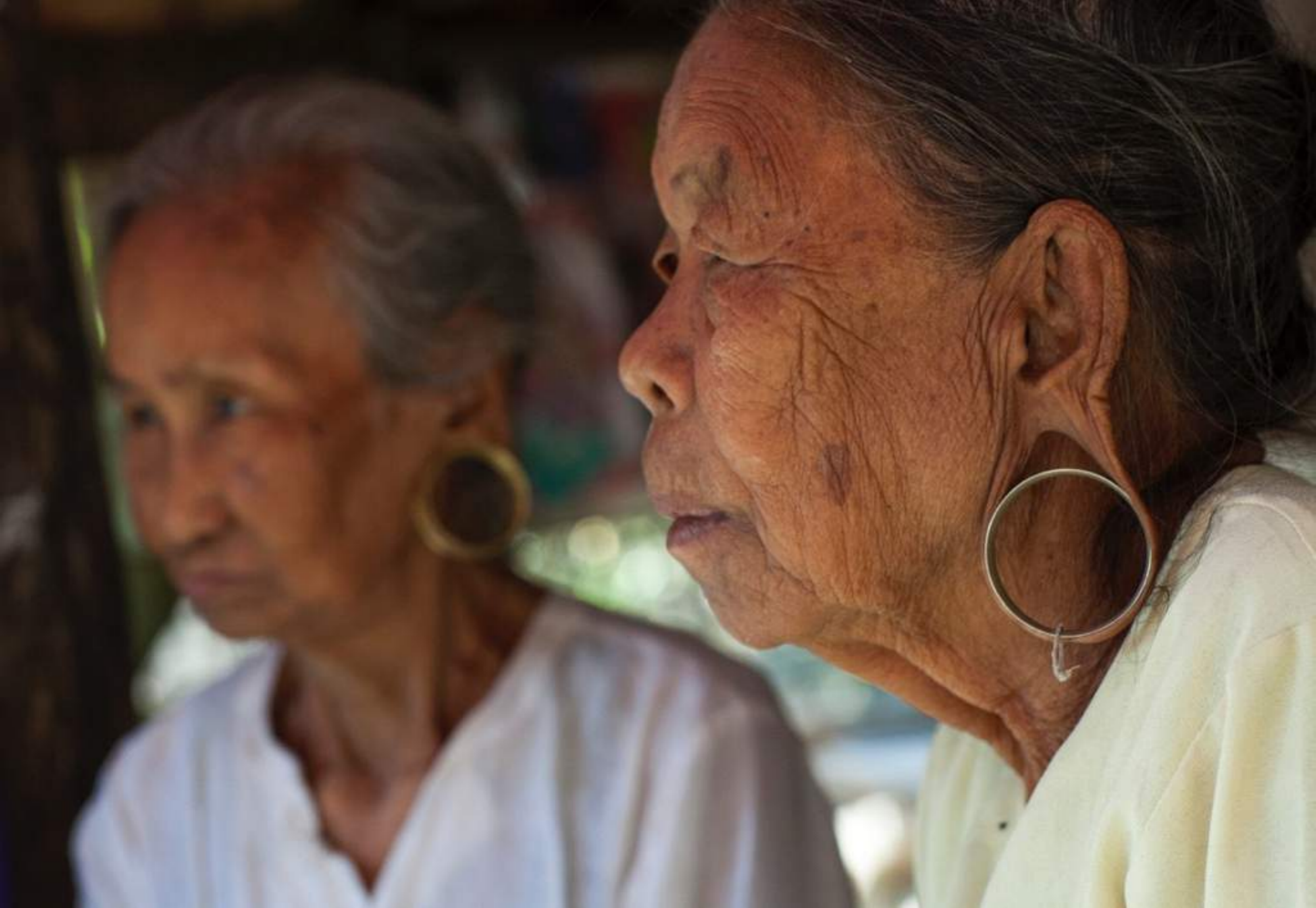
In Mrauk U, there are still old women wearing huge rings in their earlobes. The tradition is no longer followed, but elders are only too happy to show off their beautiful look.