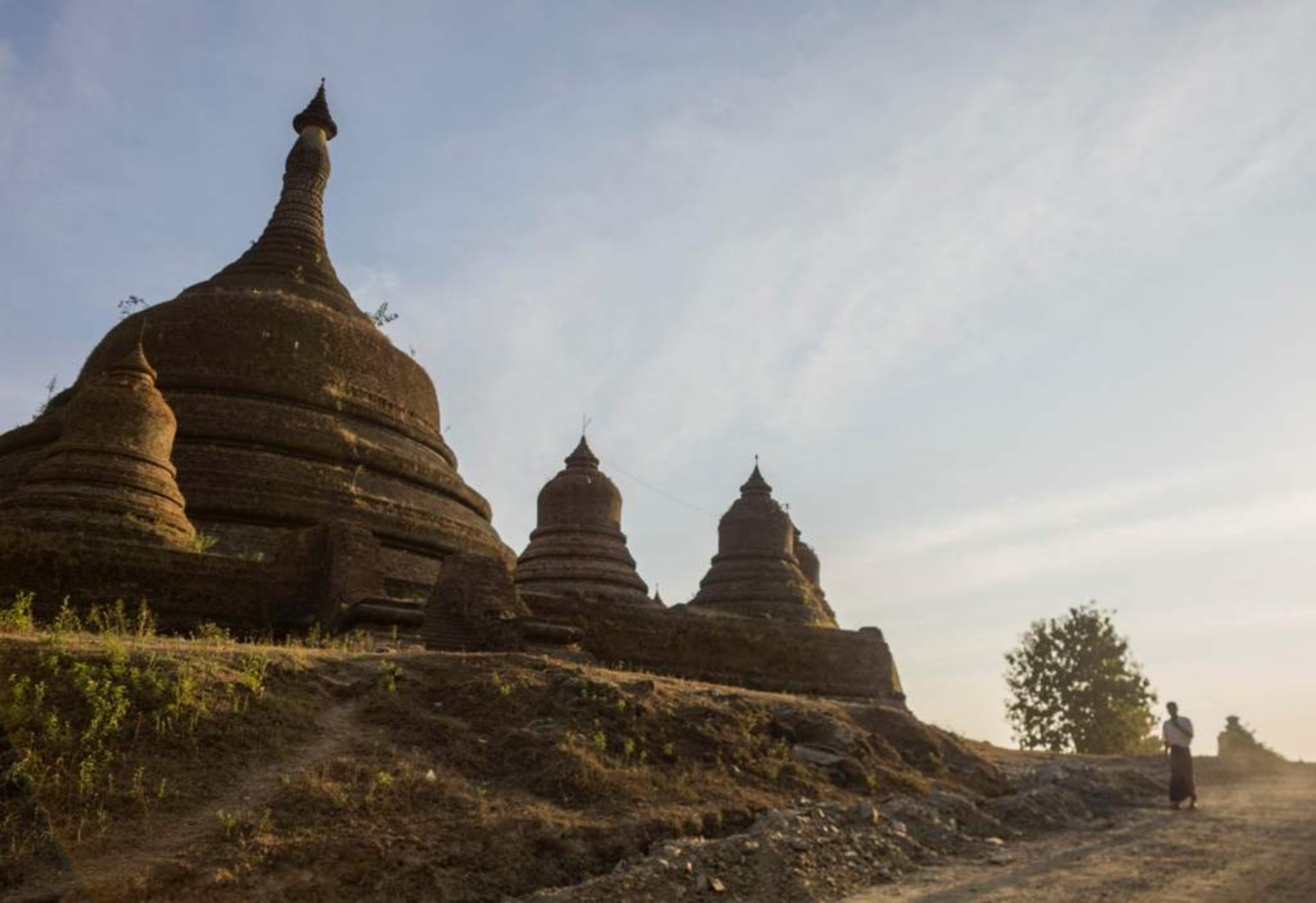
If Bagan is home to thousands of temples, Mrauk U has only a few of them. But they all look different and the lack of tourists makes the place special. There is no need to wake up at 6 a.m. to avoid the crowds, like in Angkor Wat!