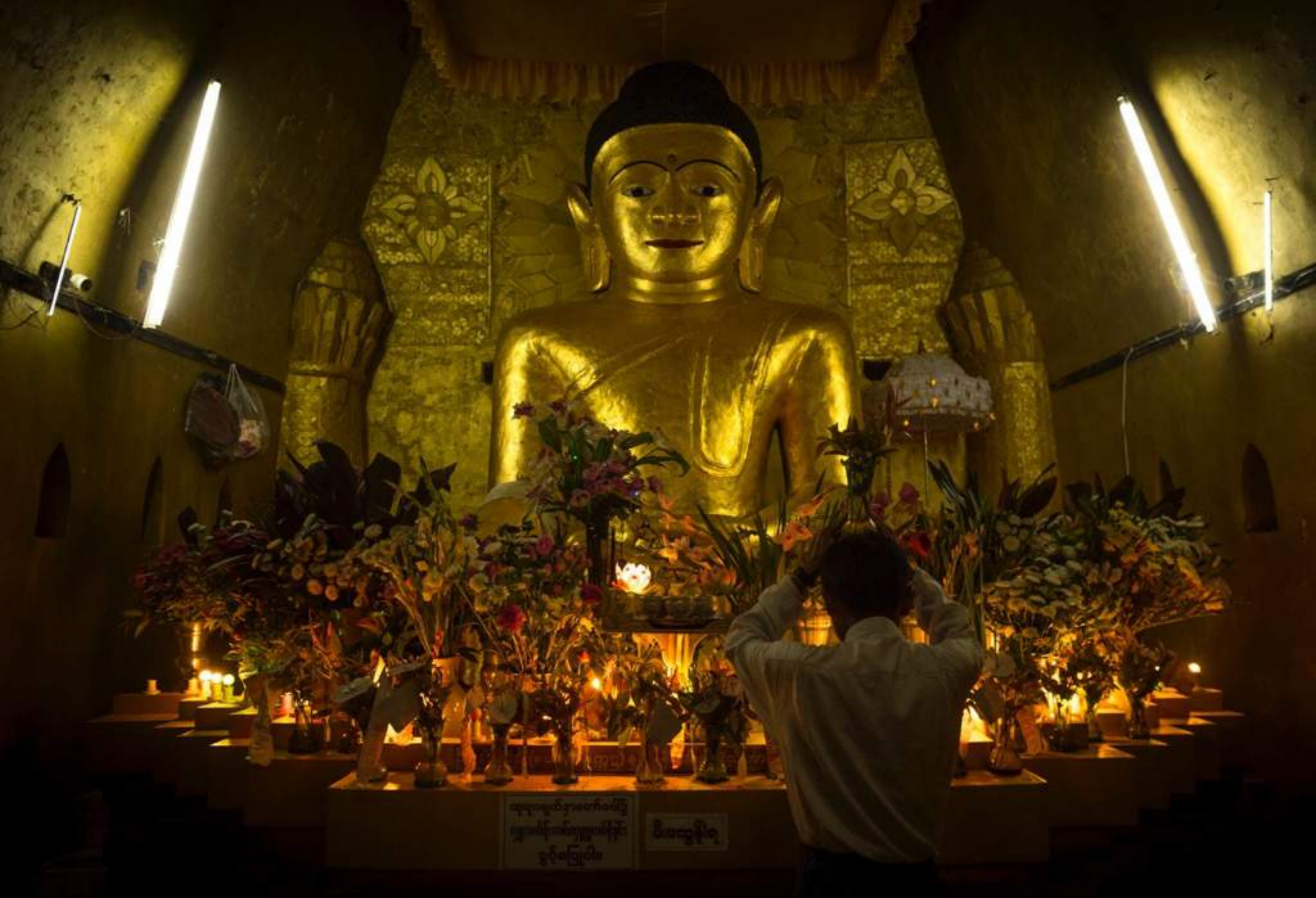
inside a temple, a man has come to pray and make a flower offering. Religion is strong in the countryside, where people are poor. Everywhere I go, my driver will never fail to pray and make donations.