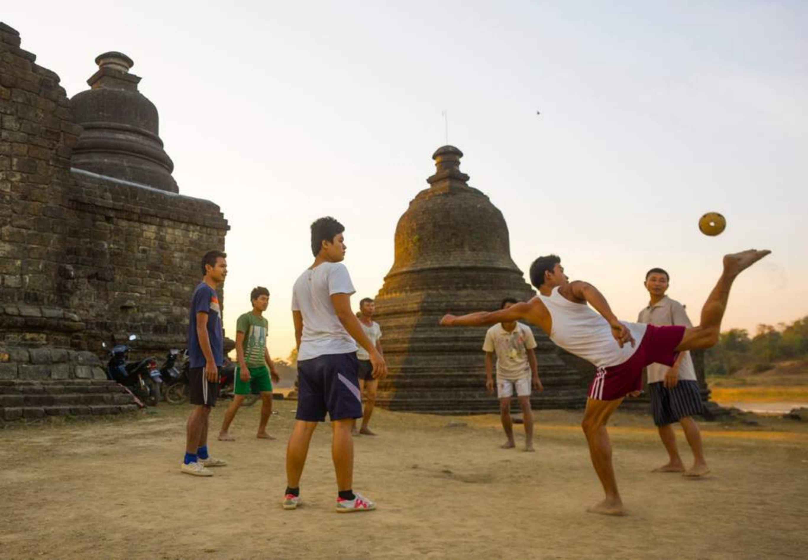
At the end of the day, many young men can be seen playing chinlone. This is the nicest imaginable sports court: right in front of the Mrauk U temples. Sorry, nobody will harass you to sell postcards or cheap souvenirs here!