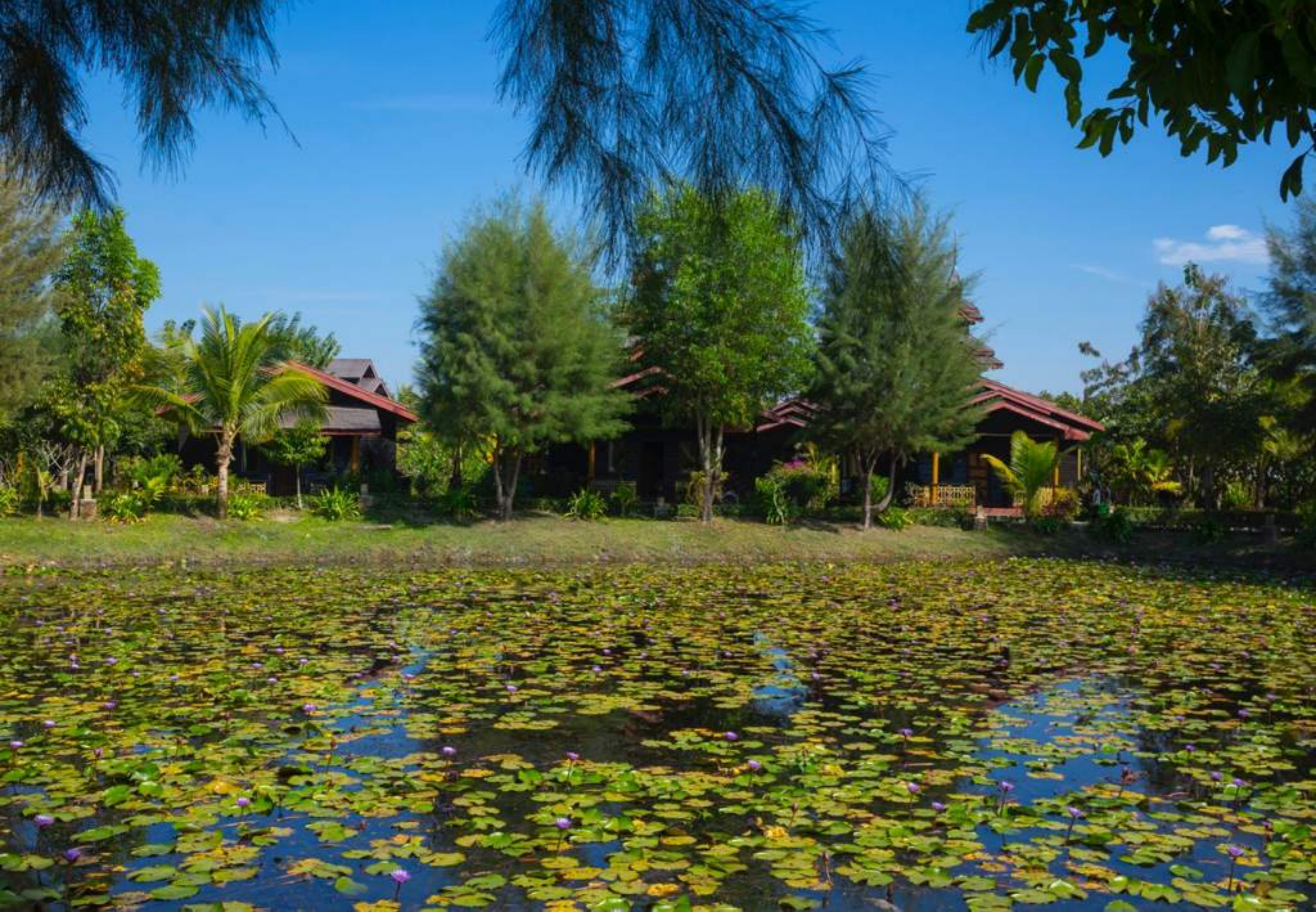
The best hotel in Mrauk U: the Princess. A peaceful heaven, except when monks in the neighboring temples play extremely loud music in the early morning as they chant prayers.