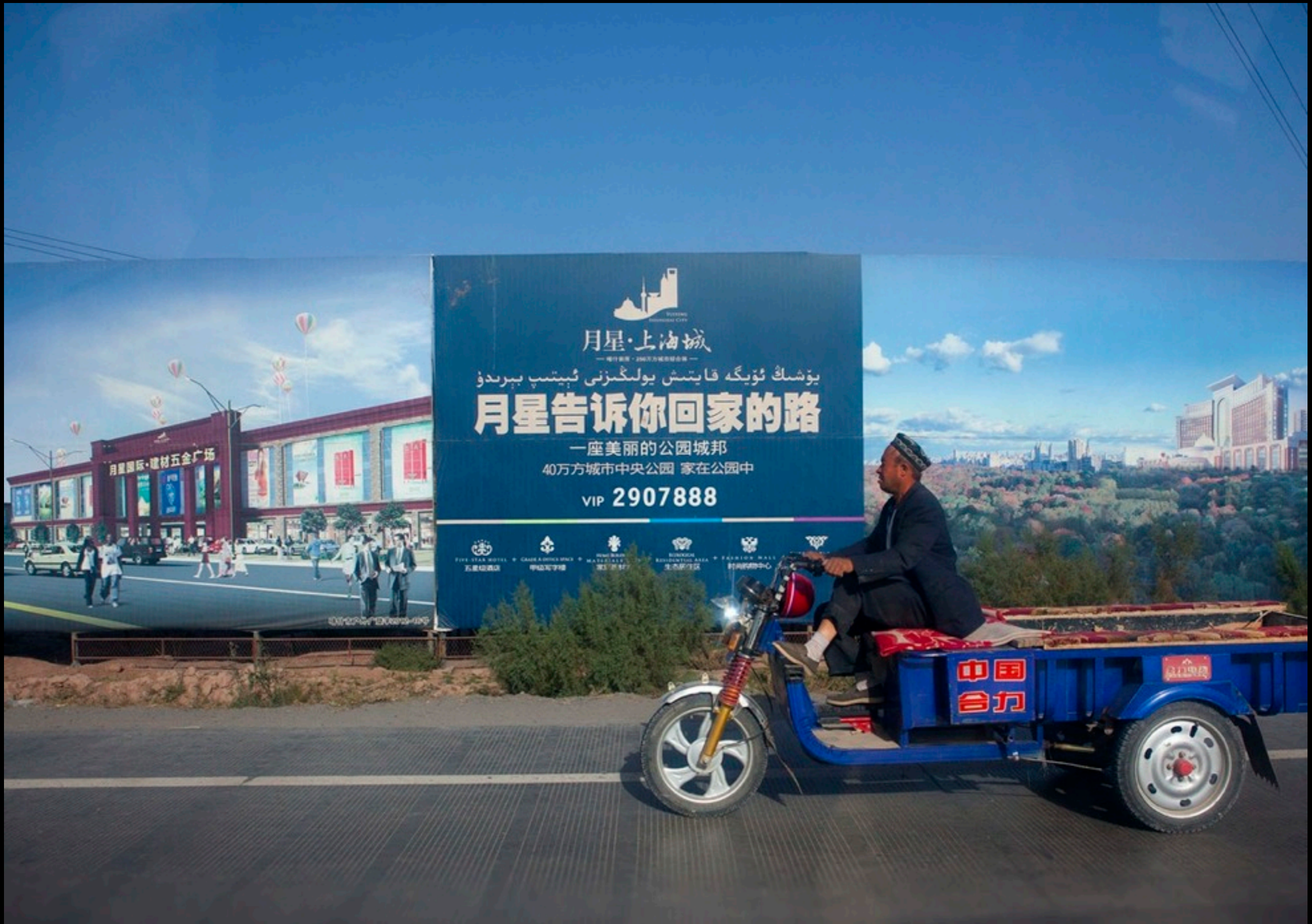
A Uyghur man passing by a billboard advertising a property construction plan which “shows you the way to go home” in Kashgar.