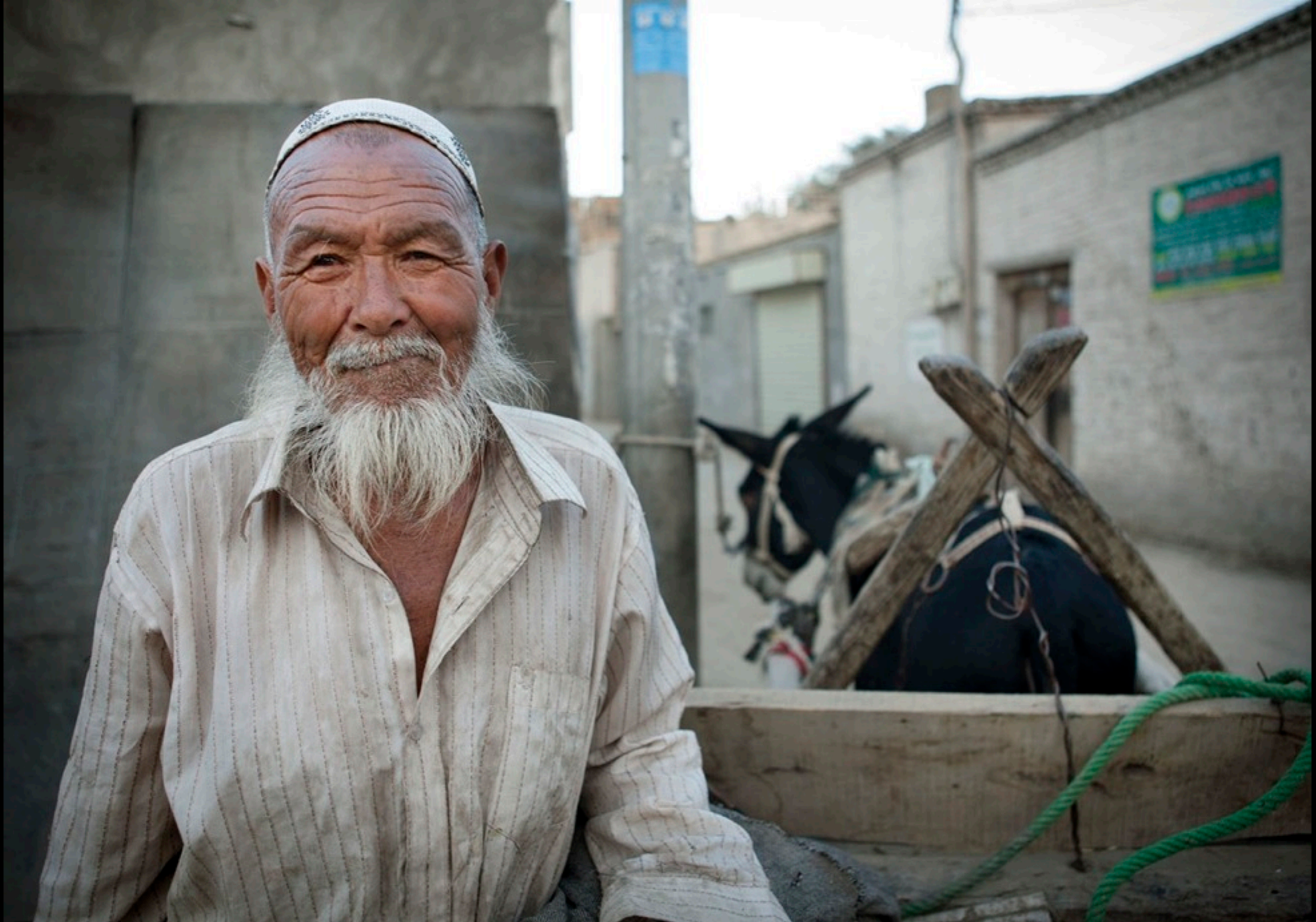
A Uyghur man in Yarkand. The pressure that the Hans put on Uyghur men to shave their beards is apparently what initiated the clashes of June 2013. This measure was introduced during the 2008 Ramadan, but wasn't respected. Government workers cannot have beards or mustaches.