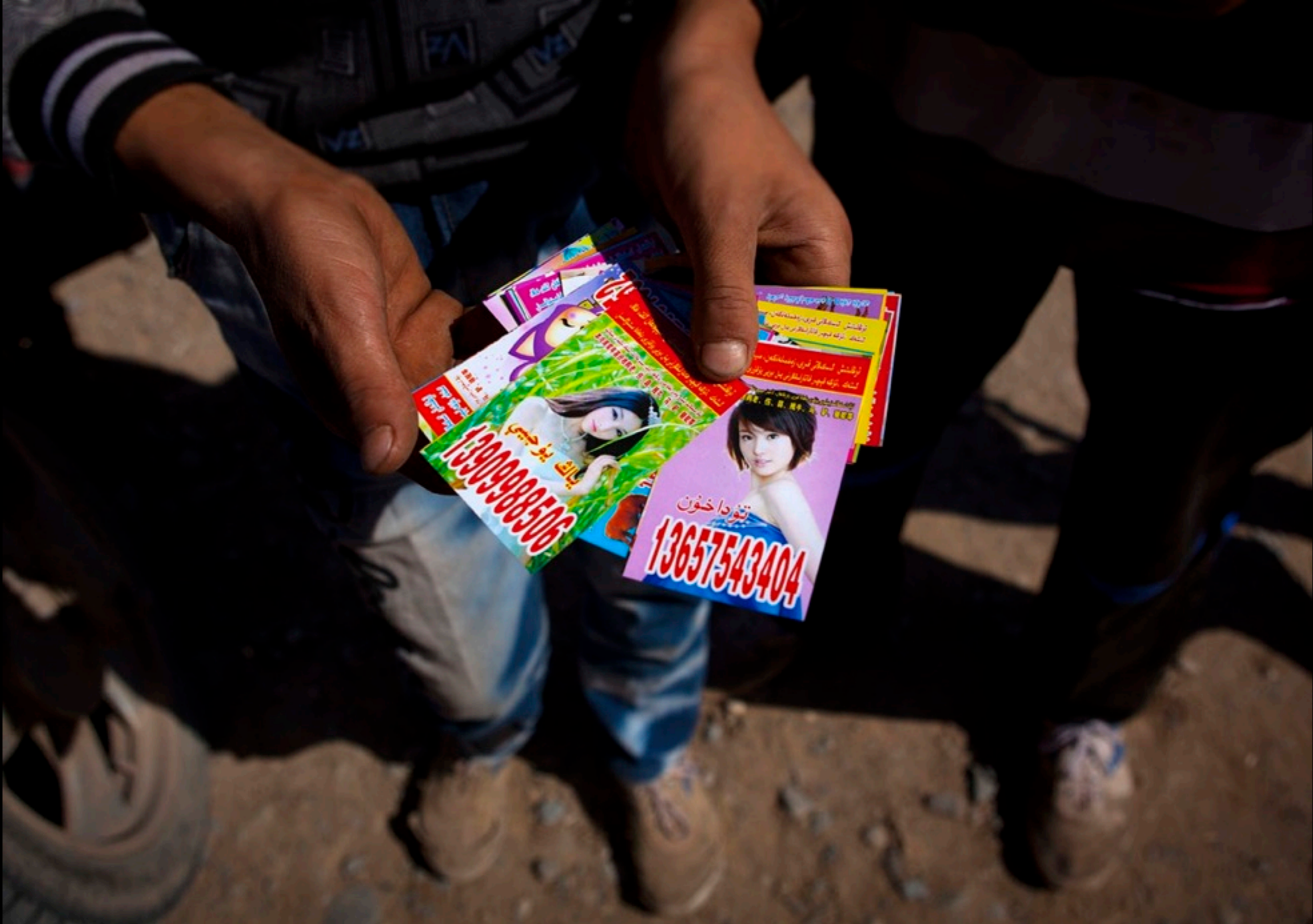
Advertisement cards displaying sexy girls given out by the Chinese on Kashgar market: they offer the Uyghurs the chance to sell to the Hans the bodies of the animals that they can't eat, due to being Muslims. The whole process shocks everyone. Teenagers take pleasure in collecting the cards.