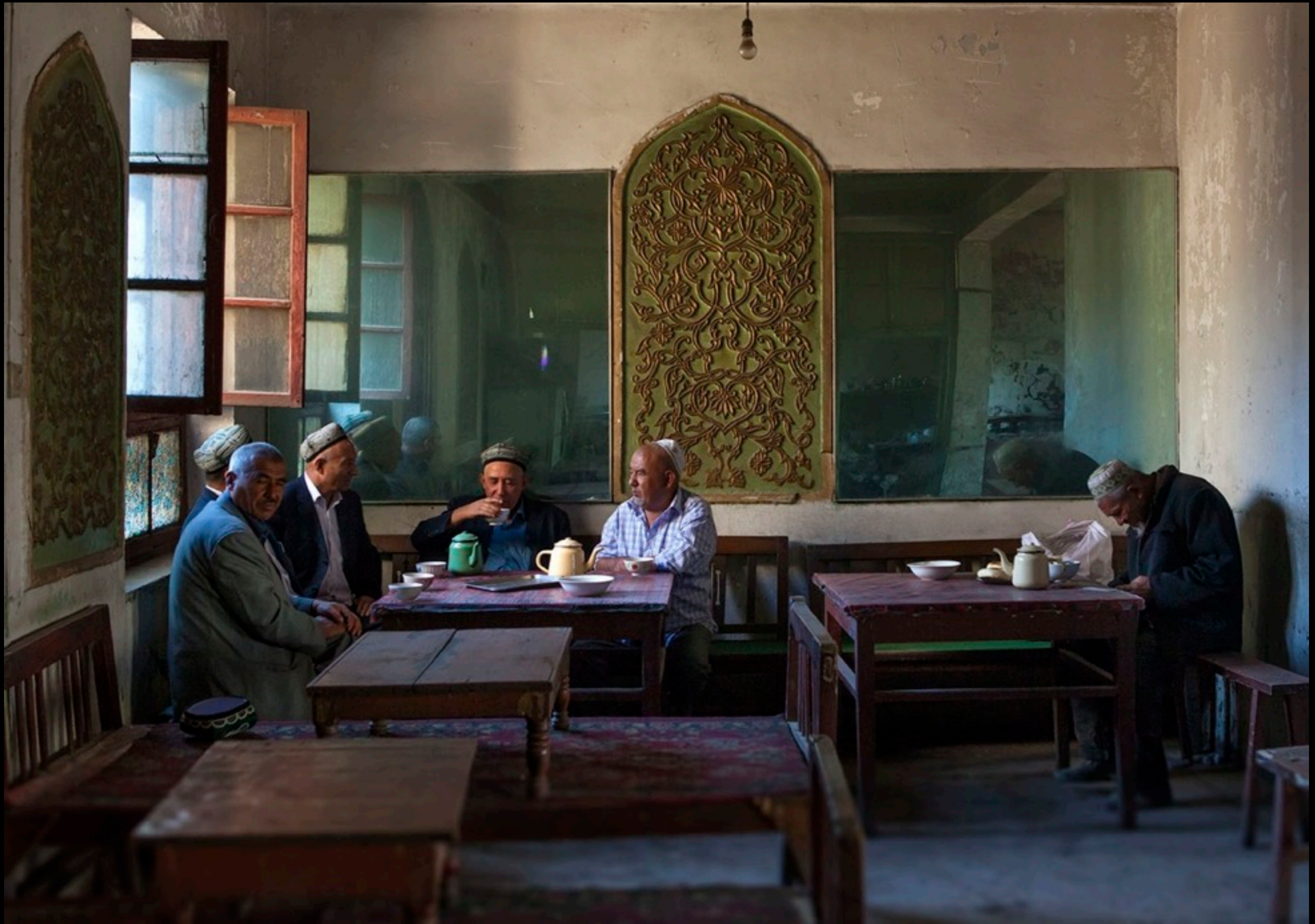
Ostangboyi Tea House, Kashgar. It's impossible to get my Uyghur guide to eat in a restaurant if he doesn't know the owner: "The Hans feed the lambs sow's milk, I have to be careful". The recent health scandals could probably prove him right...