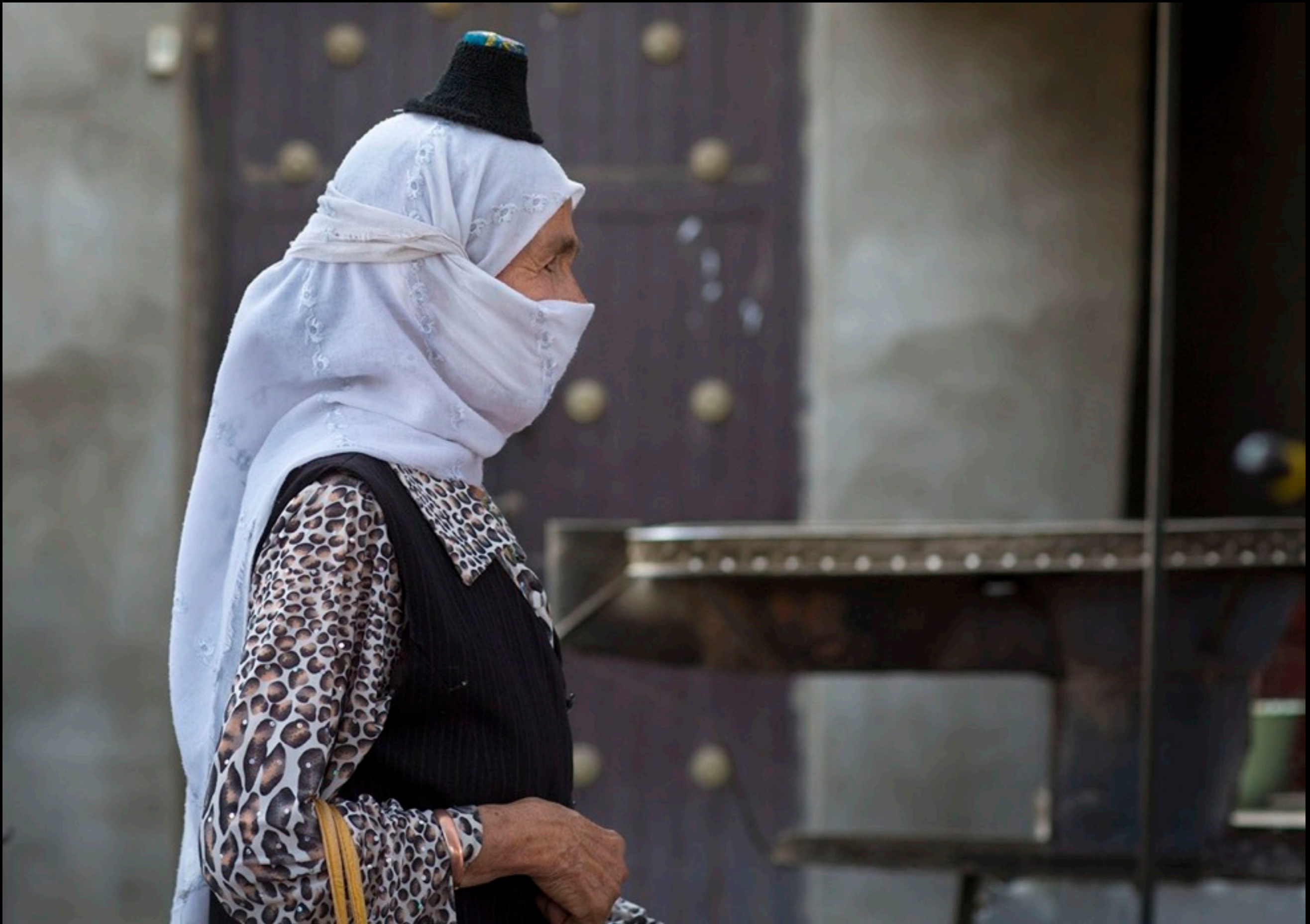
Kyria: a woman with a Talpak hat, sign of the region's married Uyghur women, and also the world's smallest hat. The anti-terrorism law forbids them from wearing it, except for funerals. Wearing it is a sign of defiance.