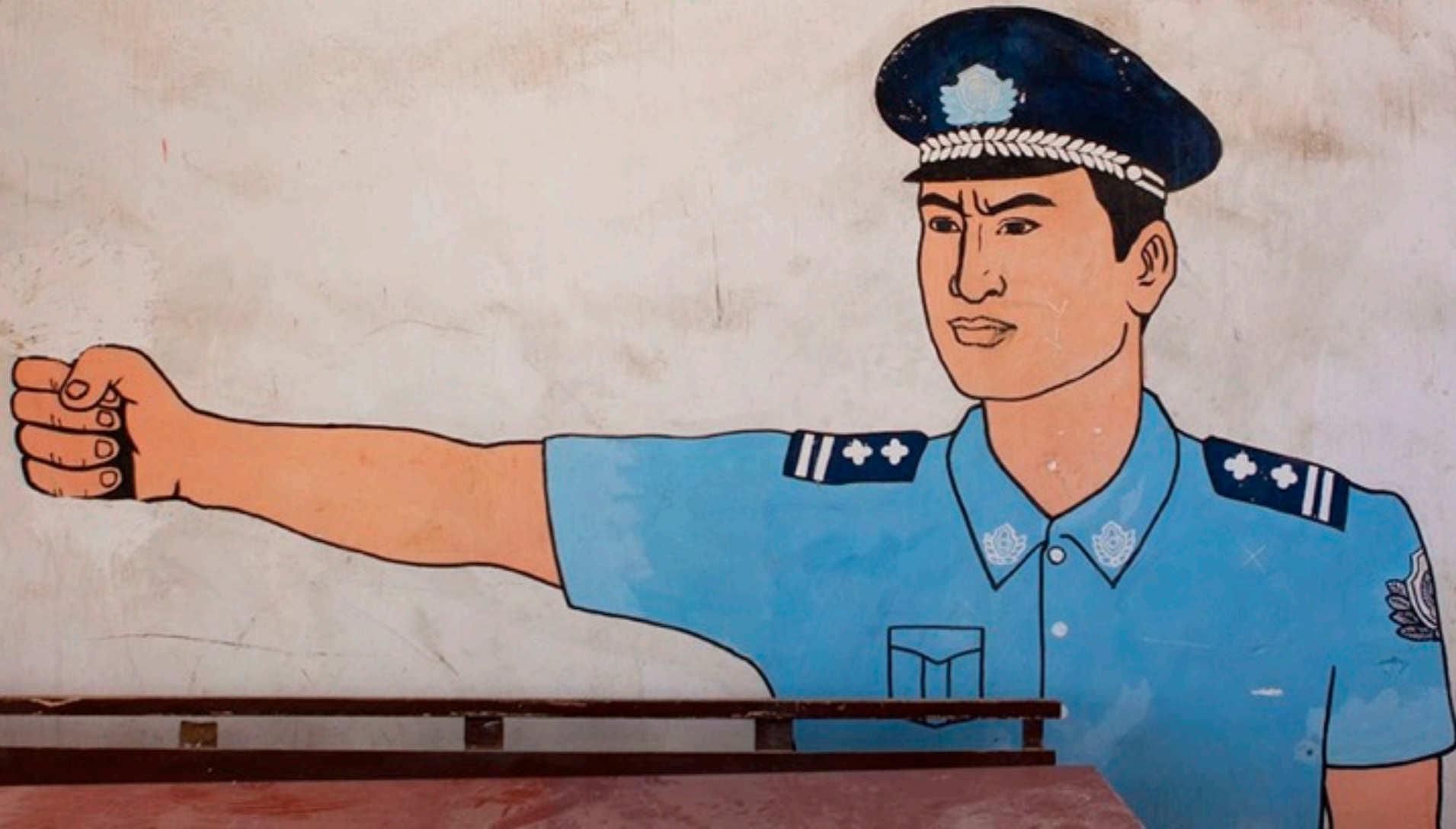
A fresco at the entrance of a rent controlled building representing a policeman: "Stability is happiness, revolution is a catastrophe!"