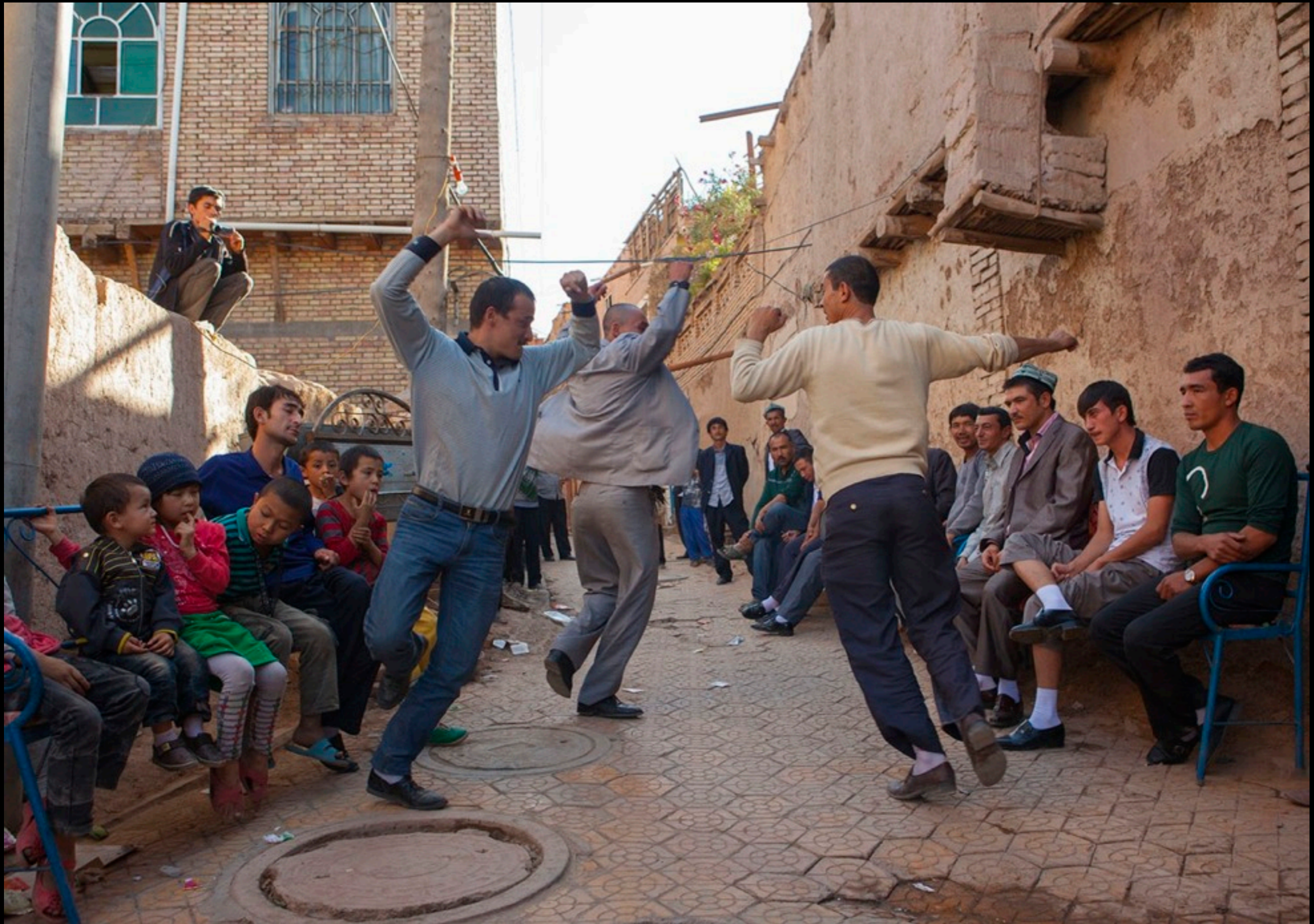
The Chinese government doesn't want the tourists to see the real Uyghur way of life. Here, a wedding in the streets of the old part of Kashgar, which was closed off and under police watch. These bans are no match for the legendary Uyghur hospitality.