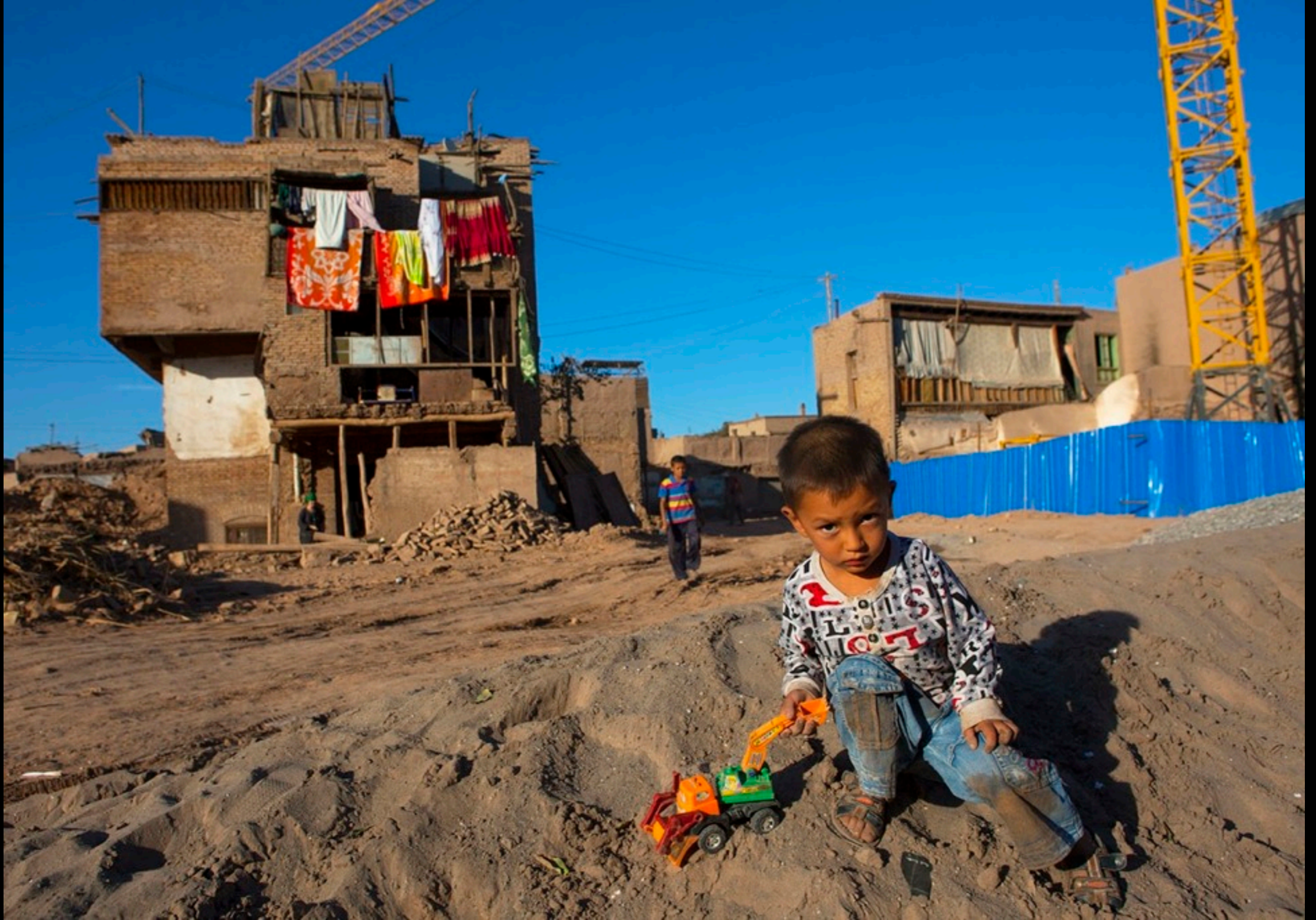
Destruction of ancient Uyghur houses in Kashgar. The government claims it's demolishing the houses due to seismic and insalubrity issues. "It's not just our houses that are being demolished, the Hans are destroying our souls" says an inhabitant forced to flee the old city.