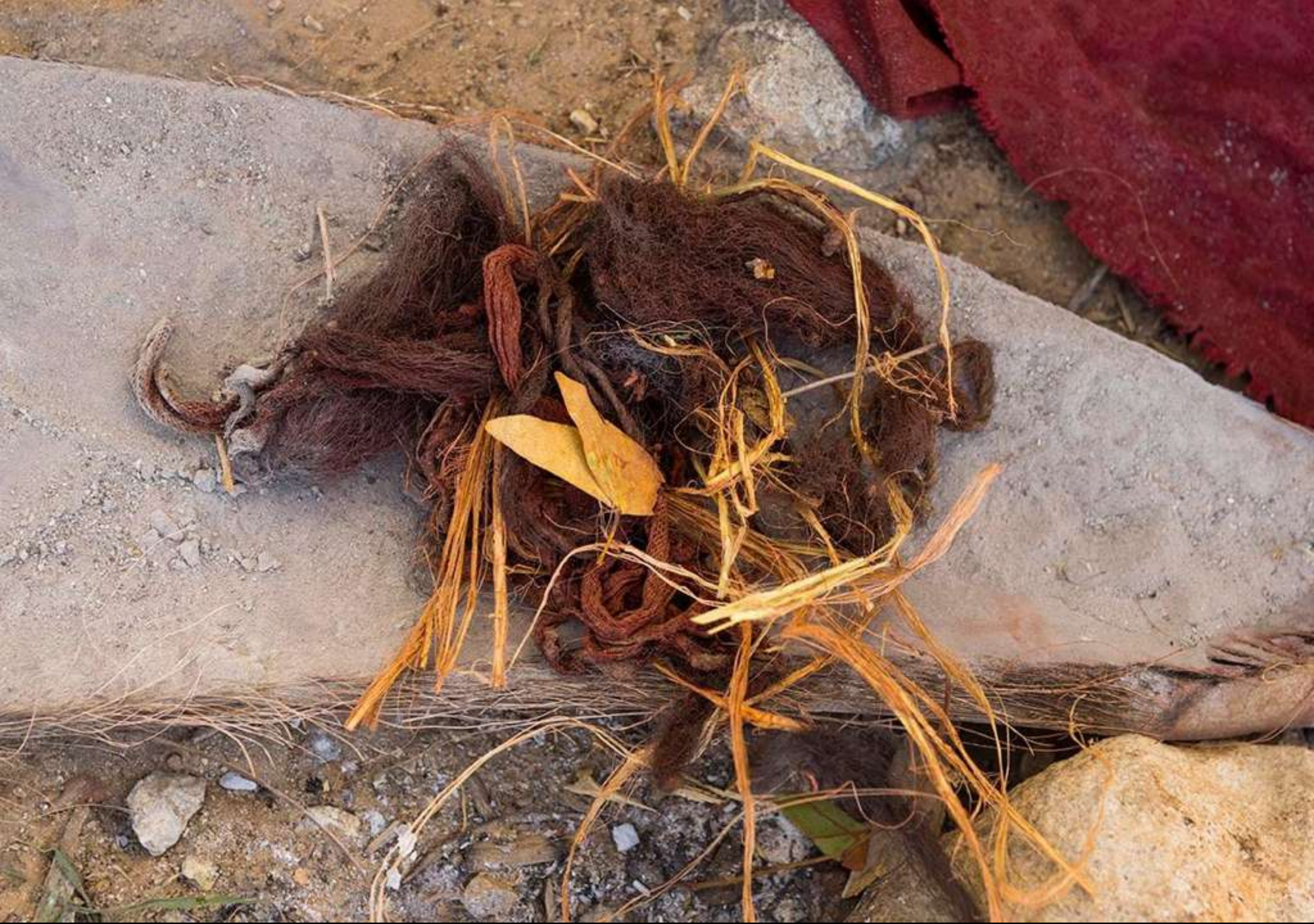
They use all kind of things, from hair to straw! Some Hhimbwas even start to buy some indian hair extensions in the little towns!