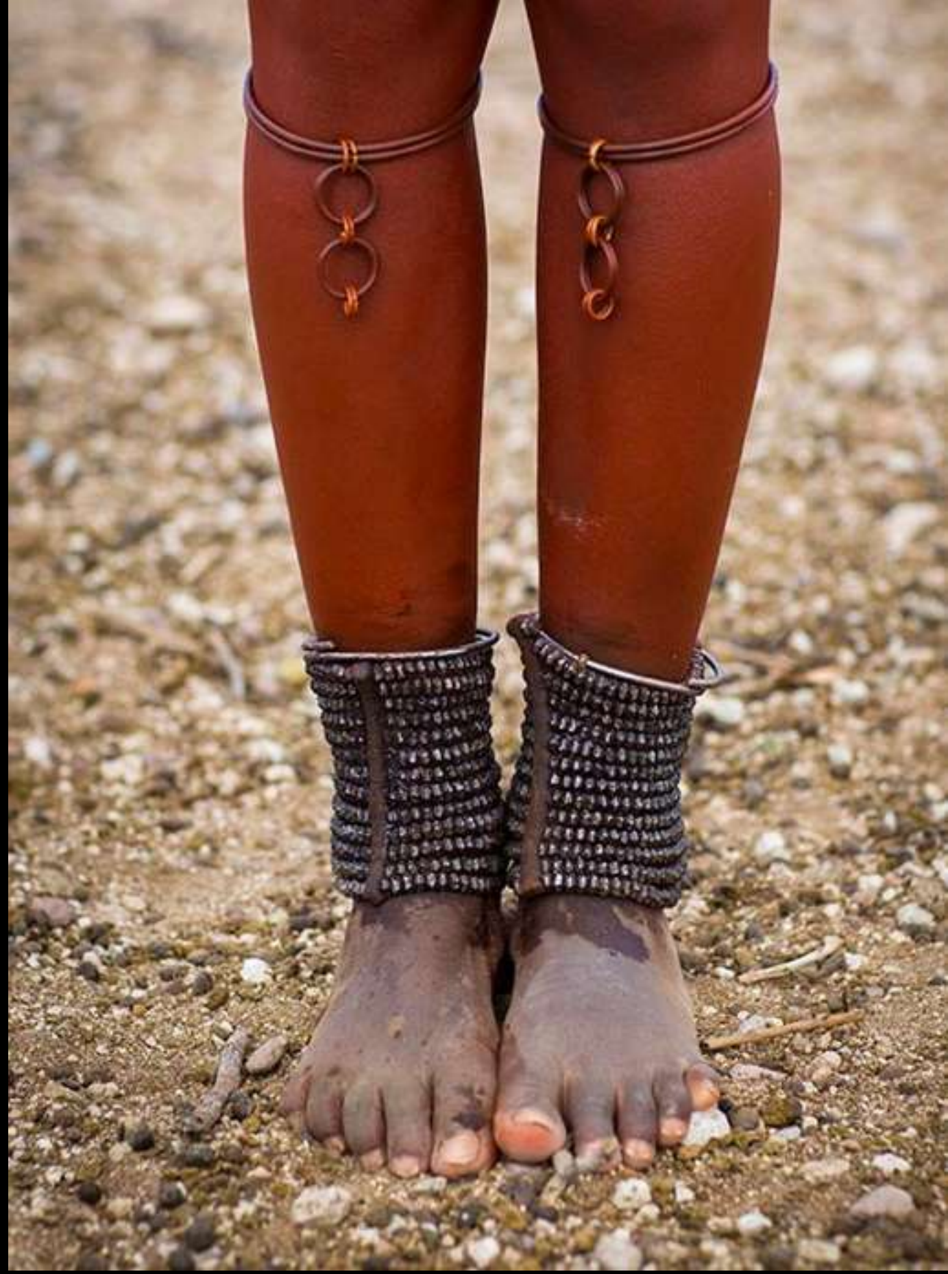
When kids get pens from the tourists, they like to put pen ink on their feet nails!