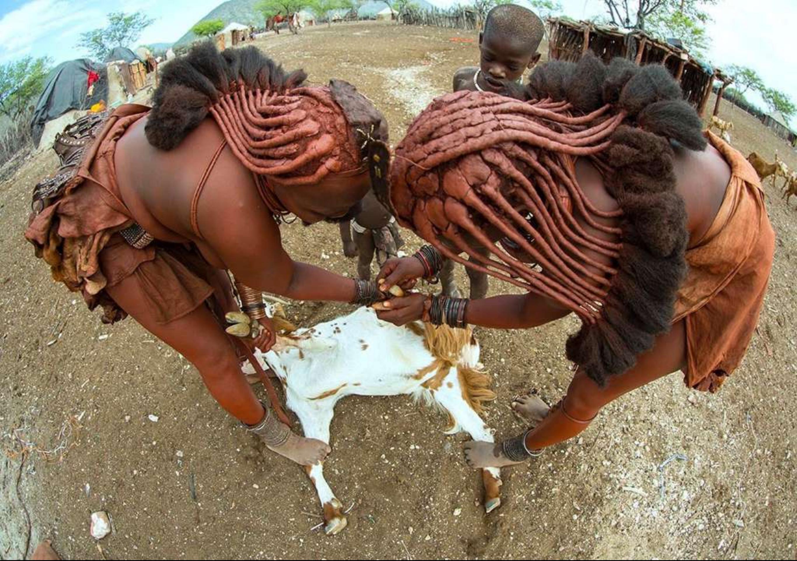
Women removing ticks from a goat foot. Despite the fact they are living in little villages, Himbas are rich people: owing to their herds, which can reach 100 to 200 cows. They will never say how many cows they have as they keep it secret to avoid thieves...