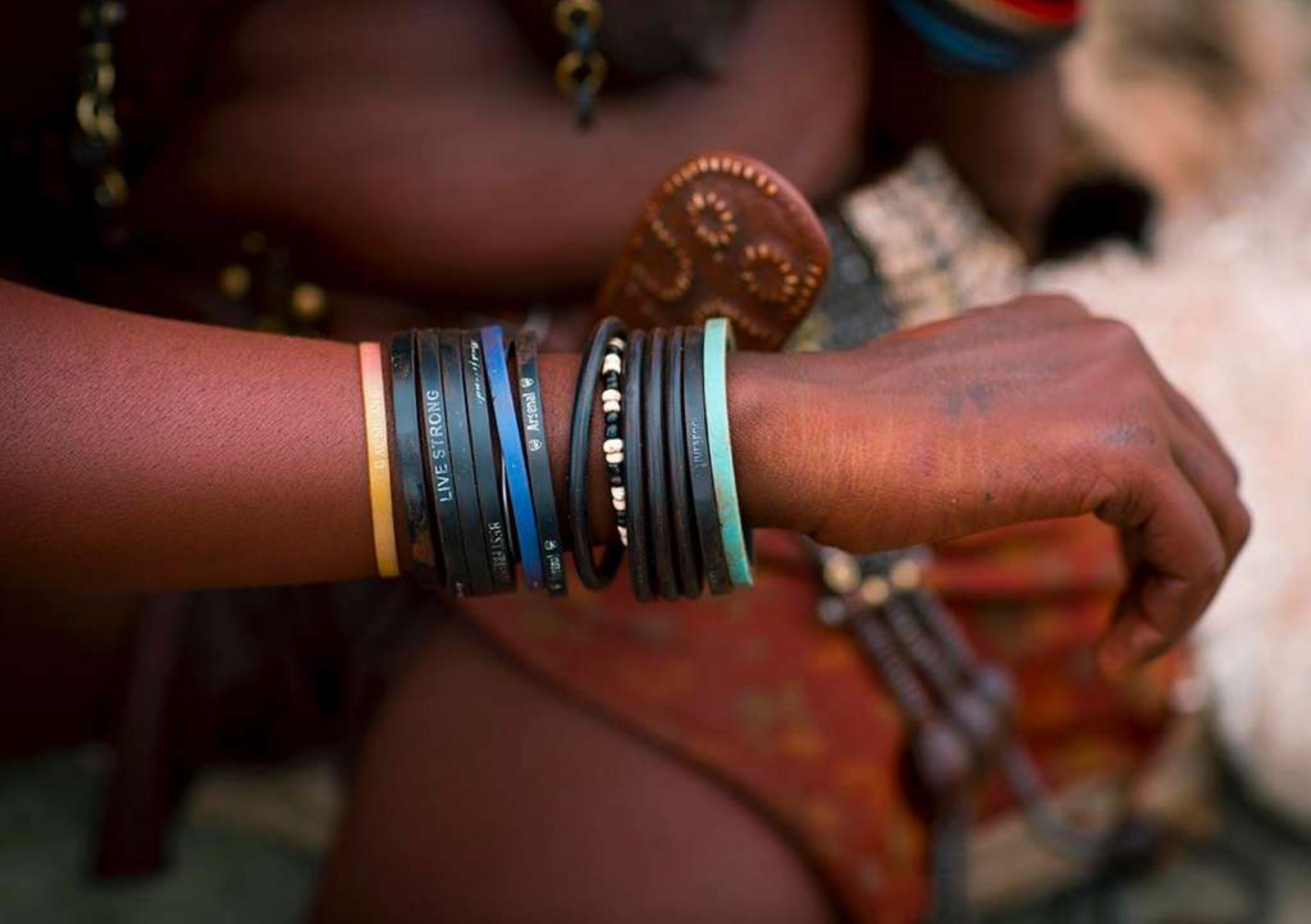
The new ones are made with PVC tubes or given by tourists!