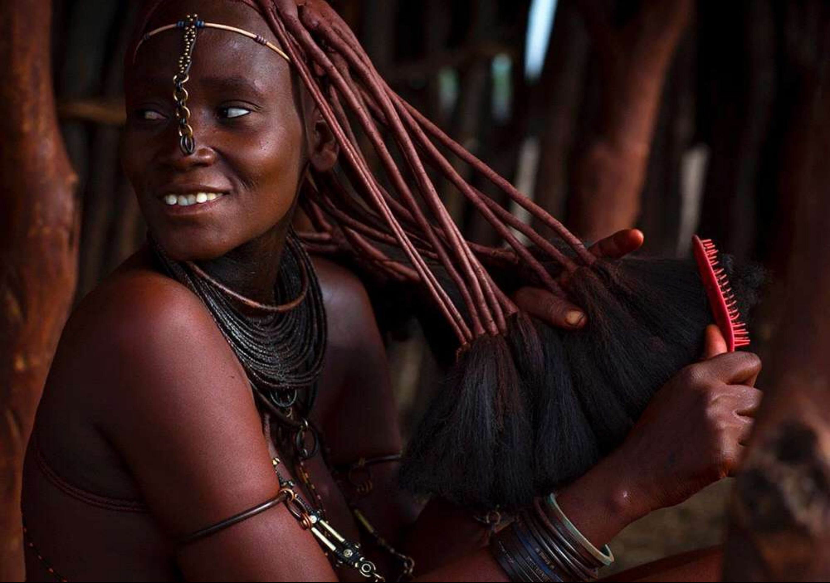
The Himba women take several hours each morning for beauty care. The first task is to take care of their dreadlocks.