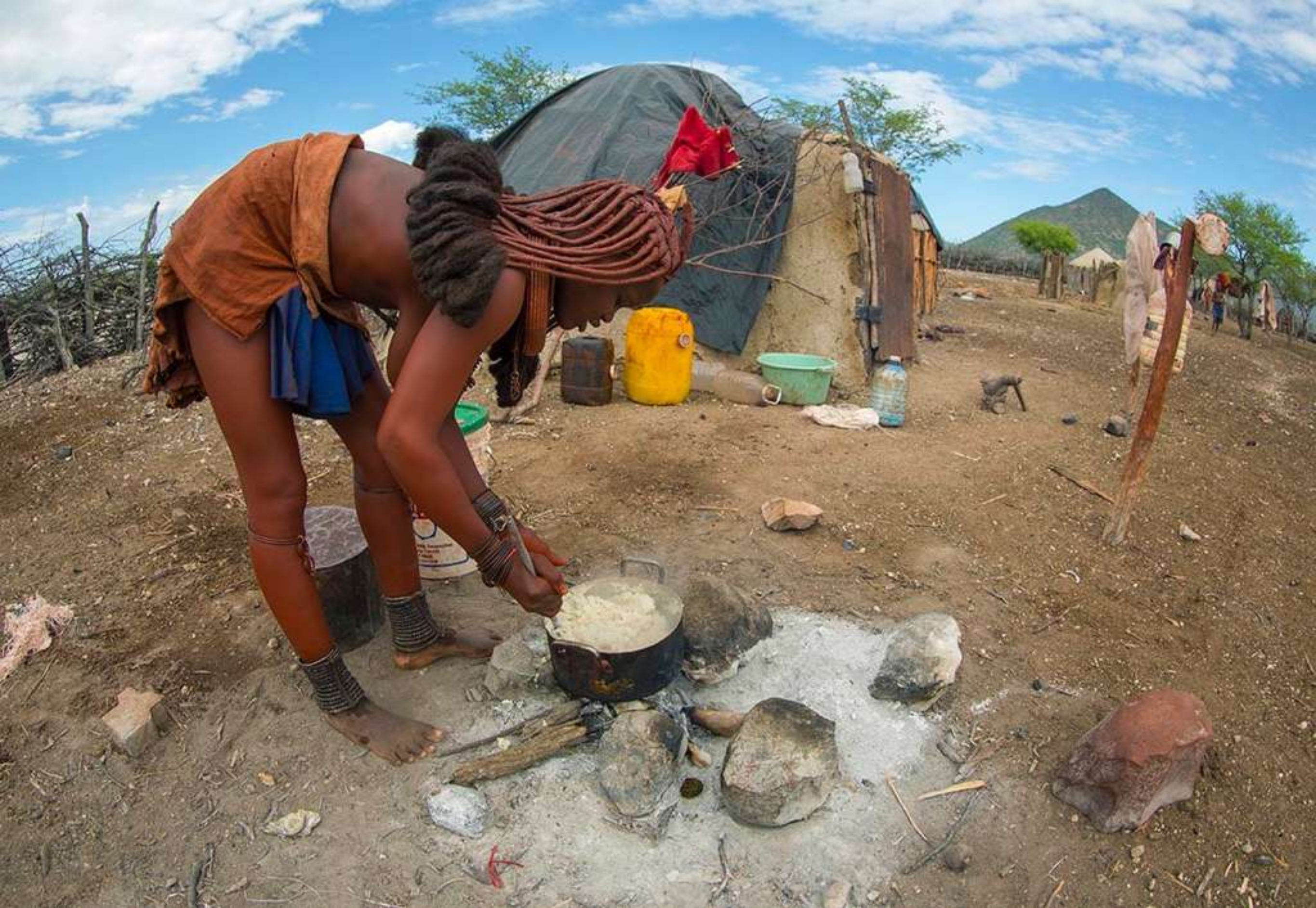
The diet of the Himba consists mainly of porridge mixed with milk. Meat is sometimes eaten, usually at a ceremony, when cattle may be slaughtered. Men in the village who are married eat meat specially kept apart for them.