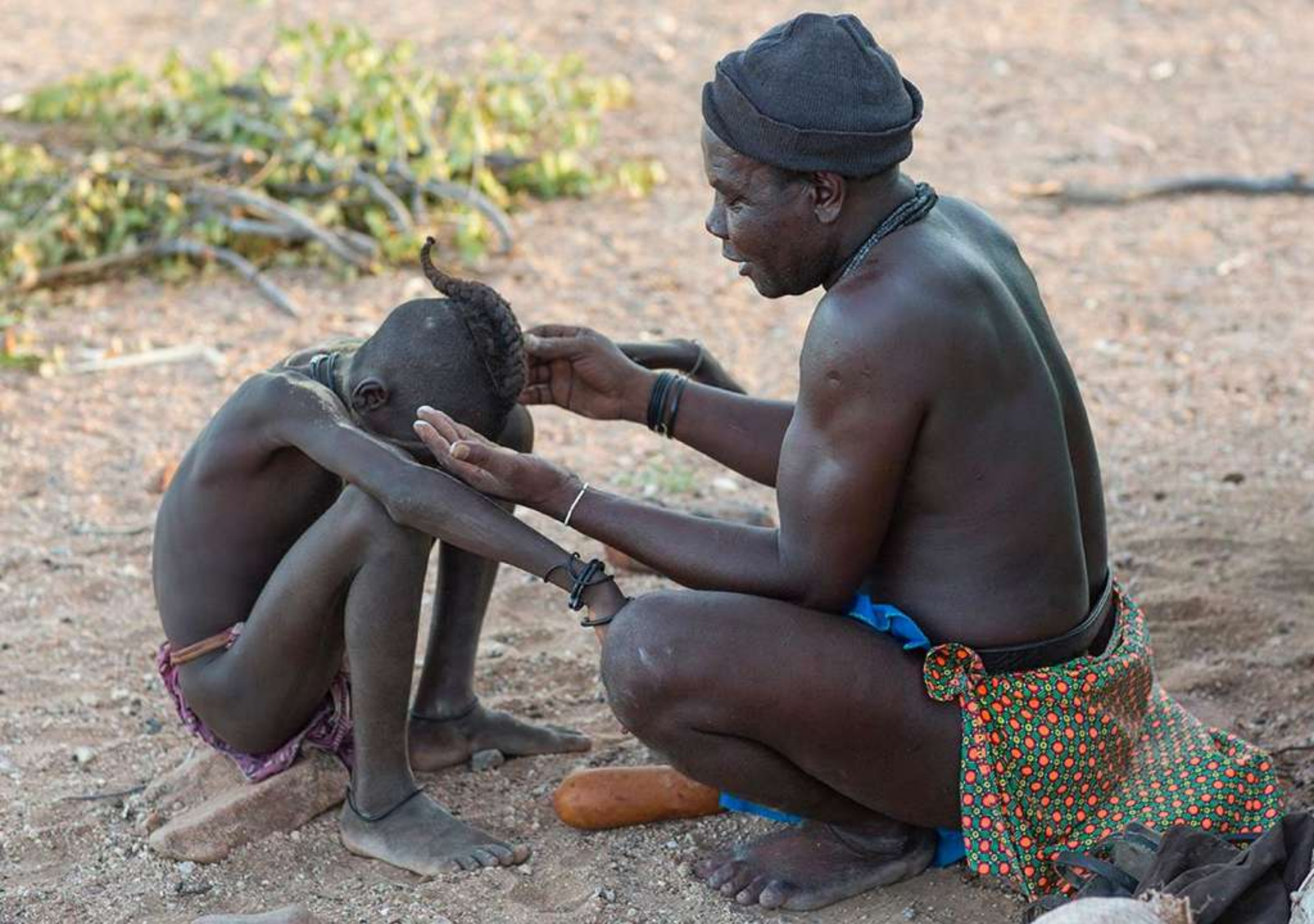
Witchdoctor is called as bad things have happened in the village. Nobody wants to tell what, it is taboo. The man will purify with magic sentences everybody, from the babies to the elders all day long until the sunset.