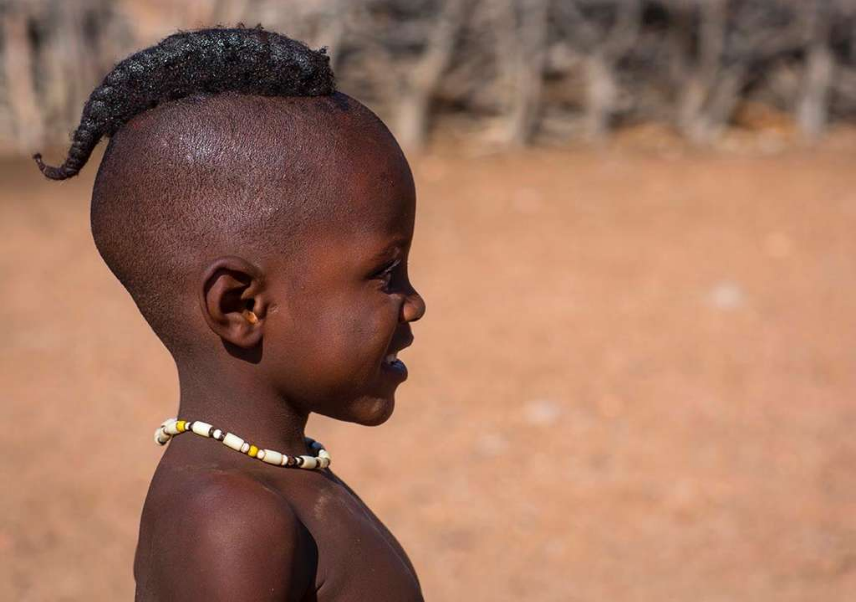
This boy is not yet a teen.