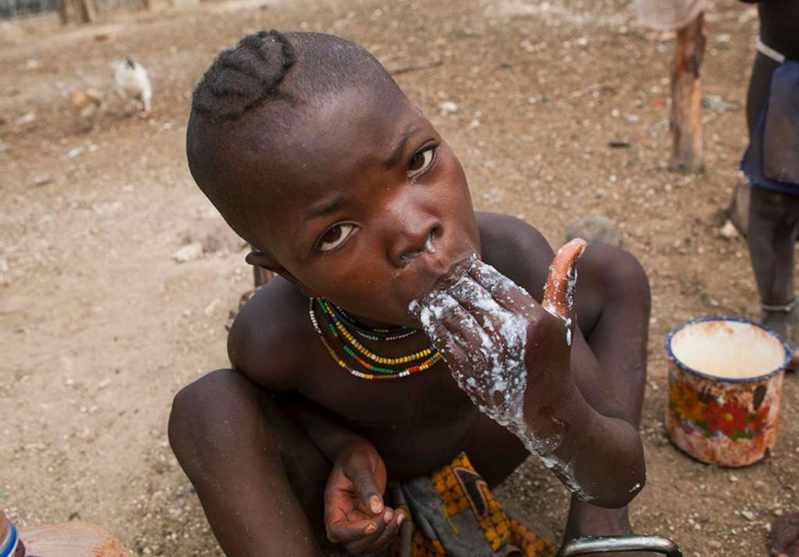
Lunch is not a social thing in Himbas, kids eat when the food is ready or when they are hungry. Do not try to explain them that putting elbows on the table is rude!