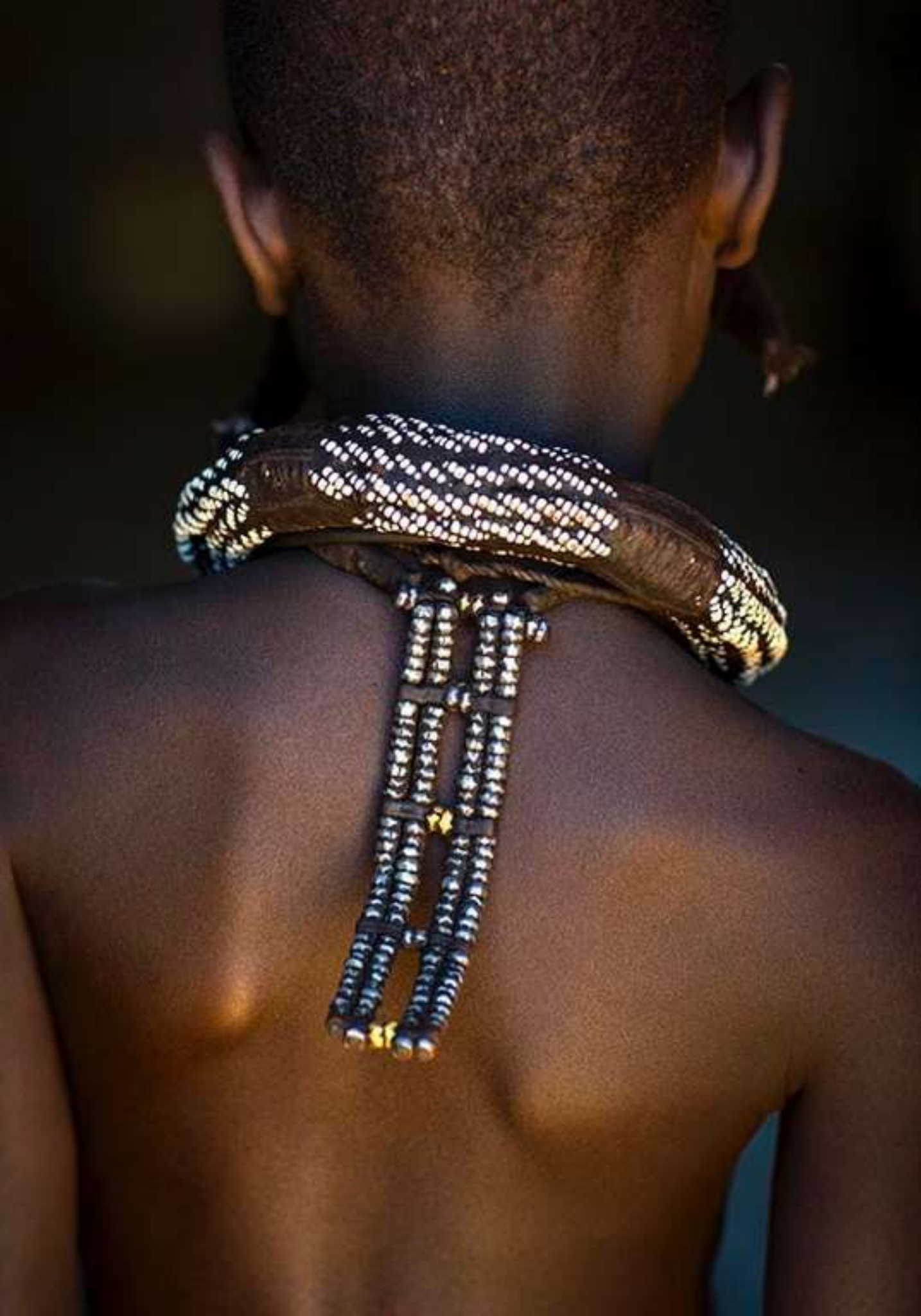
Back decoration of a young girl