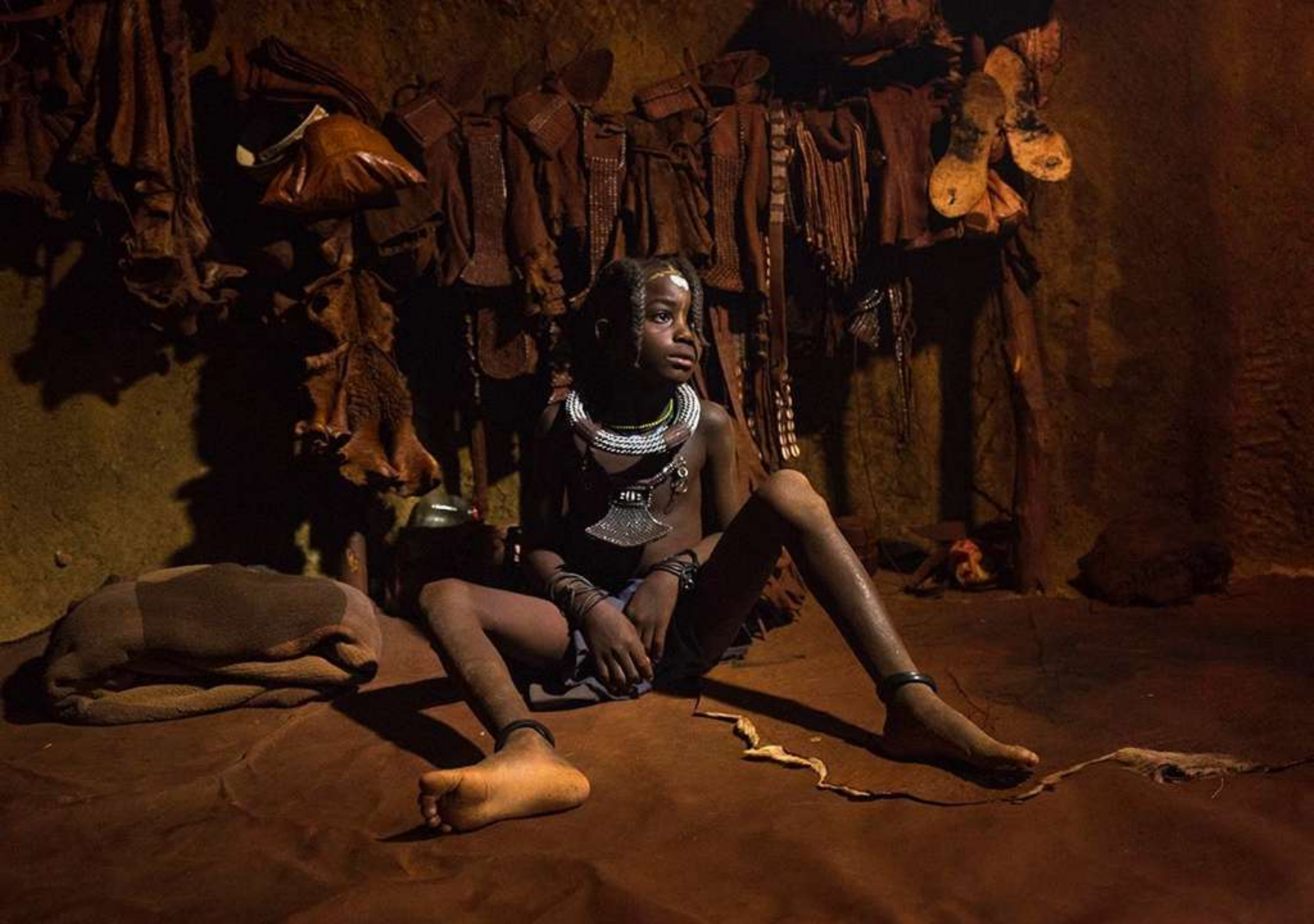
Inside the house, just cow skins as bed, and on the wall, the goat and cow skins for daily life and celebrations clothes.