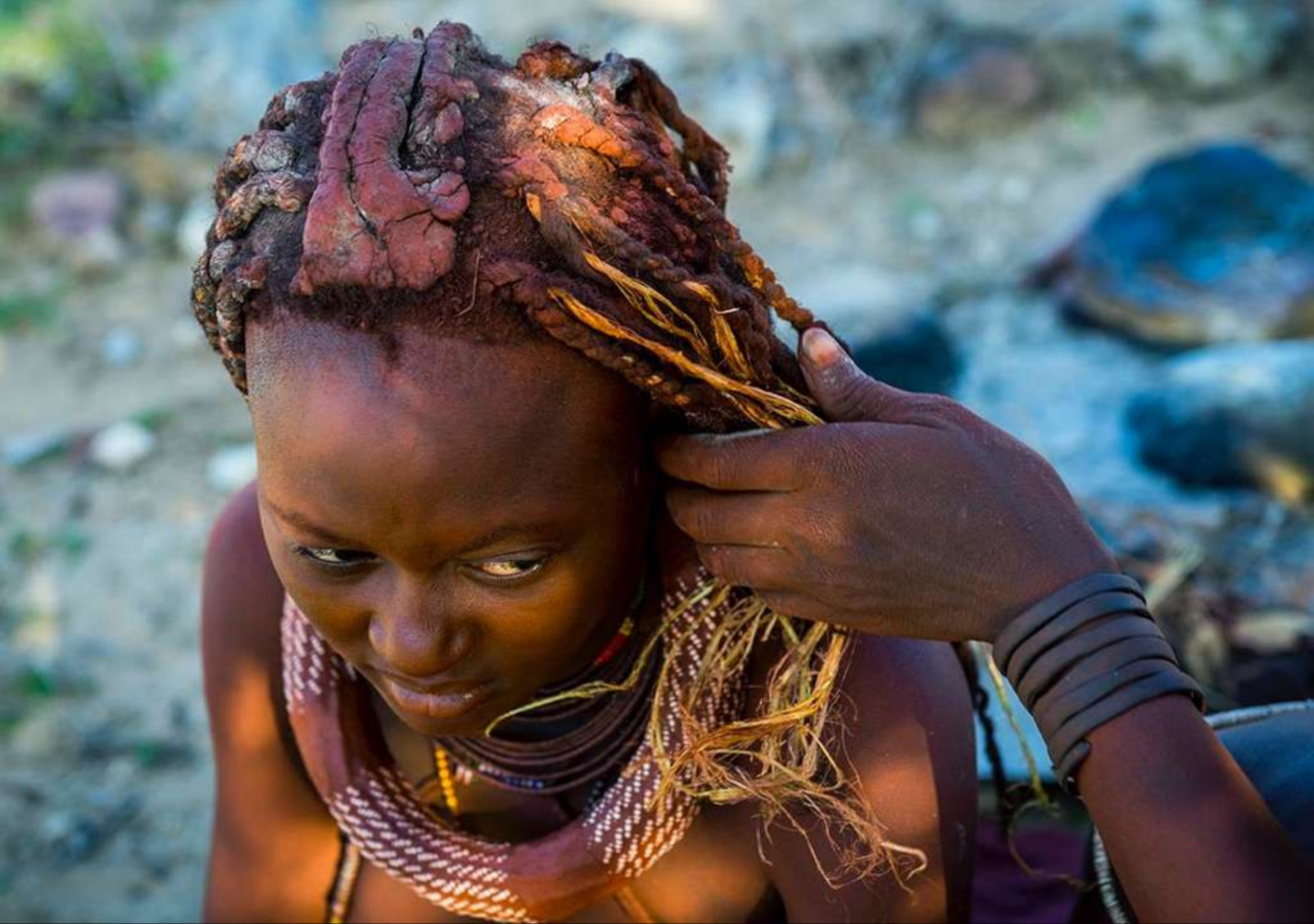
Himbas woman secret of their dreadlocks: they use a lot of different things to build them before covering with Otchize.