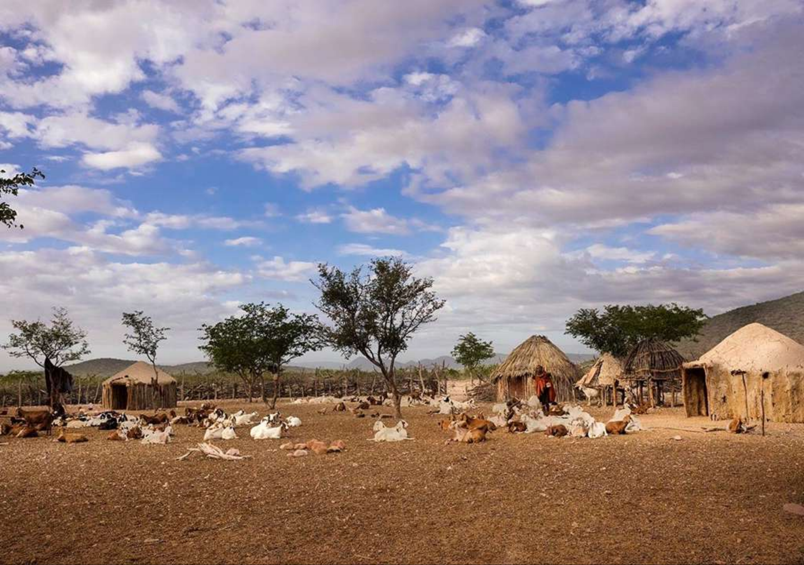
Himbans live in small villages which welcome most of the time just one family. Enclosures for the cattle (the krall) are always located in the centre of the Himba camp, surrounded by a circle of huts. A fence of Mopane wood, strong and very durable surrounds the village.