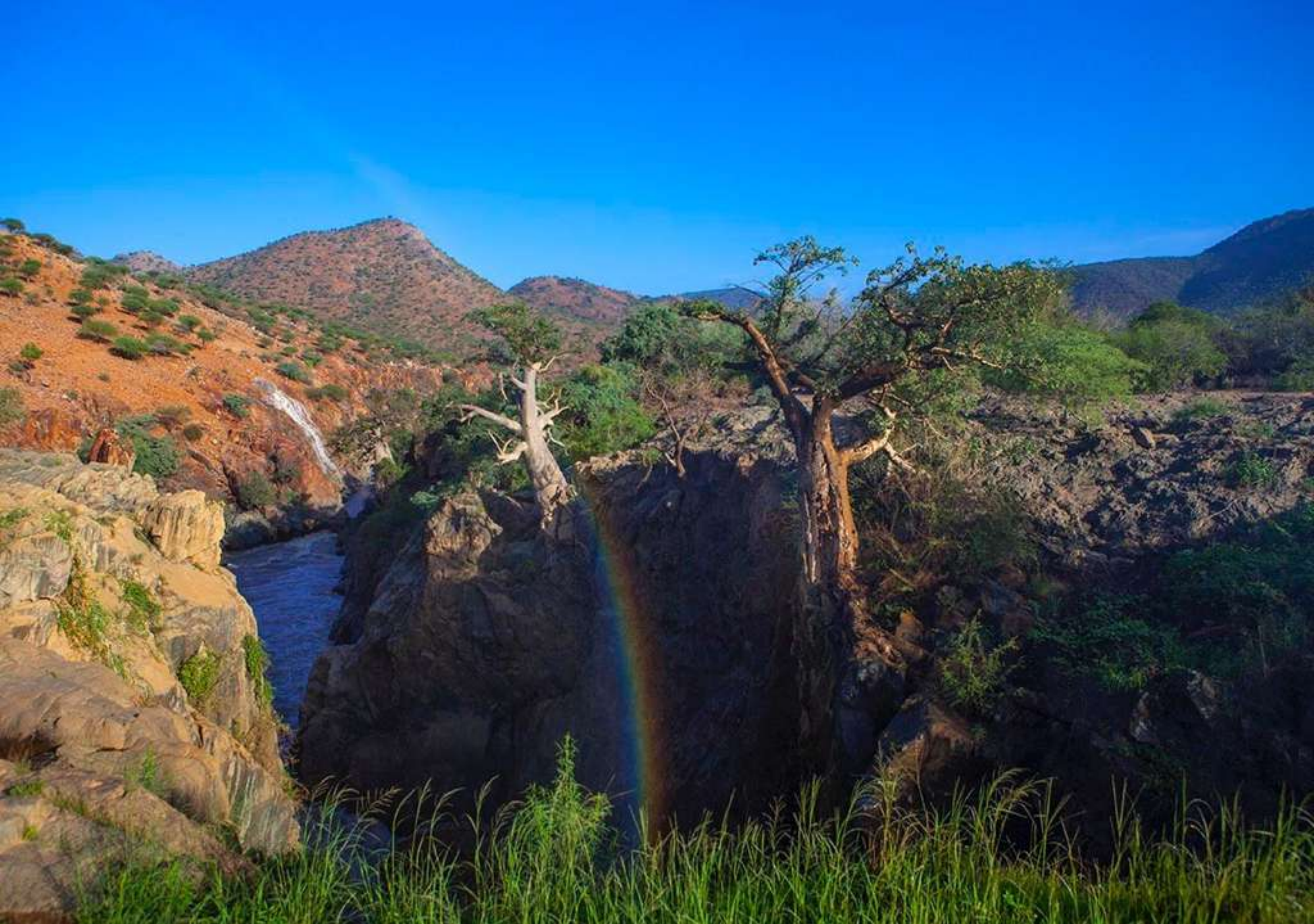
Epupa falls on Cunene river. there are projects to build huge dam which would cover the tombs of the Himbas....In exchange the government promises to build schools and clinics. The negotiations are on.