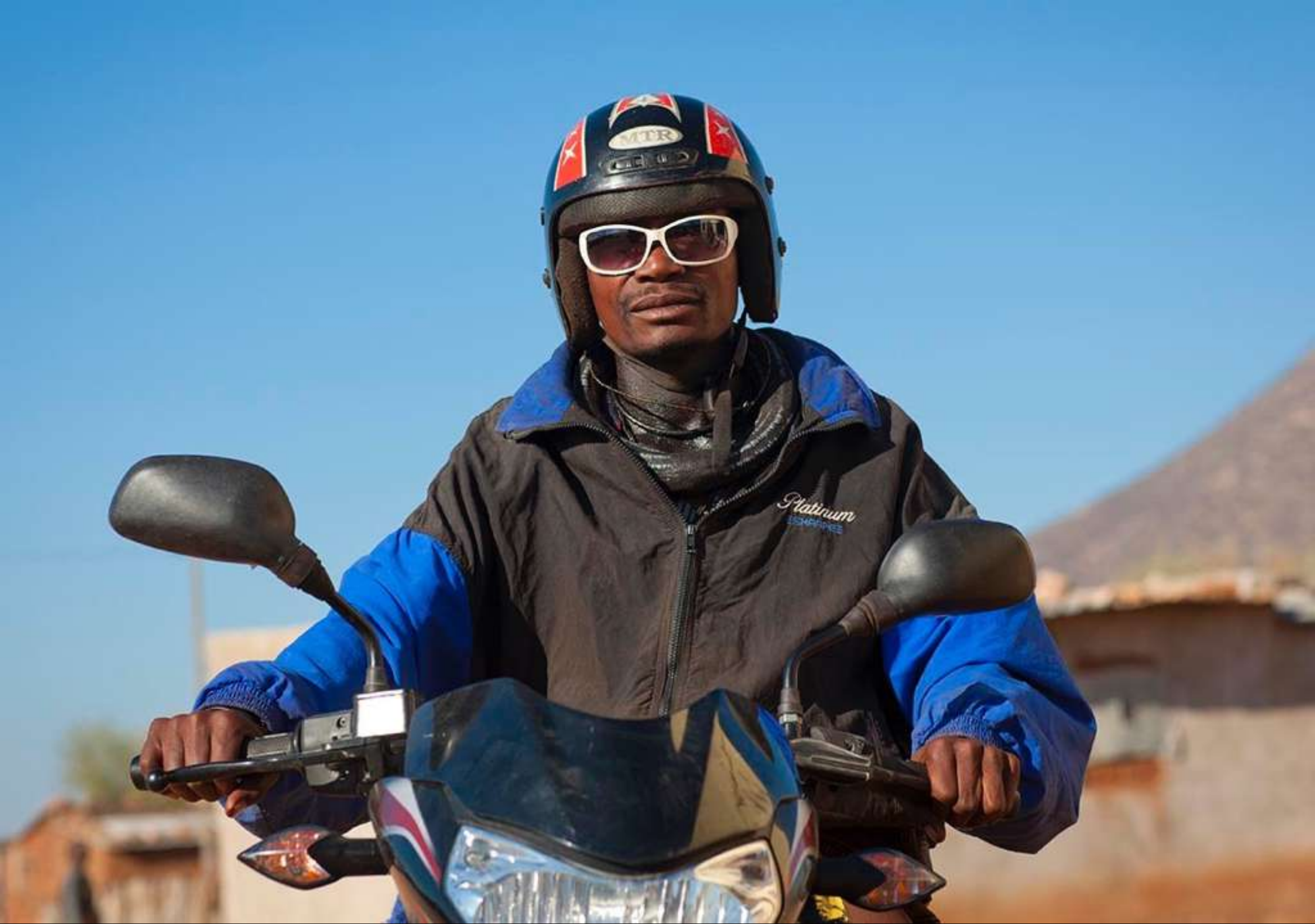
Modernity is coming in Himba tribe, some forgive the traditions, some mix them like this man who kept his huge necklace!