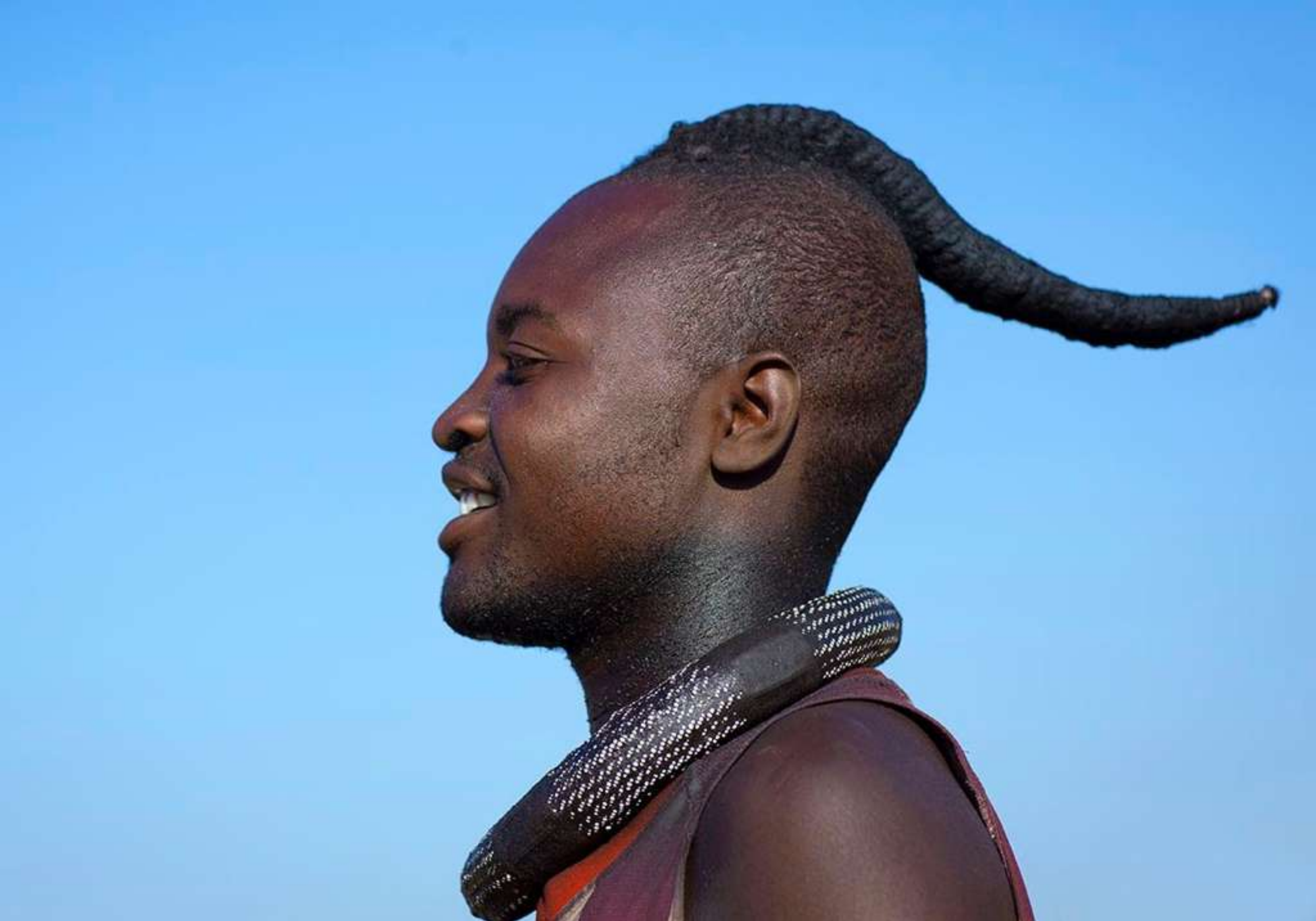
Hairstyle indicates the status of people. Single men are recognizable by the plait on the back of their head (called an « ondatu ») with the rest of the head being shaved.