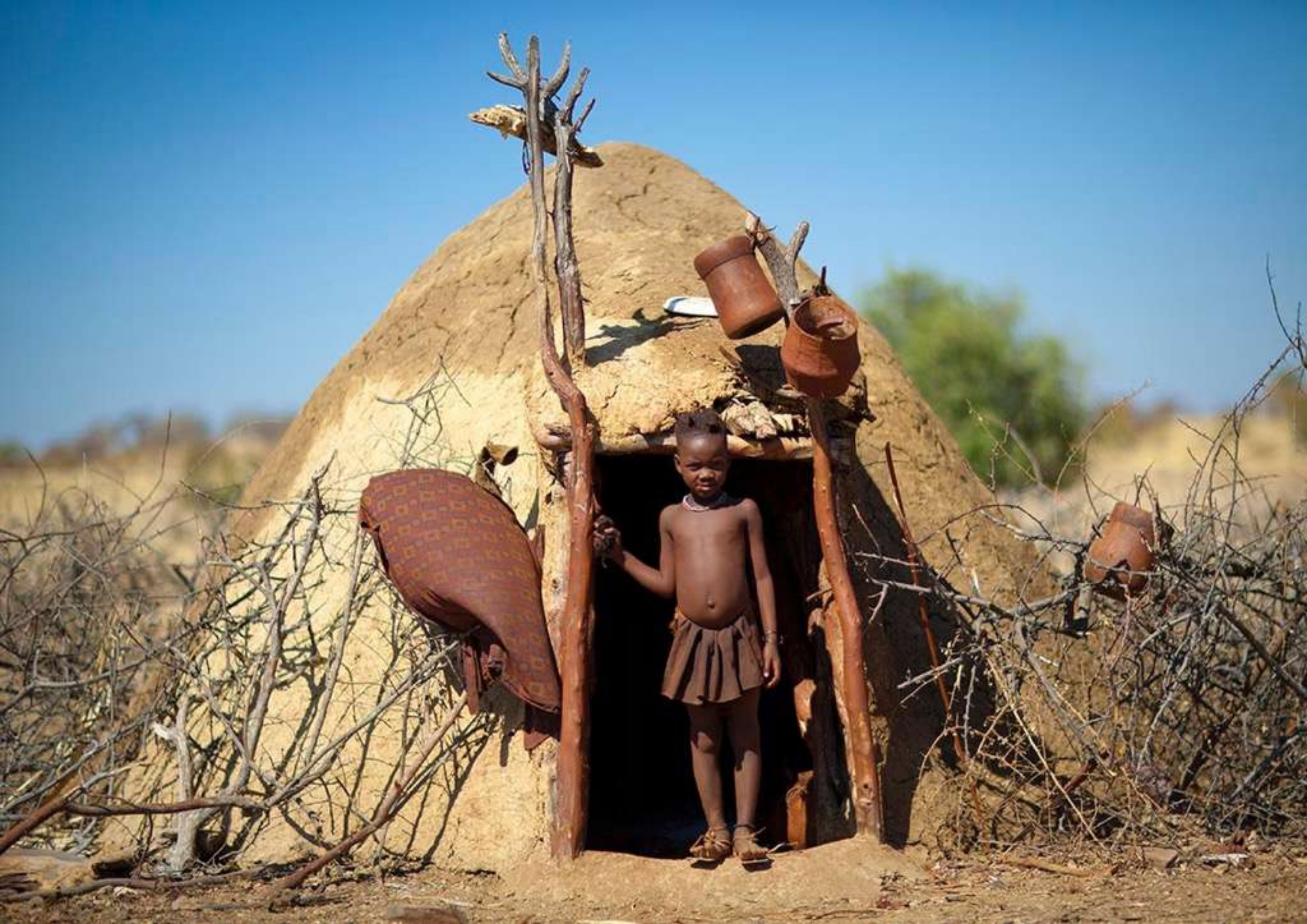
The Himbas move from place to place to find better graze for the goats, but use to come back in the same villages.