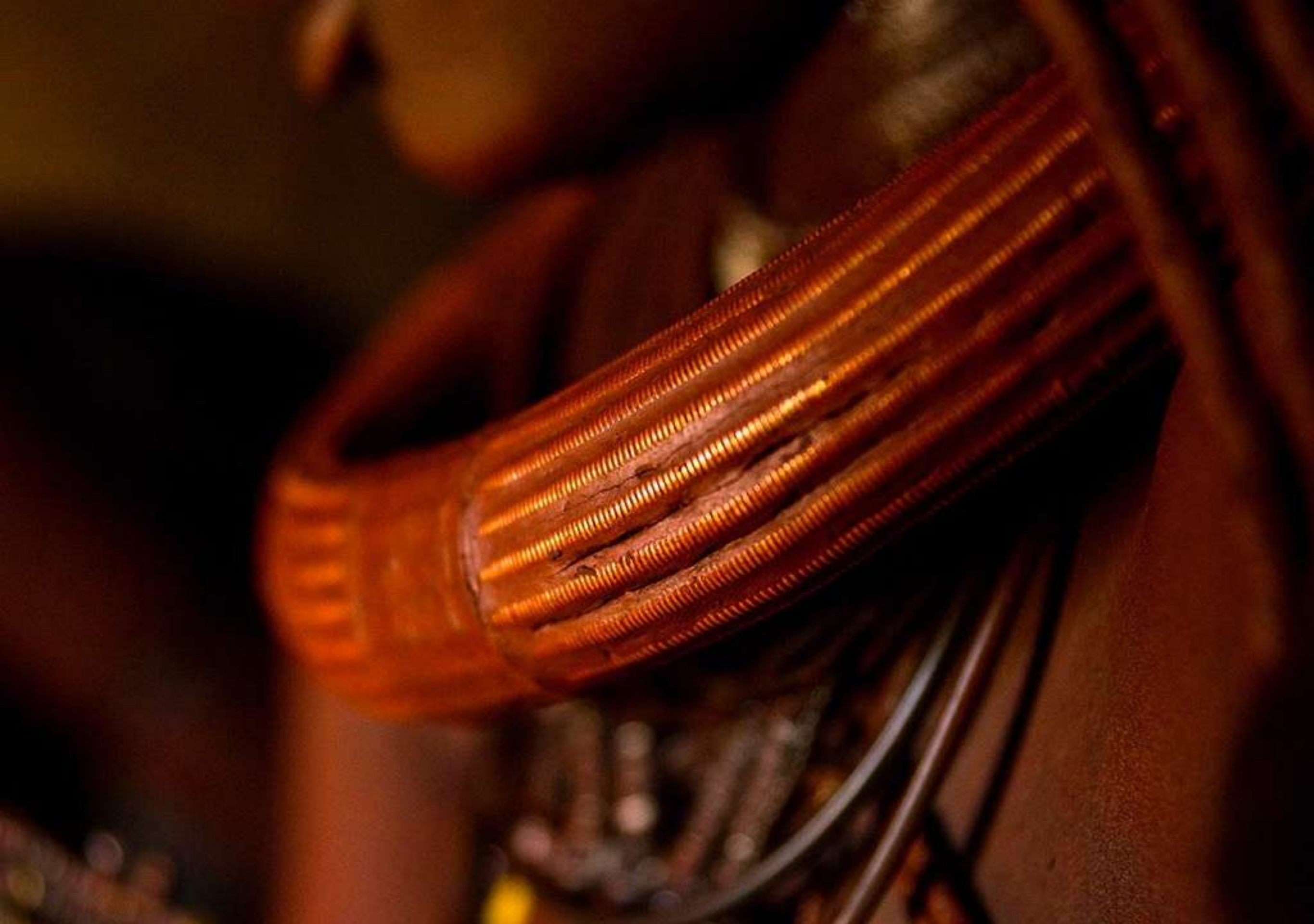
Adult married women wear copper or iron necklaces who are very heavy.