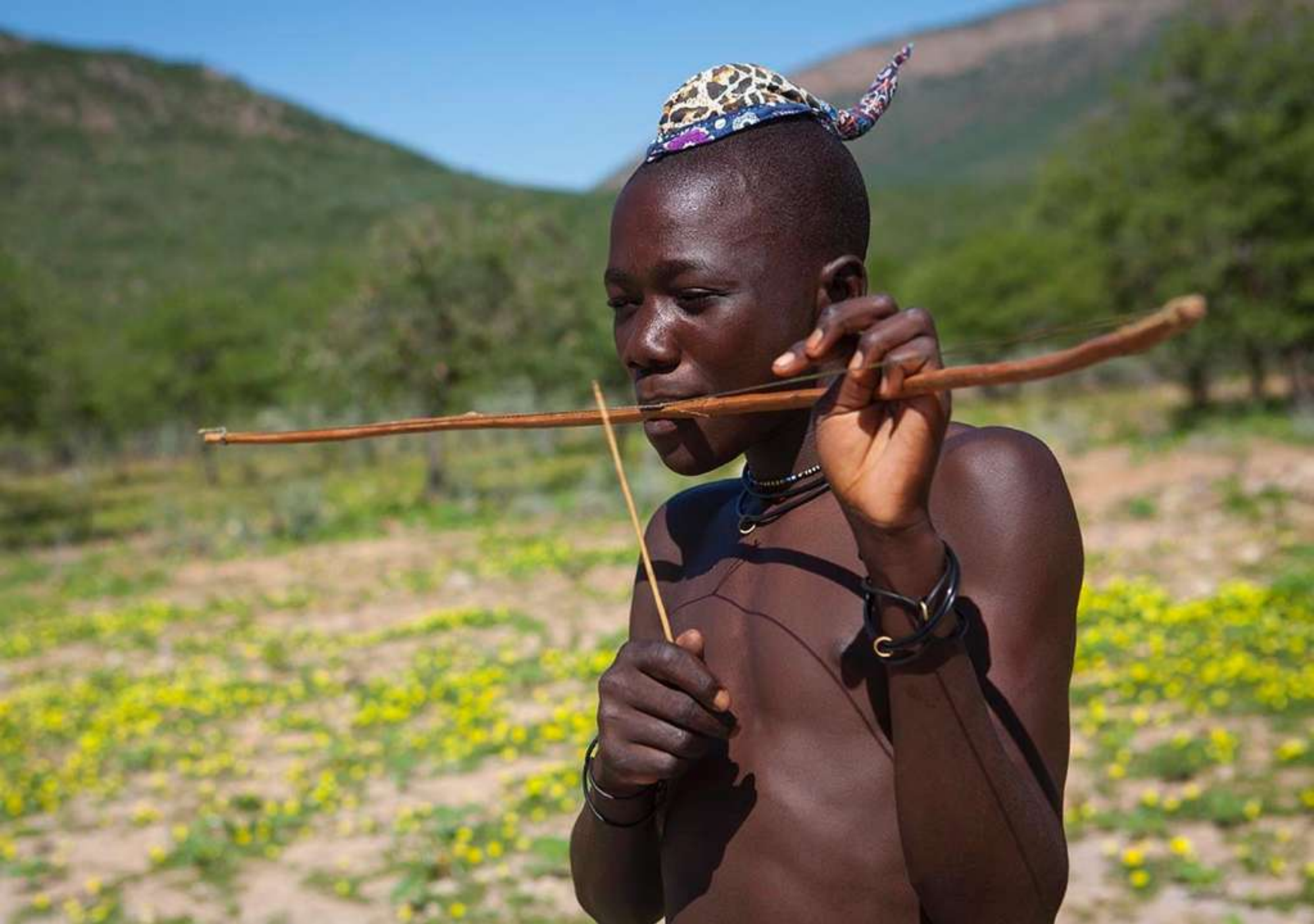
Himbas have a lot of traditions about music and dances. This man was spotted in the bush while he was keeping his goats. For his pleasure he was playing music with his Ohuta, a musical bow.