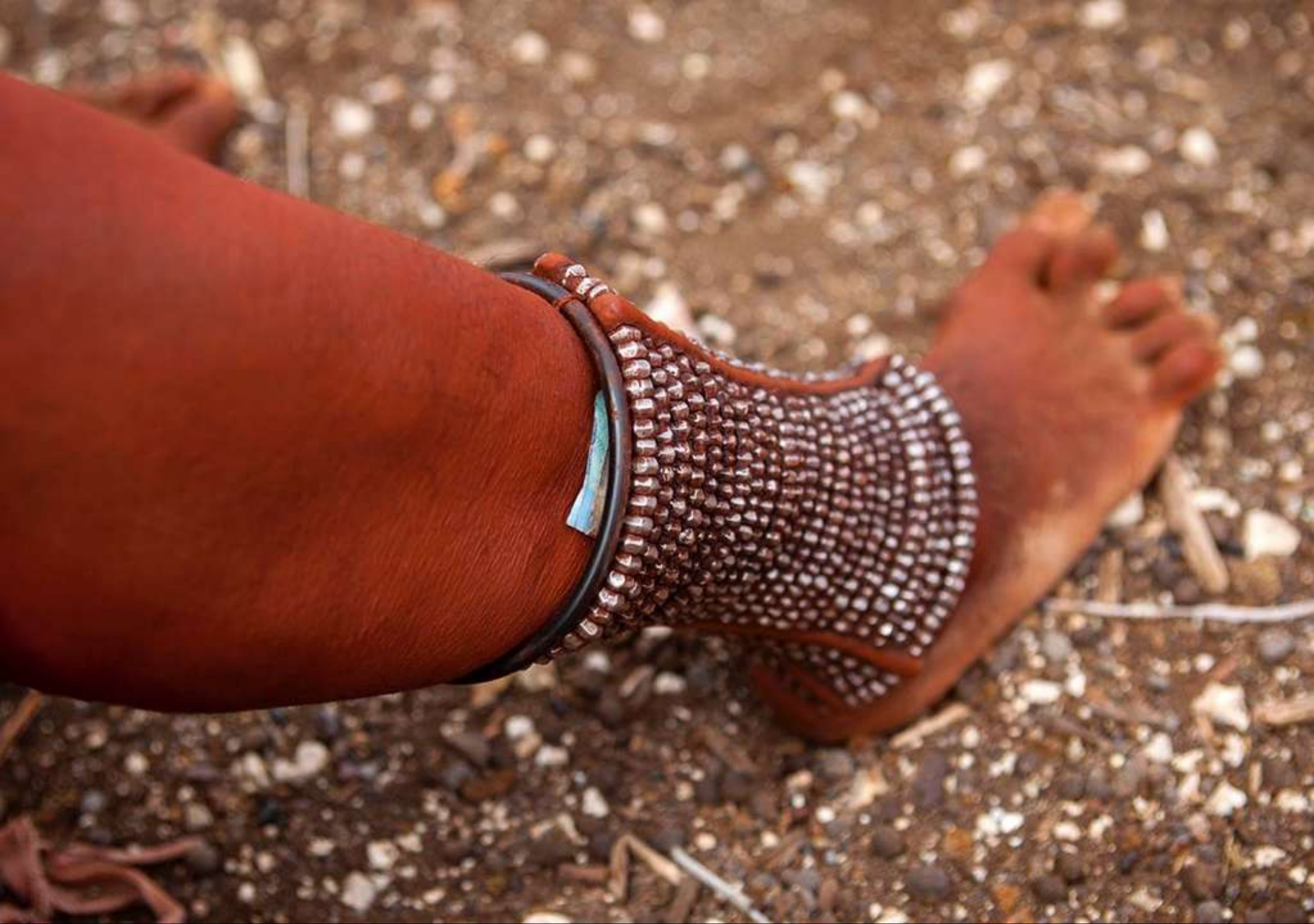
Omohanga, the Himba purse made from beaded anklets that only wear the adult women, it is also to protect their legs from venomous animal bites.