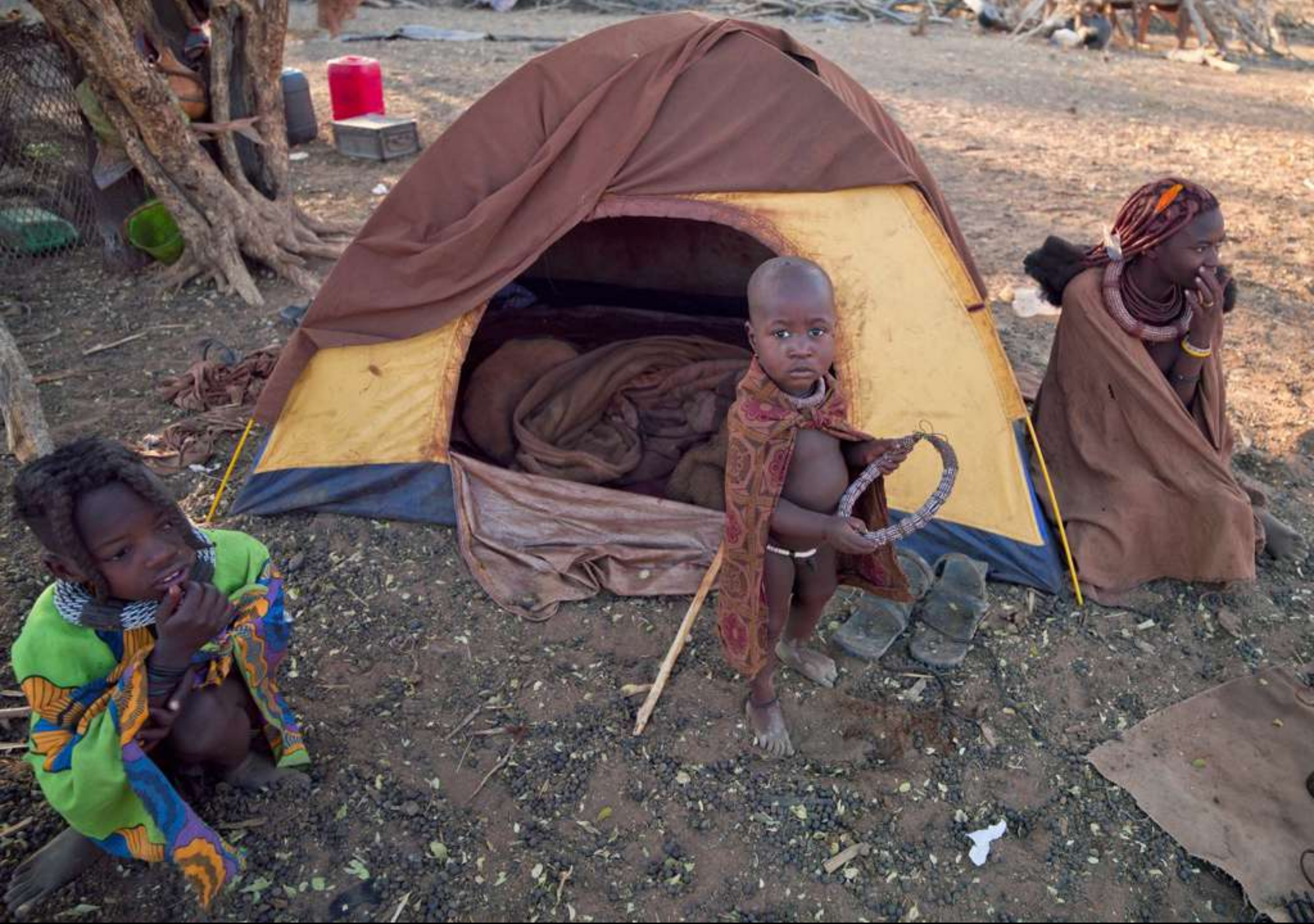
More and more the Himbas who live near the villages tend to use modern stuff. The next step will be the when they'll stop using their traditional clothes.