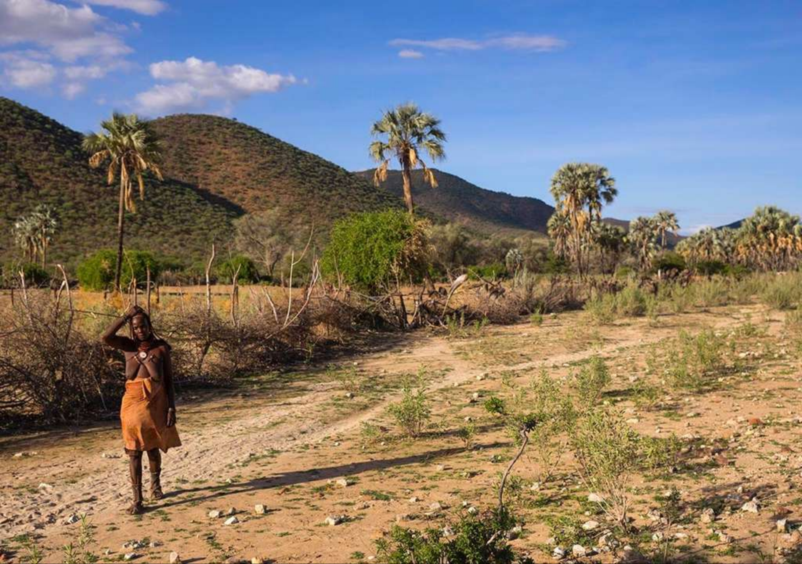
Himbas pastoralists live in the Kaokoland, an extensive territory in the North West of Namibia sharing a common boundary with Angola in the North. The Atlantic Ocean and the Skeleton coast form its Western boundary.