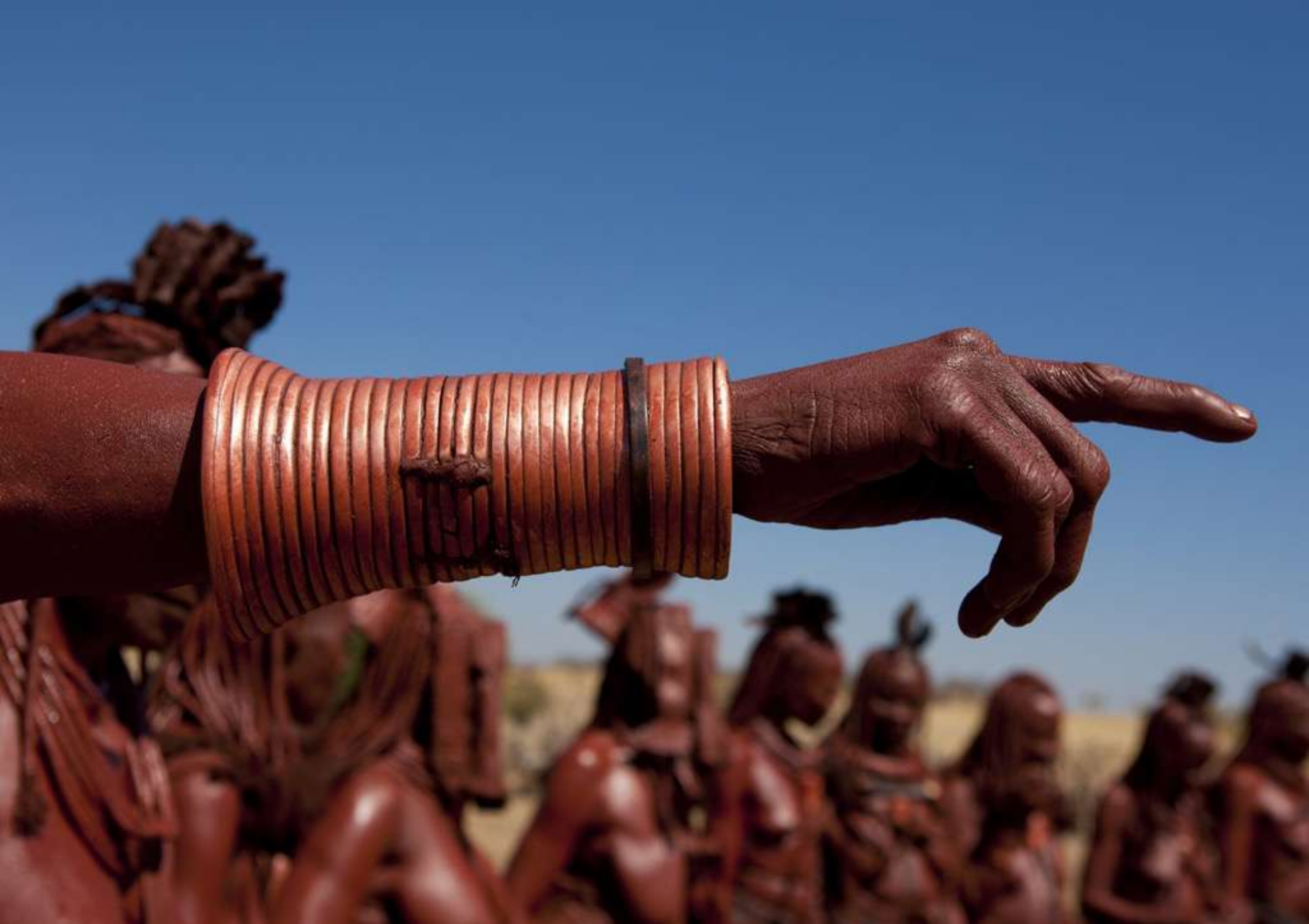
Adult women wear heavy iron or copper necklaces, that can weigh several kilos