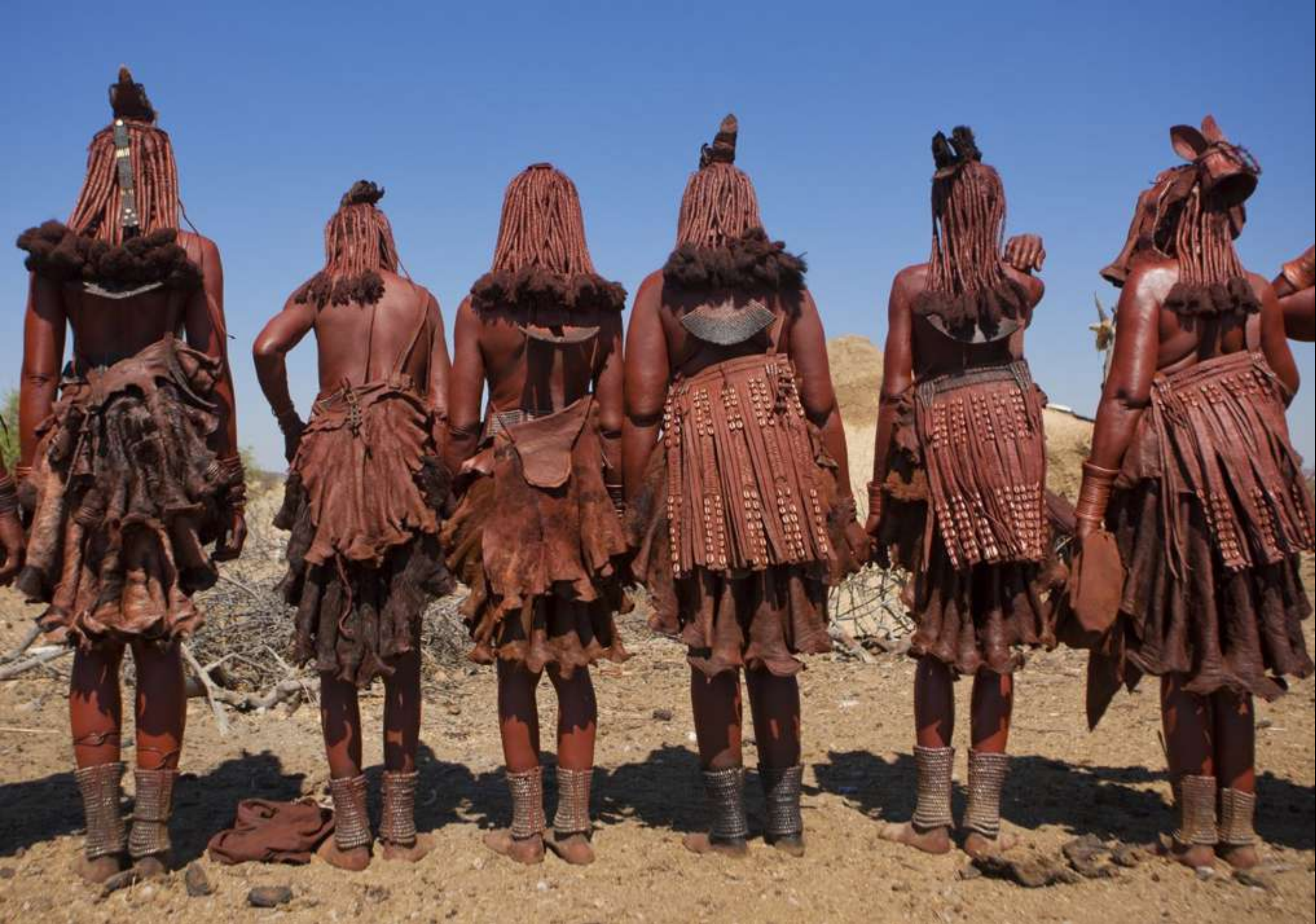
The mixture is not only smeared on to their skin and hair but also their clothes and jewellery. Himba women are fiercely proud of their traditional dresses.