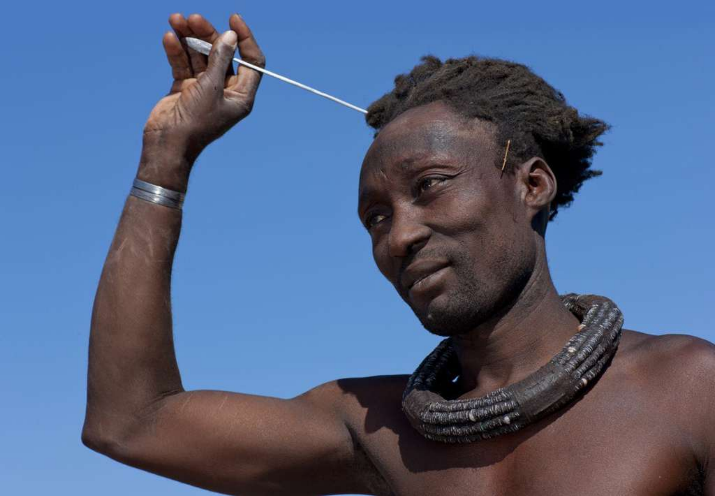
Only when they are mourning the Himbas men let their hair visible.