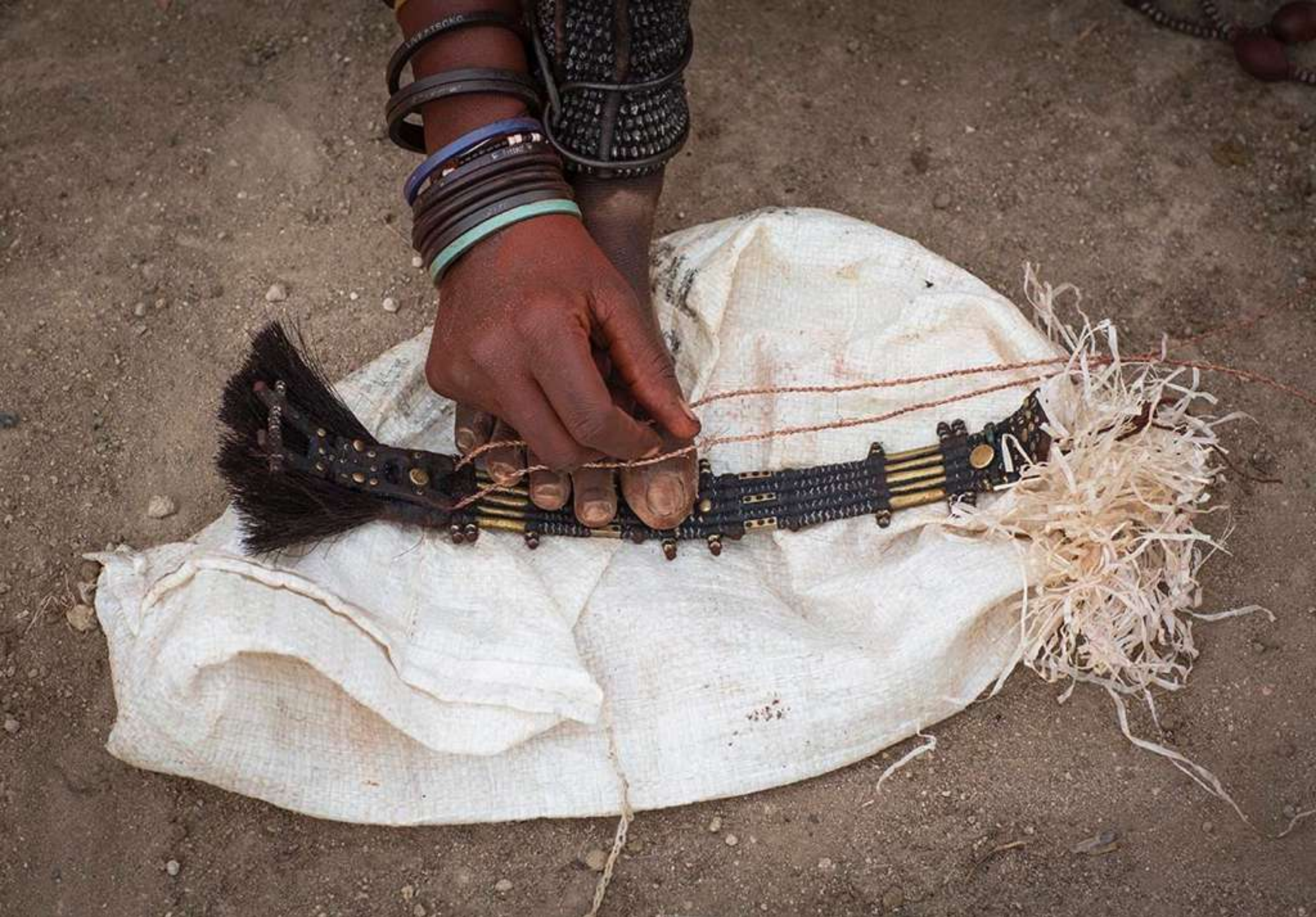
Himbas use the wires of the electric fences to make their jewelry.