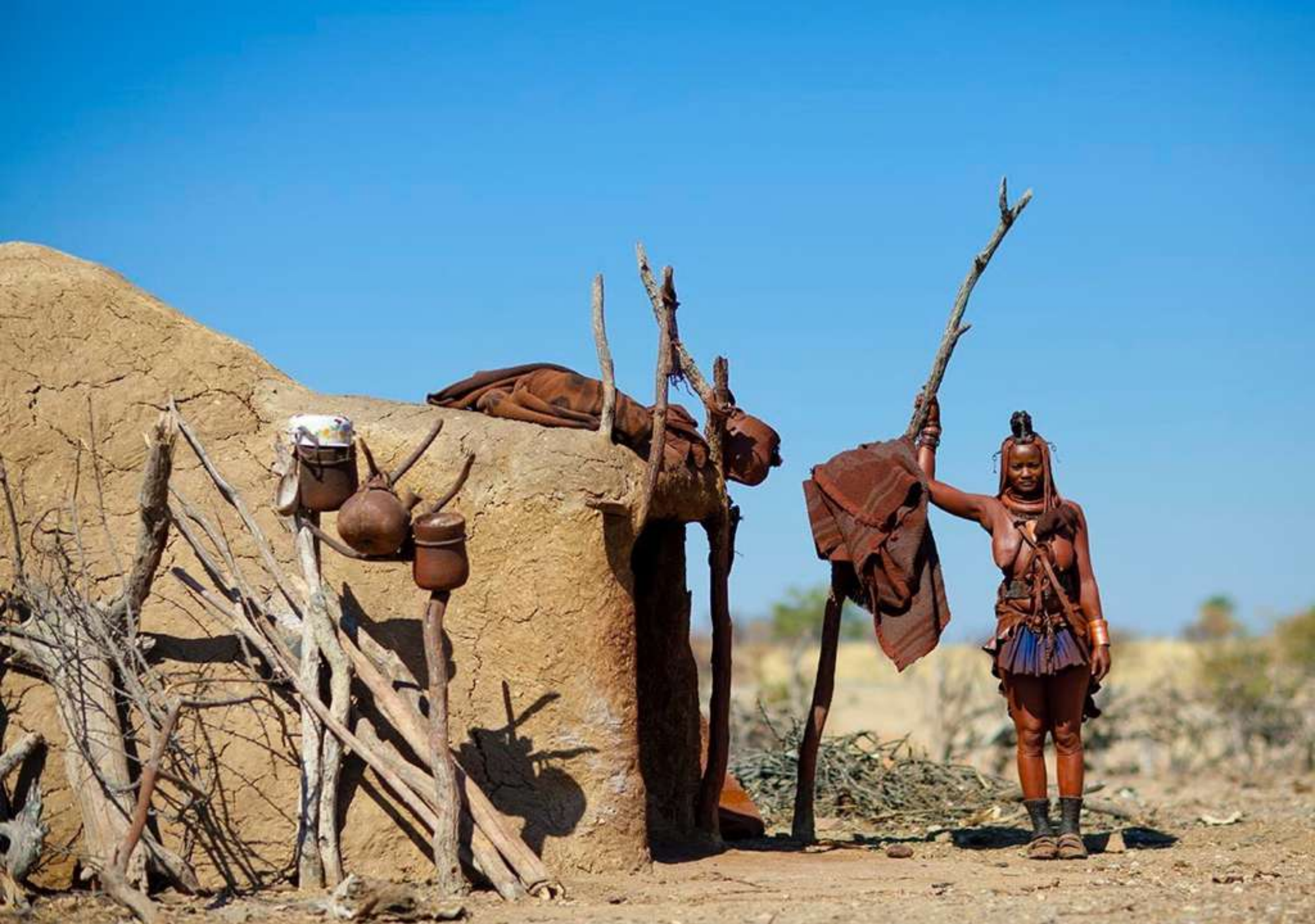
The house is made with mud and cow dungs. It keep the freshness in daytime as it hot, and the heat during the night as it is very cold in north Namibia. In summer, temperatures reach 45 degrees, in winter, it is freezing!