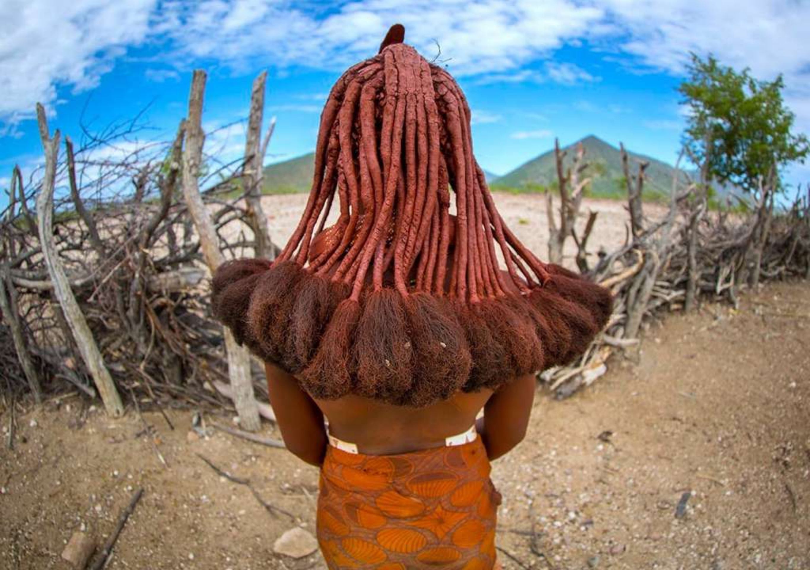
Himba dress codes and hairstyle rules are very complex. Himba hairstyles are really meaningful as they enable to identify their social status.