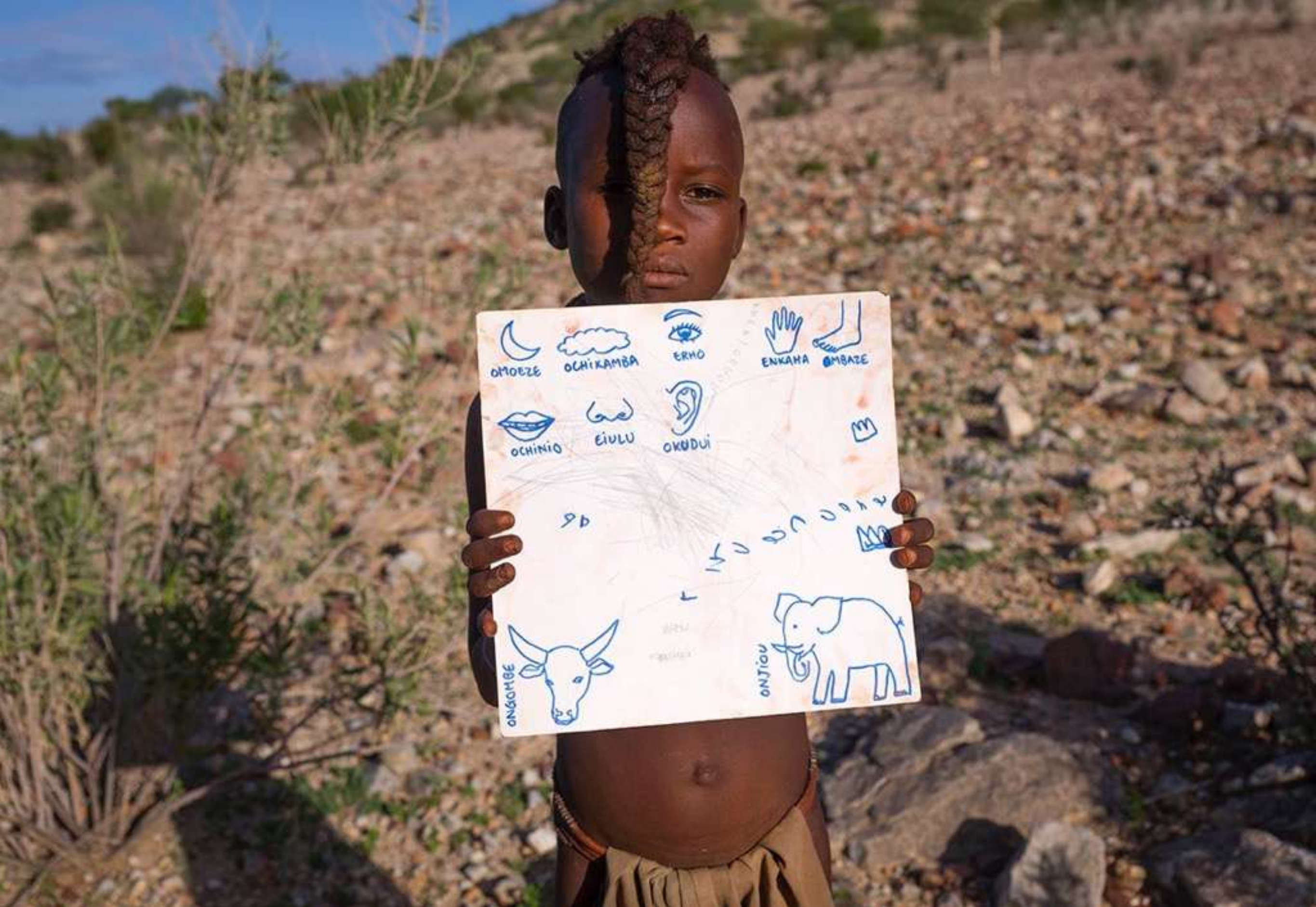
There are several initiatives for Primary education. If teens wish to continue with a secondary education they have to leave their villages and board at a school usually in Windhoek. Many of the young never return to their villages as they find work elsewhere.