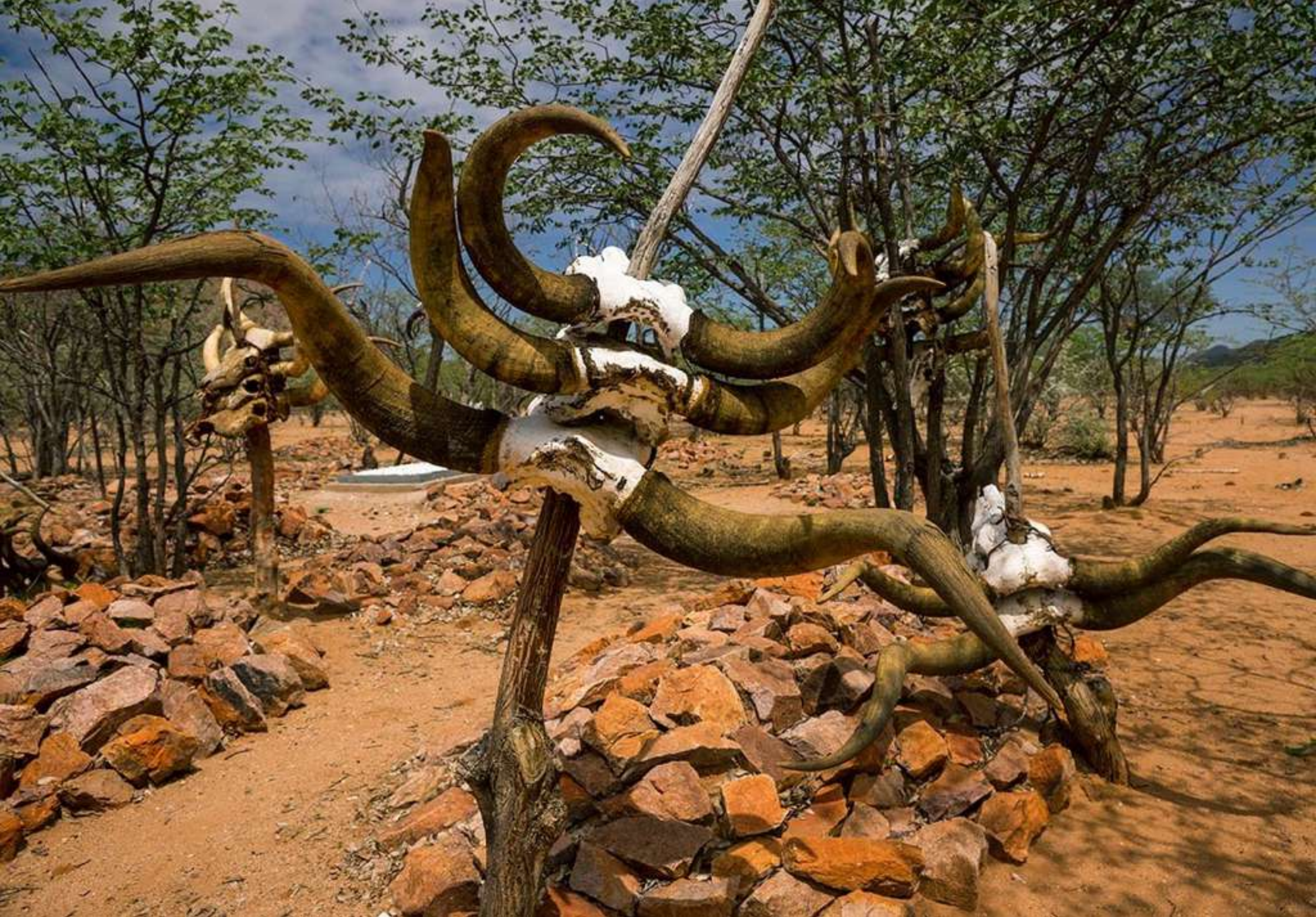
Himbas graves. The number of horns reflects the wealth and standing of the person being buried. The horns are turned upside down on the grave of a woman. Cows are killed on the day of the funerals but are not eaten. They give the meat to another clan.