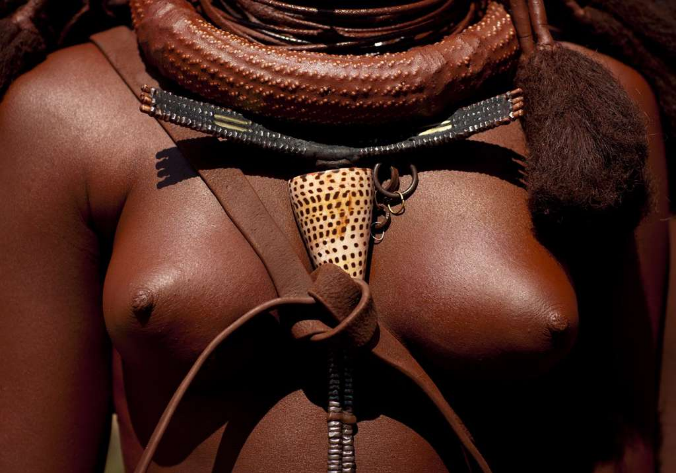
The large white shell worn on the breast by Himba is called the ohumba . The shell comes from the atlantic which is hundreds of kilometers away. In the family it goes from the mother to the daughters.