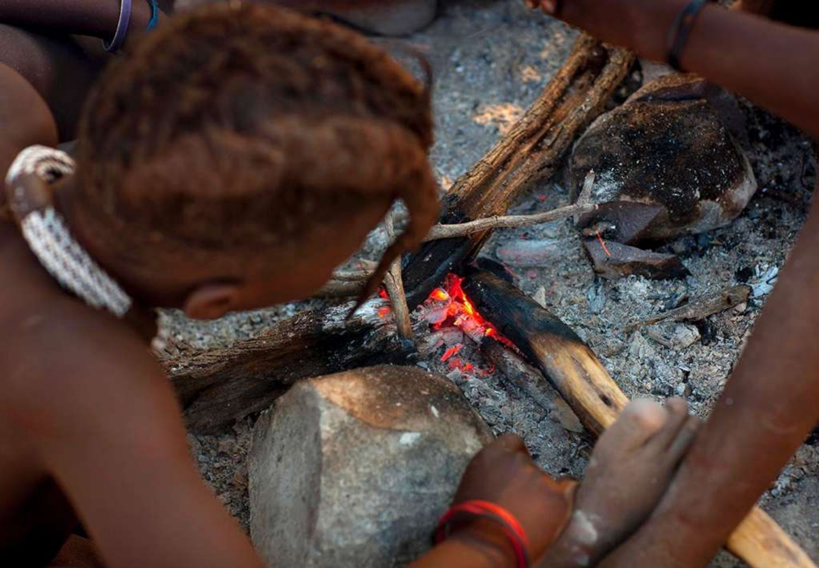
Each Himba village has a Holy Fire (the Okoruwo). It is always located between the entrance of the kraal and the door of the leader's house. The sacred fire represents the ancestors of the Himba's, and is kept burning 24 hours a day. It is a great taboo to cross this invisible line.