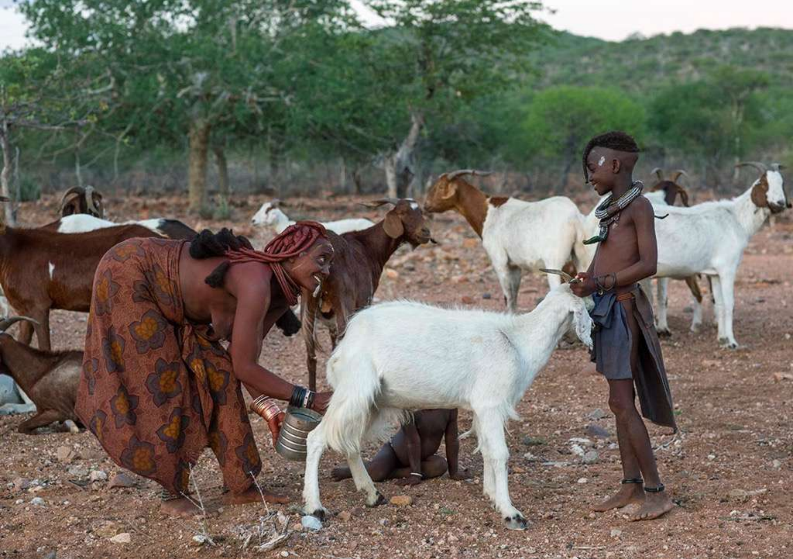
Every morning the women take the milk of the goats. According to a proverb « A Himba is nothing without his cattle ». They breed herds of cows and goats, and live almost exclusively from them, as their cattle provides meat and milk.