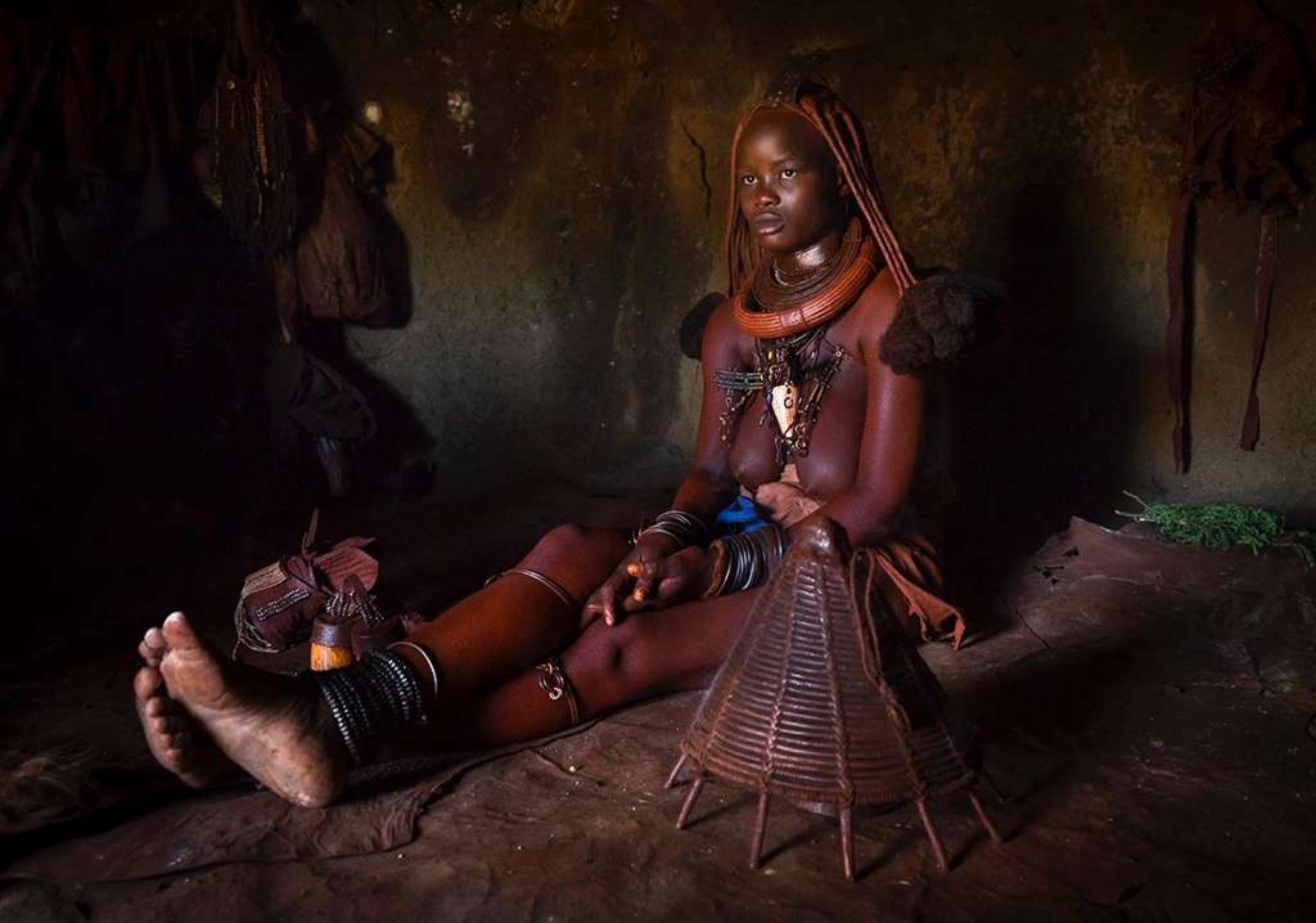
Himbas use smoke to purify themselves and also the clothes they put on this basket where burns inside some incense (Otjizumba that they find on Commiphora multijuga tree).