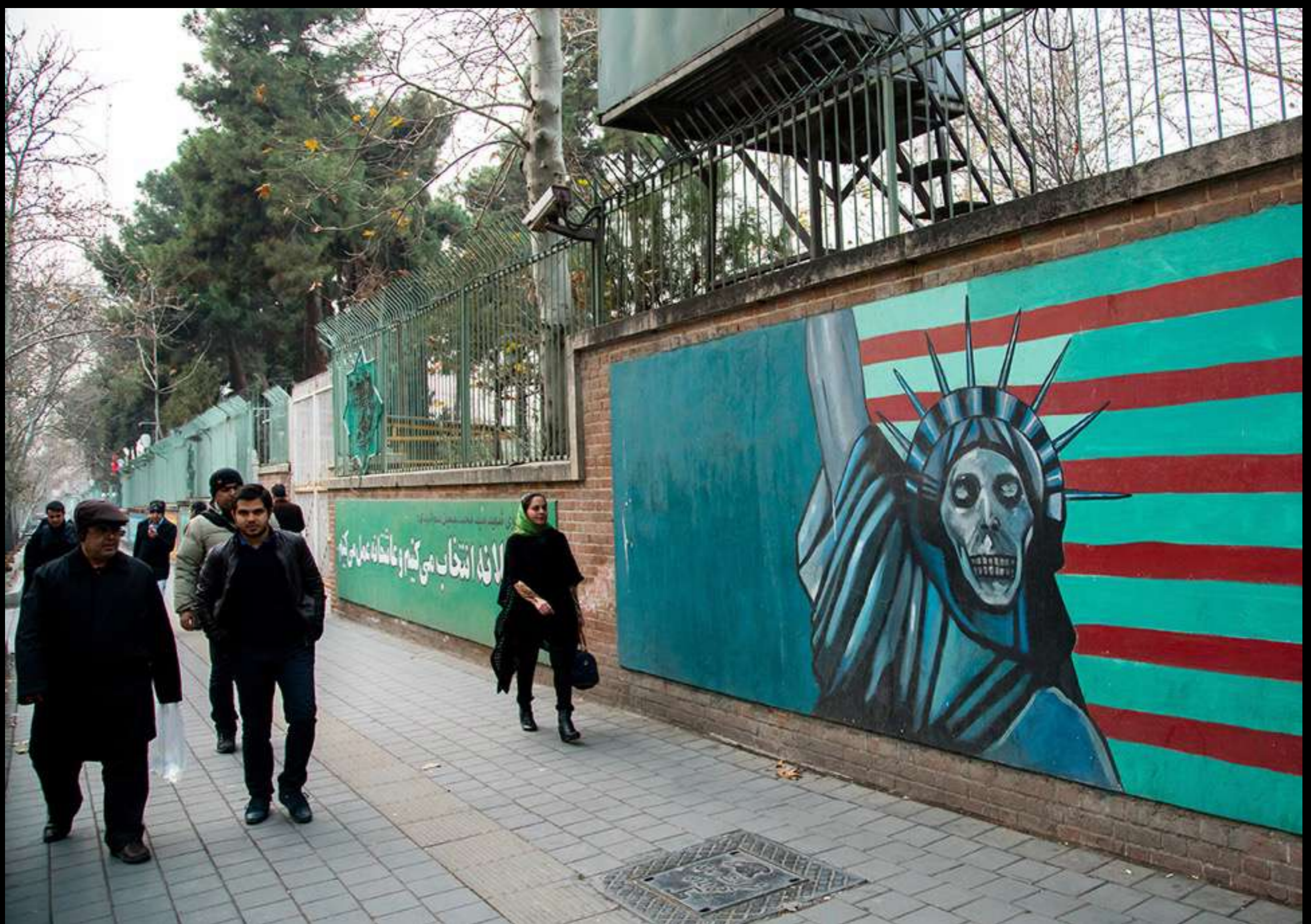
An Iranian version of the Statue of Liberty on the walls of the former American embassy in Tehran, which was captured in 1979 during the Revolution. The building is now home to a militia base and a sports club.