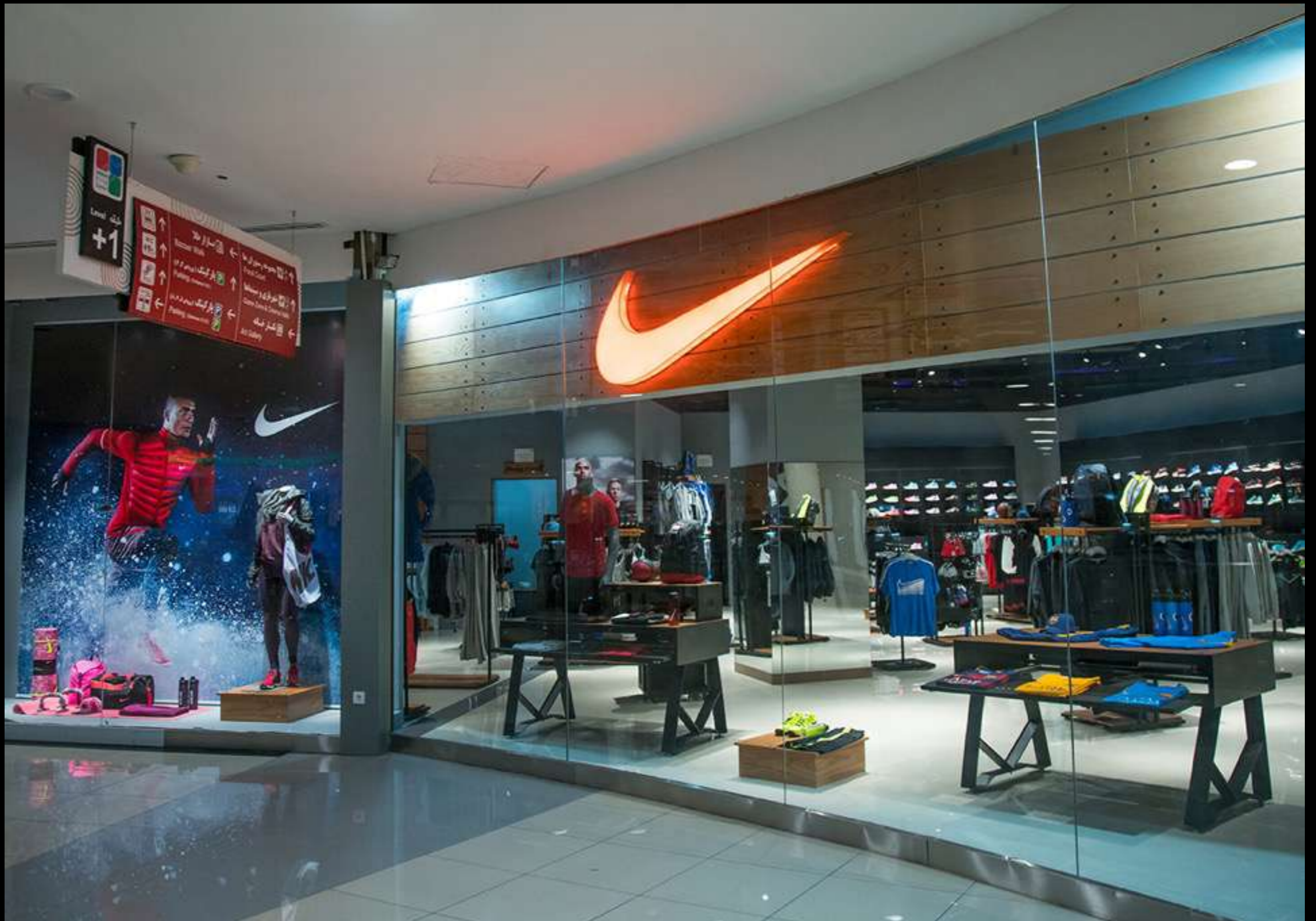
A Nike store inside a giant mall. During the week, very few people visit the mall, which is in the suburbs of Isfahan and was built by the Emirates.