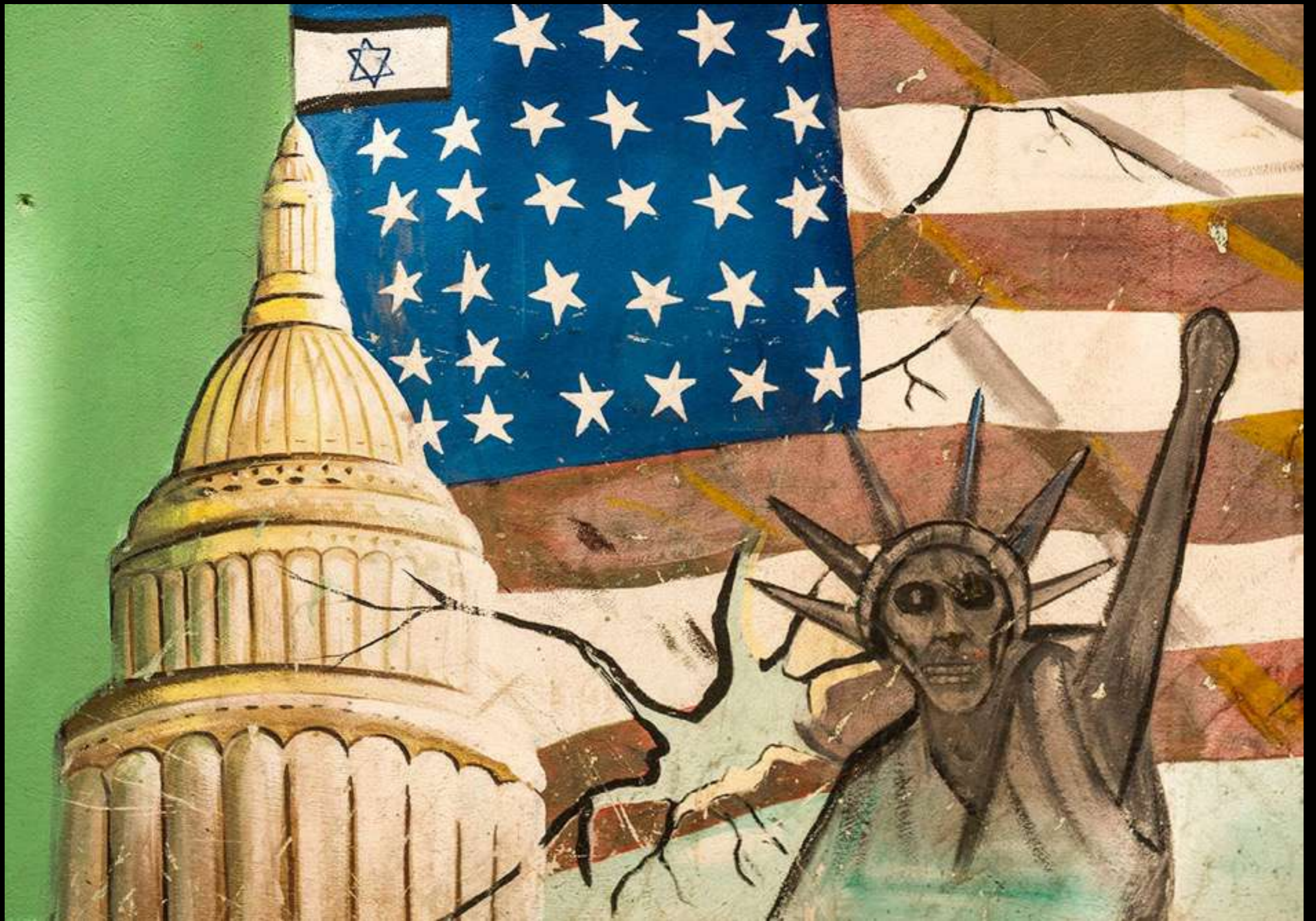
This combination of the Israeli and American flags together with symbols of the United States used to be on the walls of the former American embassy in Tehran. They were erased in 2015 when Iran resumed talks with the United States.