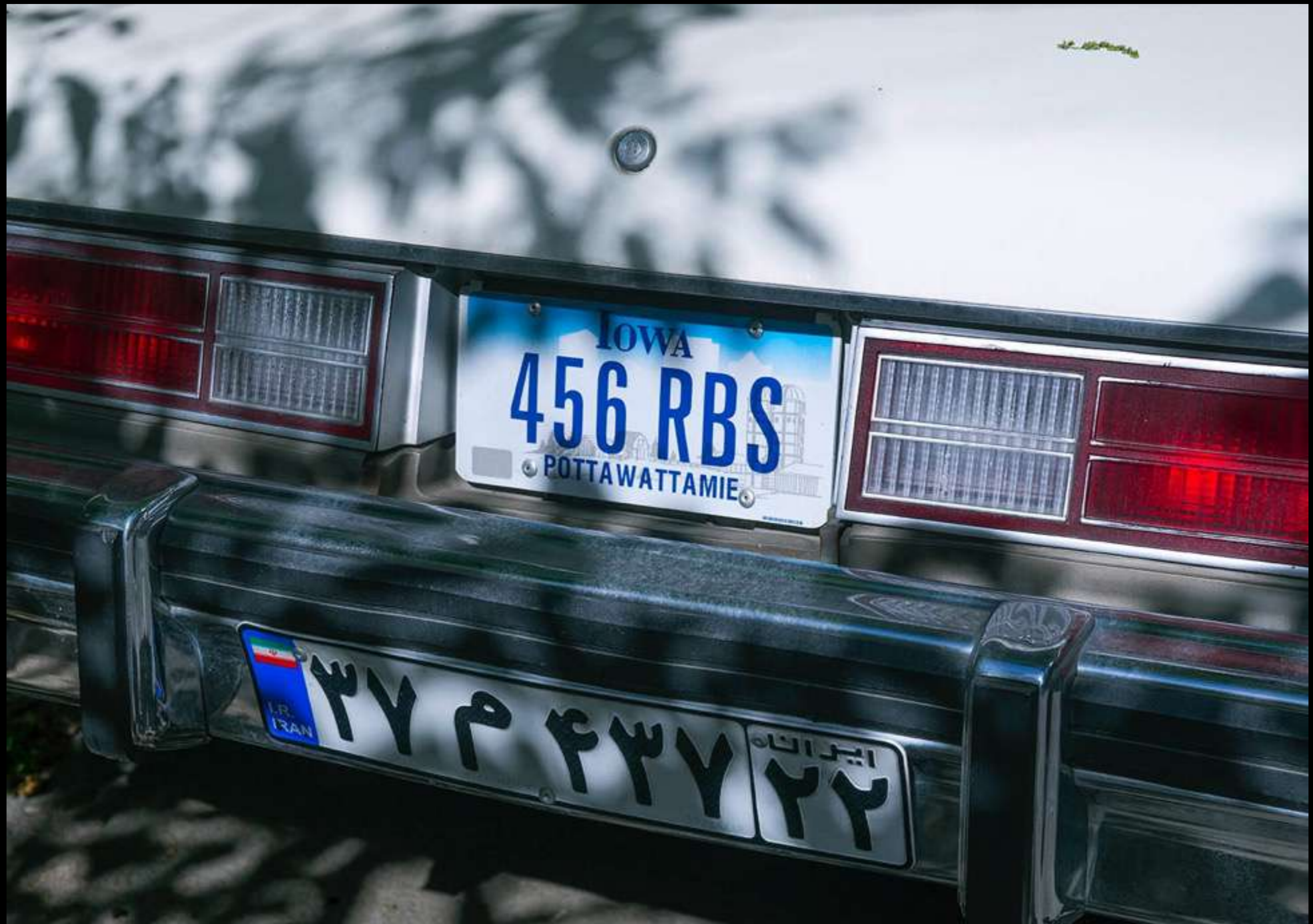
An old American car with a U.S. plate parked in the streets of Tehran. Like in Cuba, these old cars have been kept by their owners.