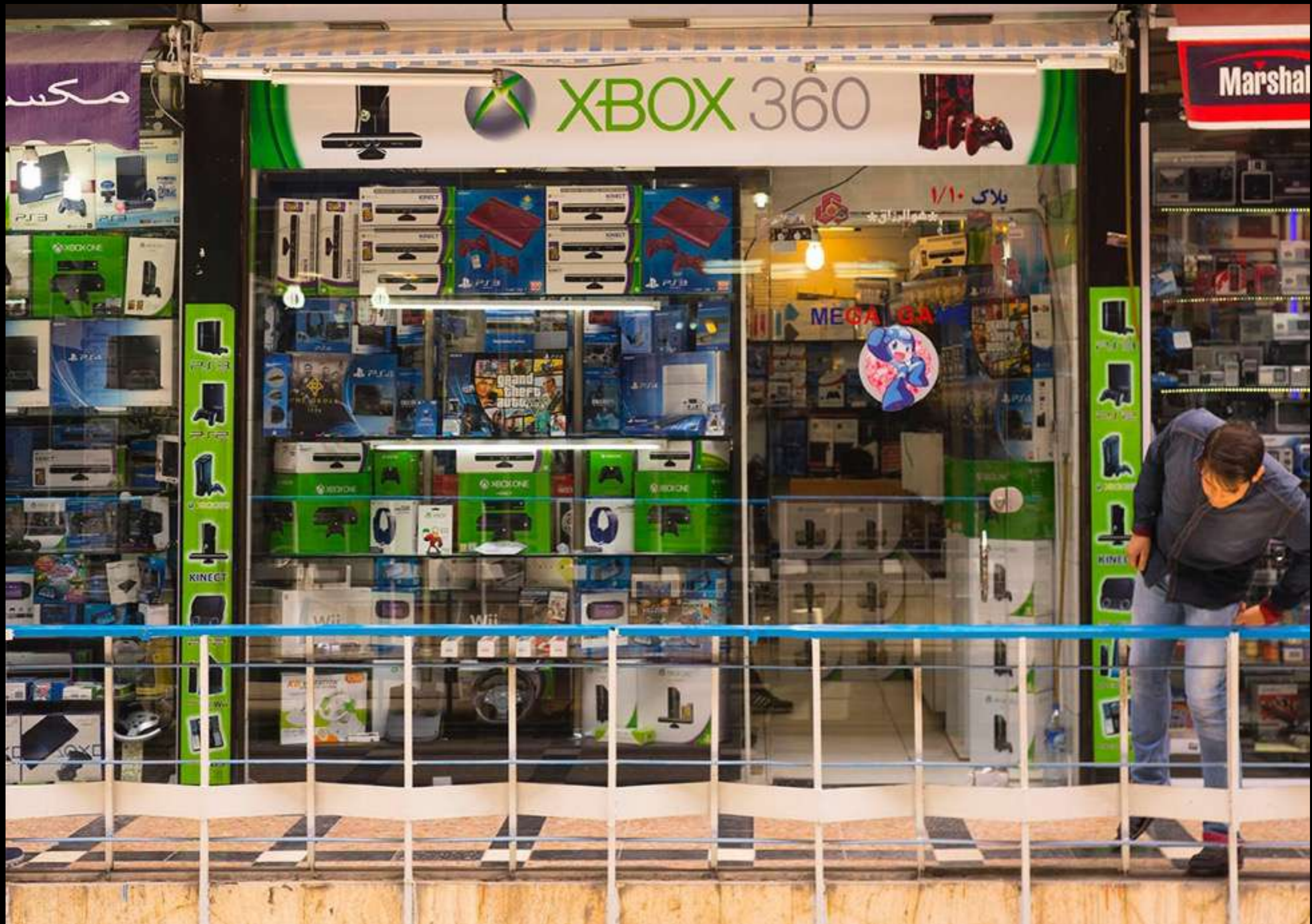
Microsoft's Xbox is for sale everywhere in the electronics quarter.