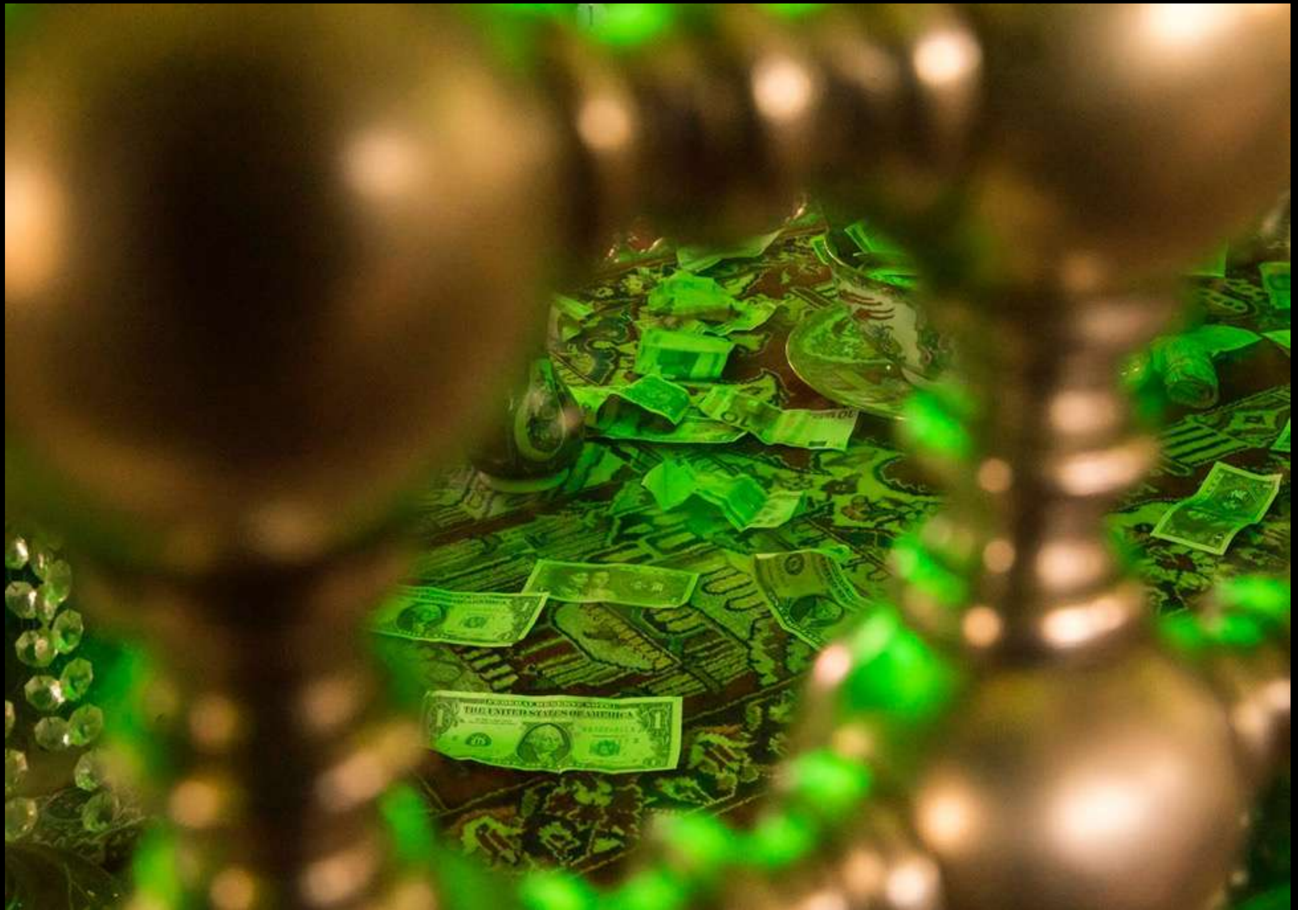
At the holy shrine of the Holy Sultan Amir Ahmad, all visitors leave bills. Many are dollars!