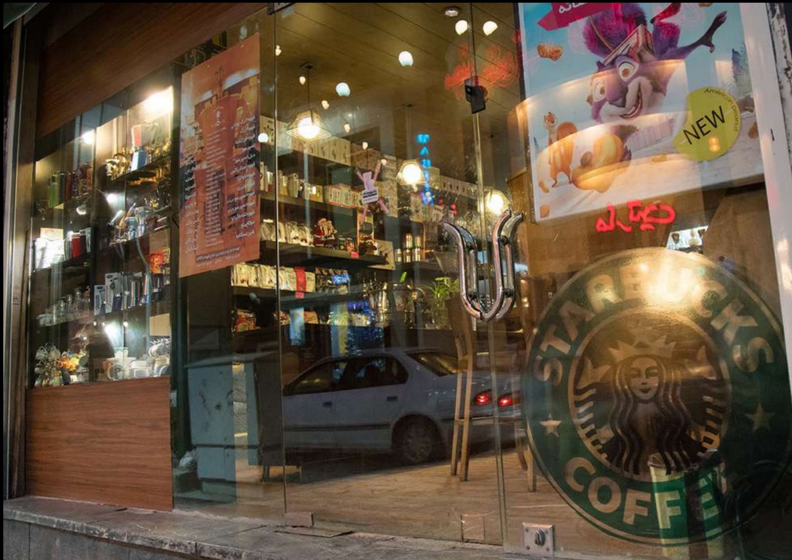
A fake Starbucks cafe in the Armenian neighborhood of Tehran.