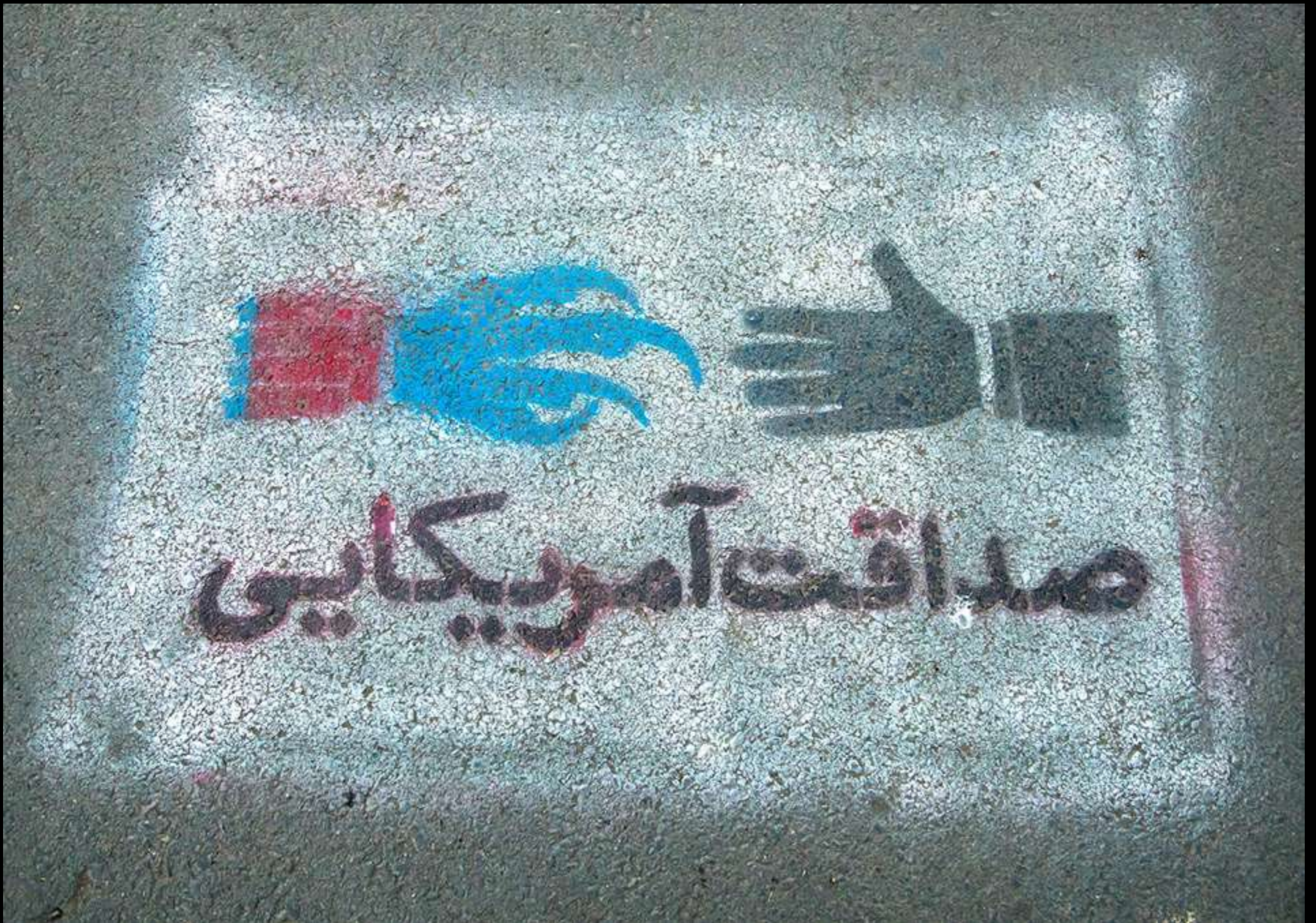
Behind the American embassy in Tehran, a graffiti on the pavement reads, "The honesty and friendship of America." It is of course ironic since the American hand looks like a devil's...