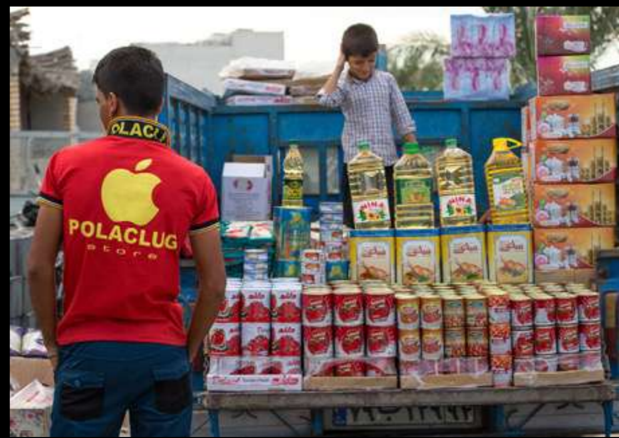
Apple's logo can be found everywhere: in the cars for luck, on t-shirts advertising local shops and even in hotels like on those beds in Qeshm.