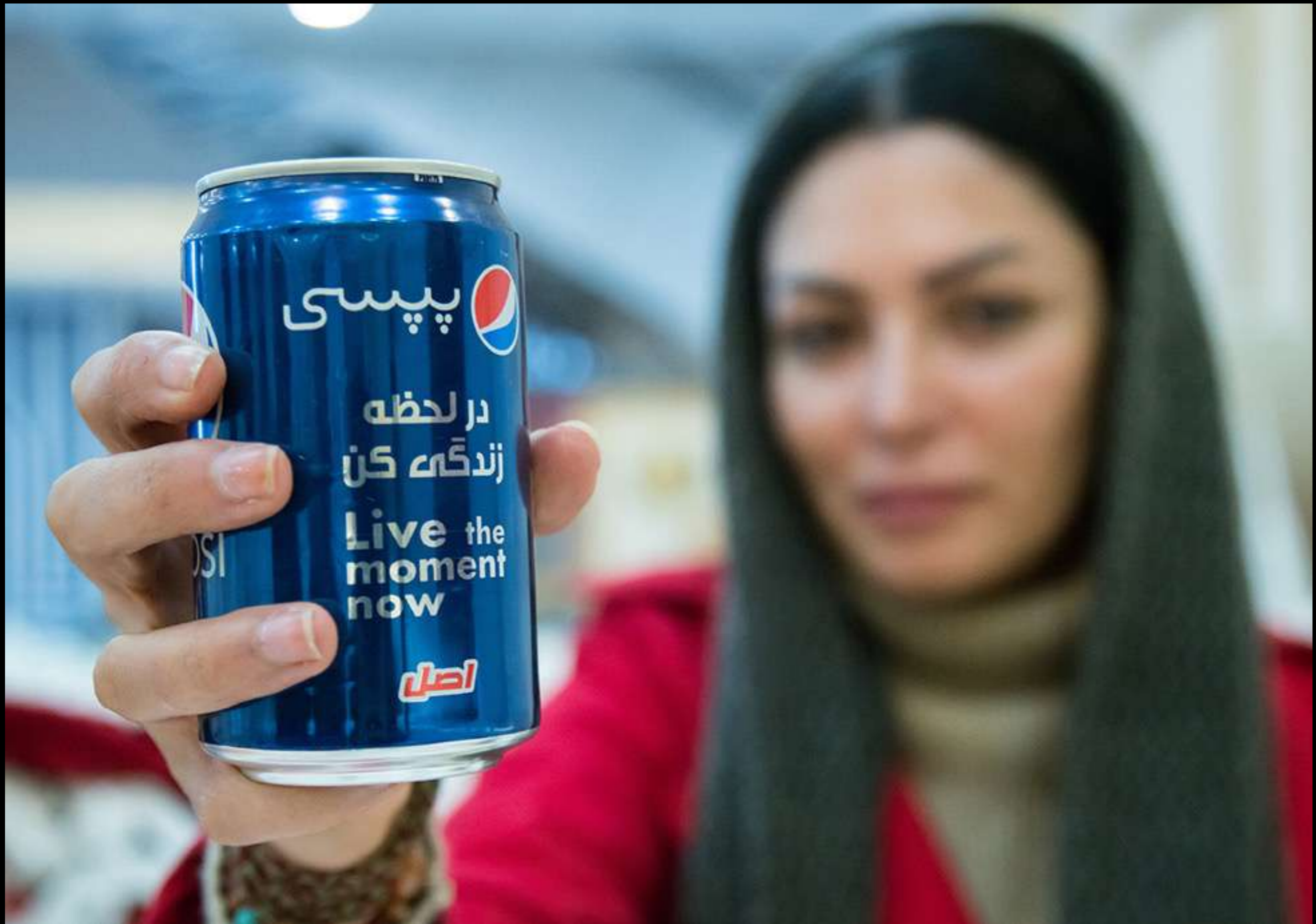
A Pepsi can with text in Farsi. Coca-Cola has a bottling factory in Mashad, one of the most religious towns in Iran.