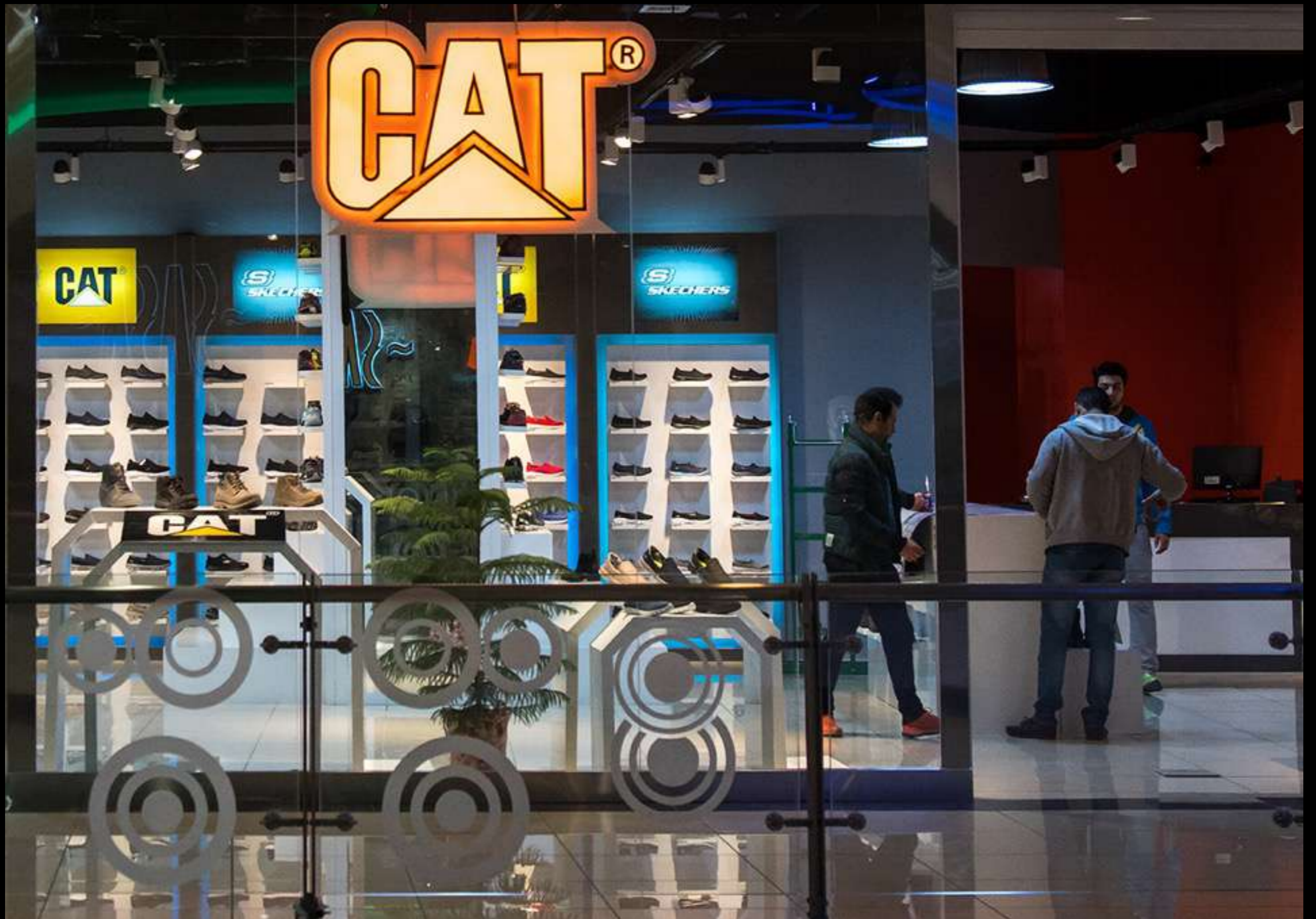
A CAT store in Isfahan. American brands are already in business in Iran. This is also a way to fight the counterfeit products made in China and sold in the bazaars.