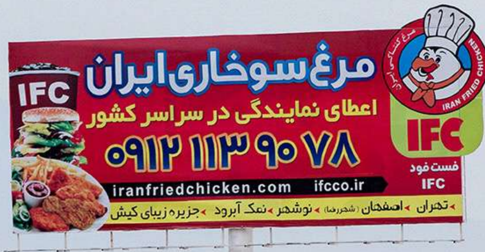
Near Kashan, a highway billboard for IFC, Iranian Fried Chicken...