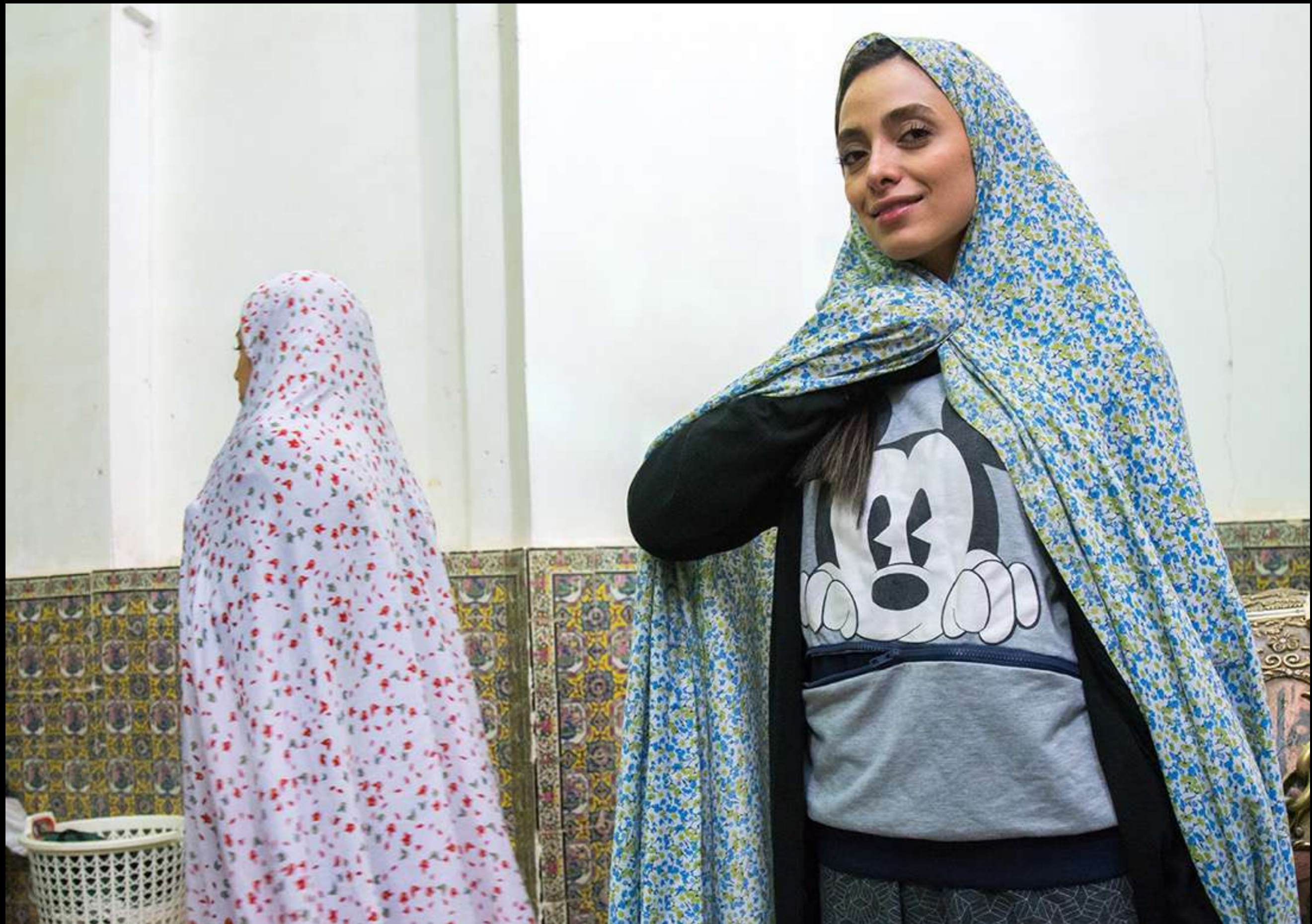
An Iranian young woman at a shrine in Kerman. She hides a Mickey Mouse t-shirt under a veil, which is mandatory for women visiting the religious area.