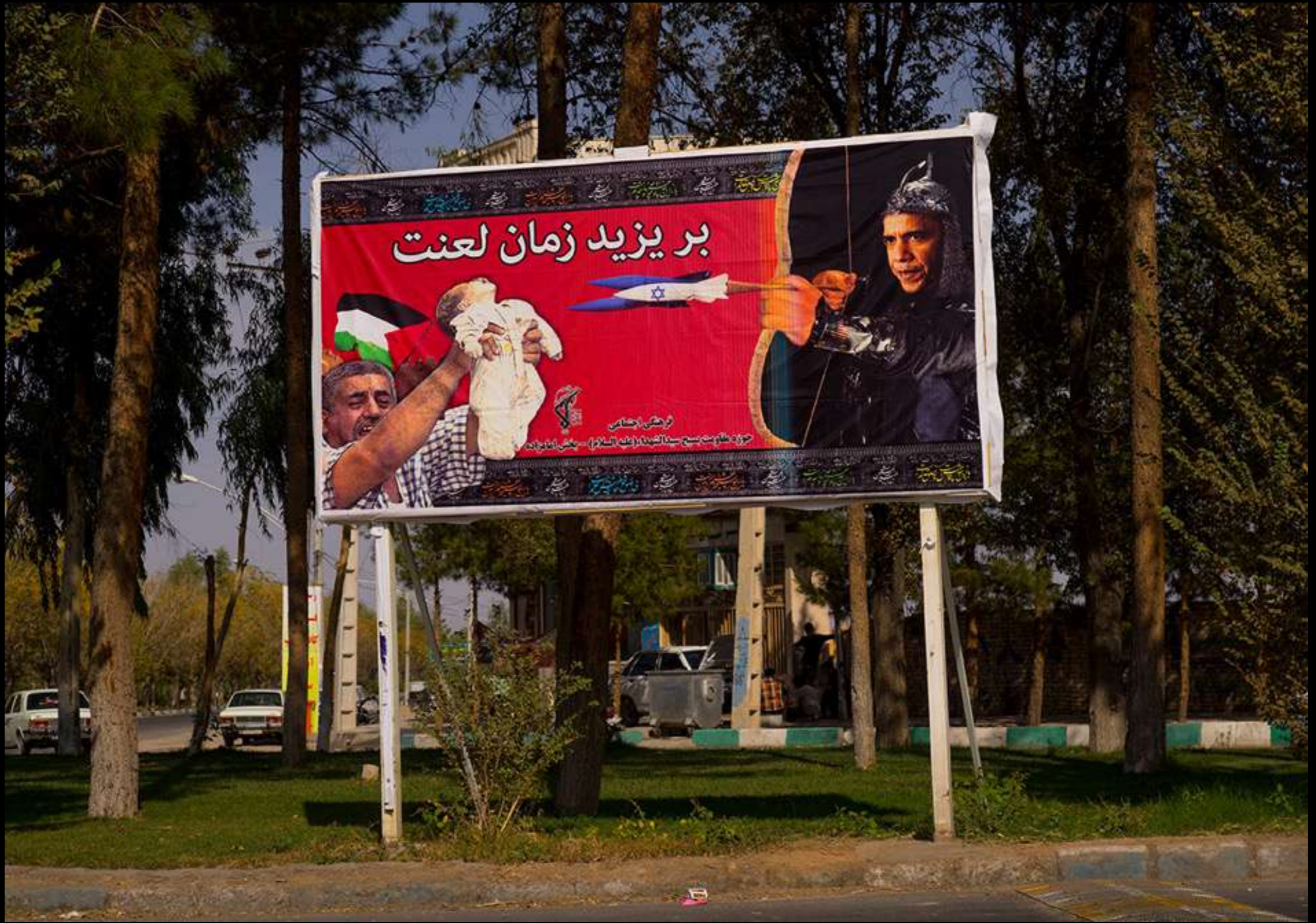
In the neighborhood of Yazd, this billboard blasts the USA for not respecting human rights. It depicts Obama as Yazid, who was responsible for the death of Shia Imam Hussein. A man is holding a Palestinian baby. The arrowhead aimed at them bears the Israeli Star of David. The Great Satan and the Little Satan (Israel) are shown as baby killers.