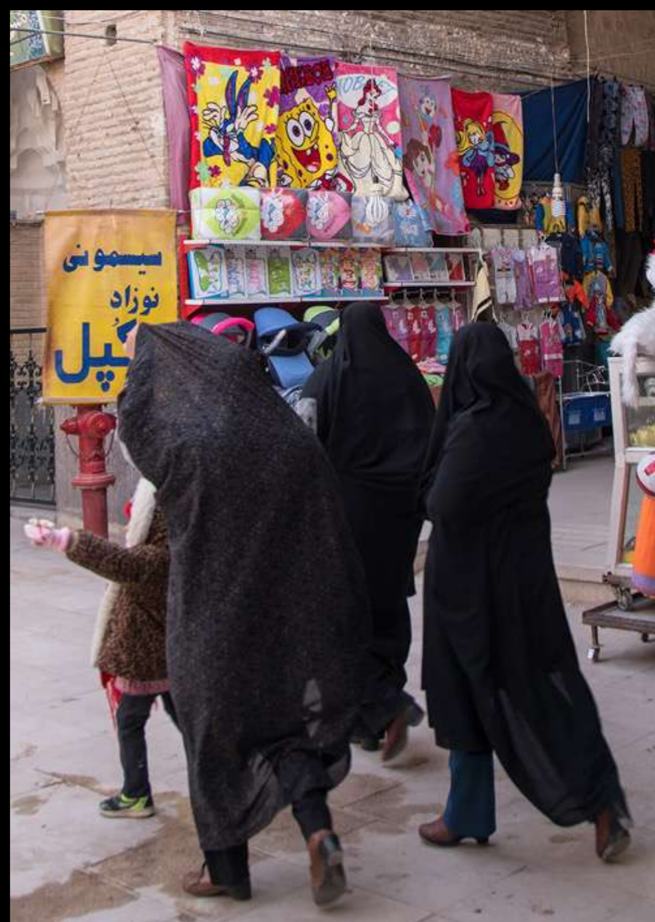
American cartoon characters like SpongeBob SquarePants or those from the Looney Tunes or Disney films are famous in Iran.