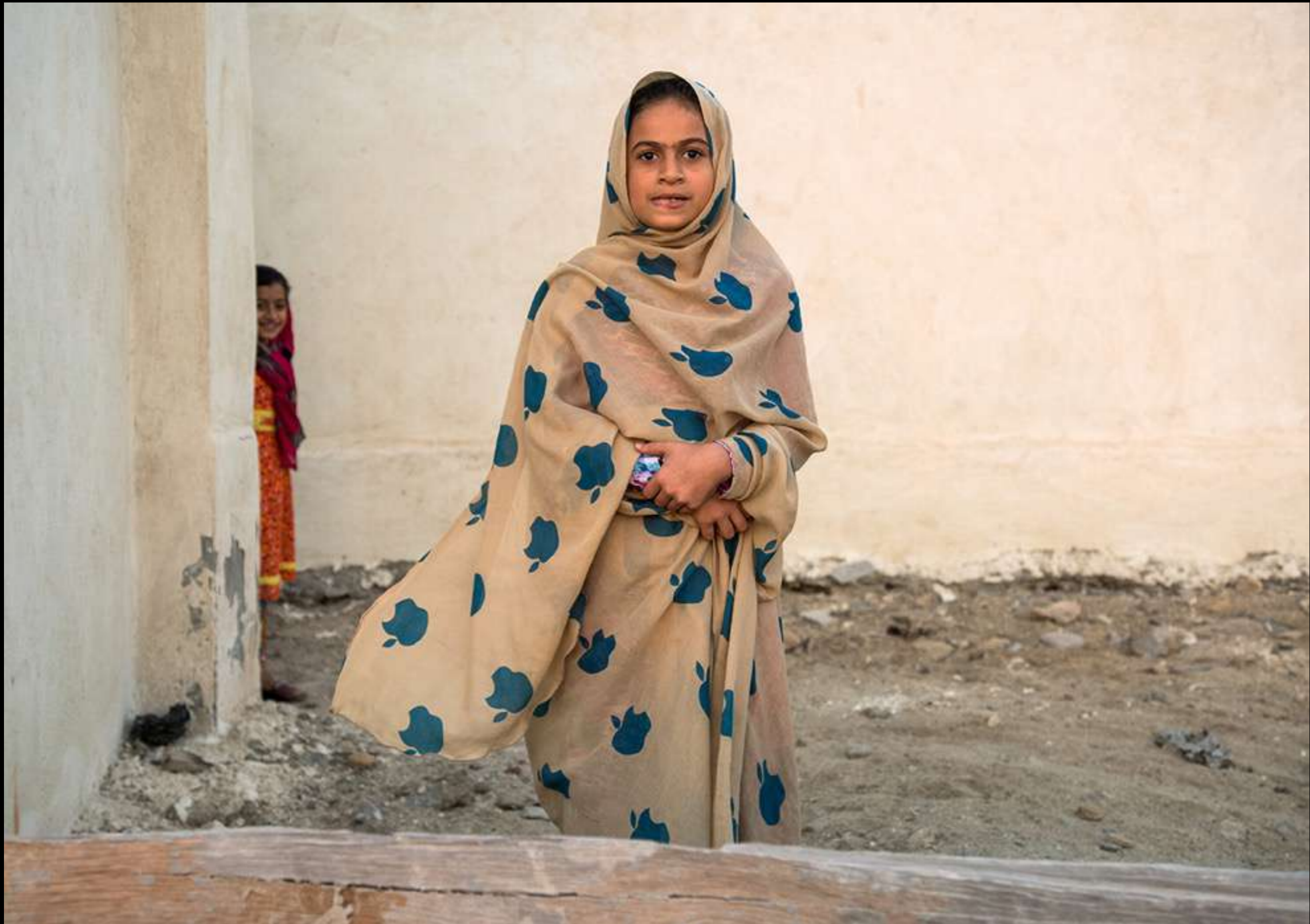
A young Iranian girl in Laft village wearing a Muslim veil adorned with the Apple logo...