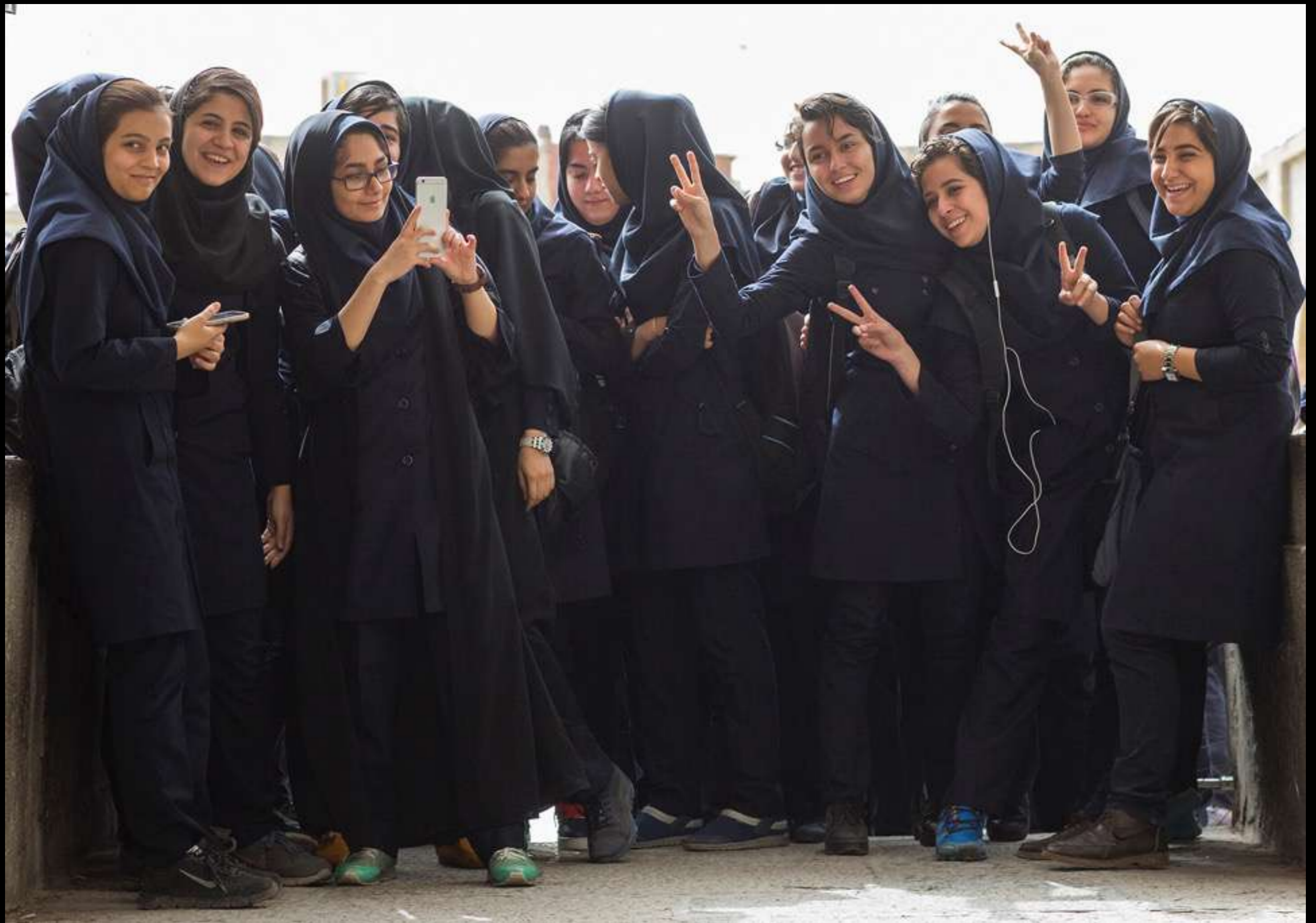
Iranian student taking pictures with her iPhone in Isfahan. The phones cost a fortune for the average Iranian – more than one month's salary. Many mobile phones actually come from Dubai.