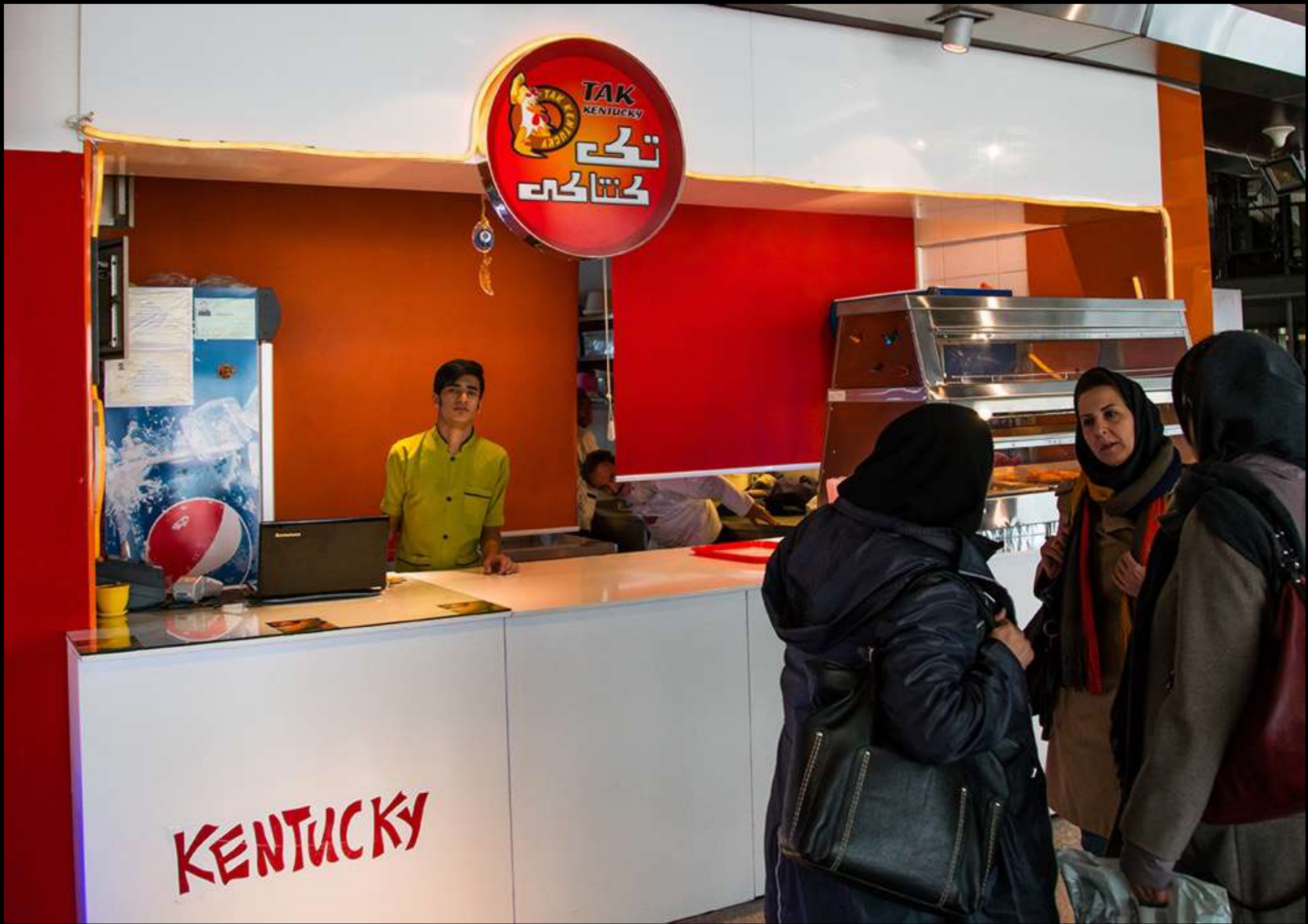
Another KFC cousin in the giant Milad tower in Tehran.