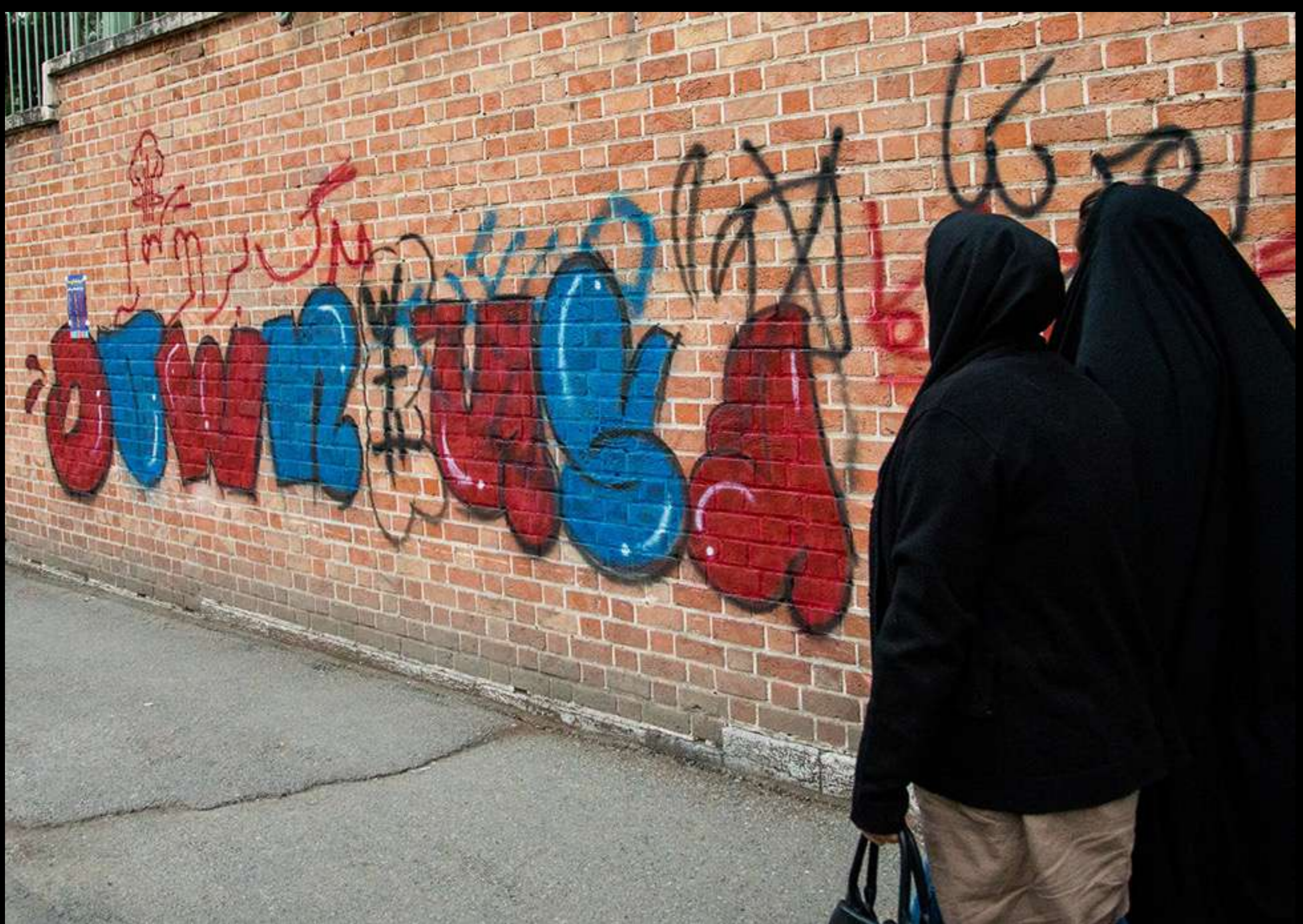
On the wall opposite the former American embassy, new graffitis have appeared. This one "Down with USA" was done in a very hip-hop style.