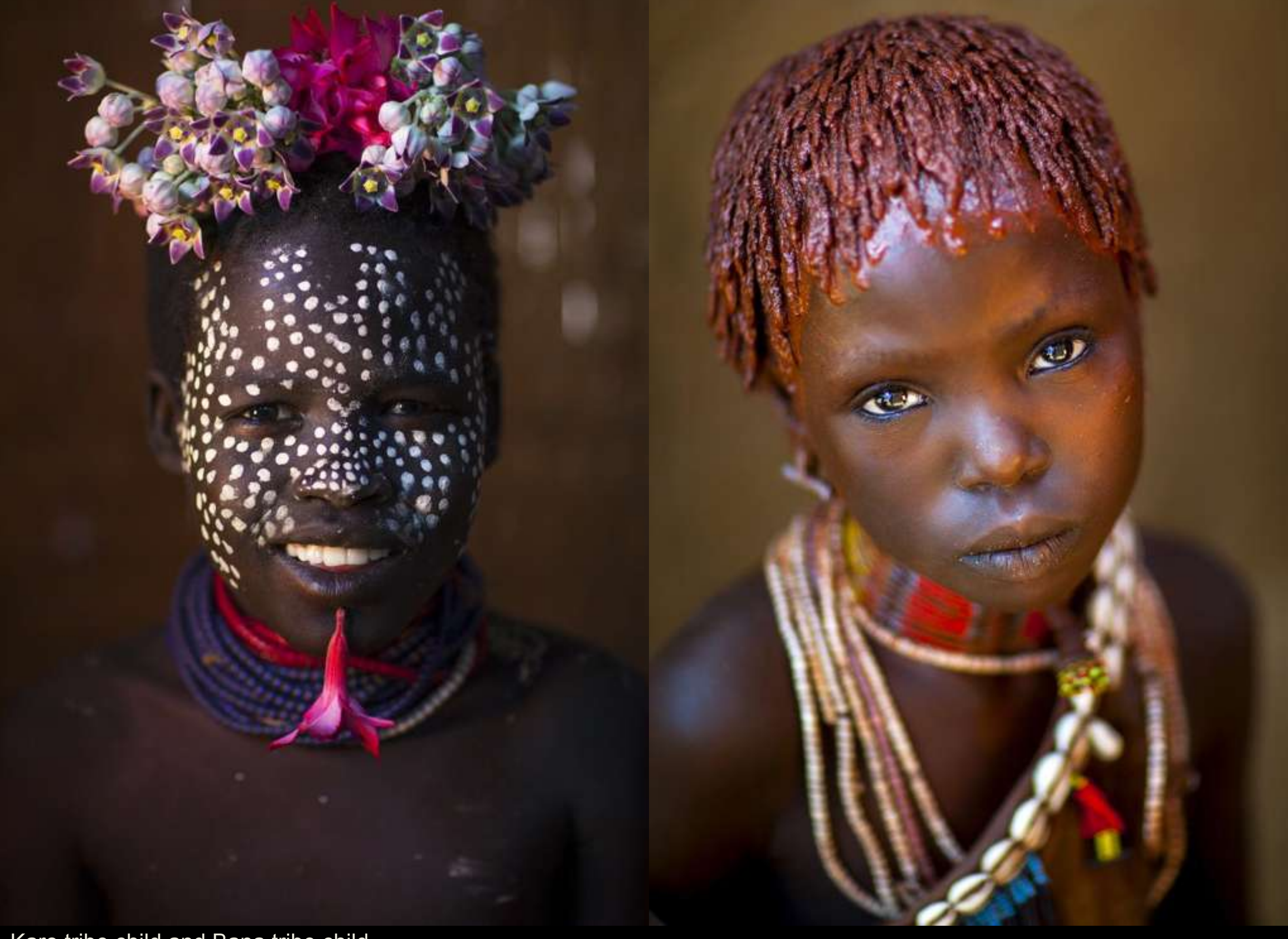
Karo tribe child and Bana tribe child