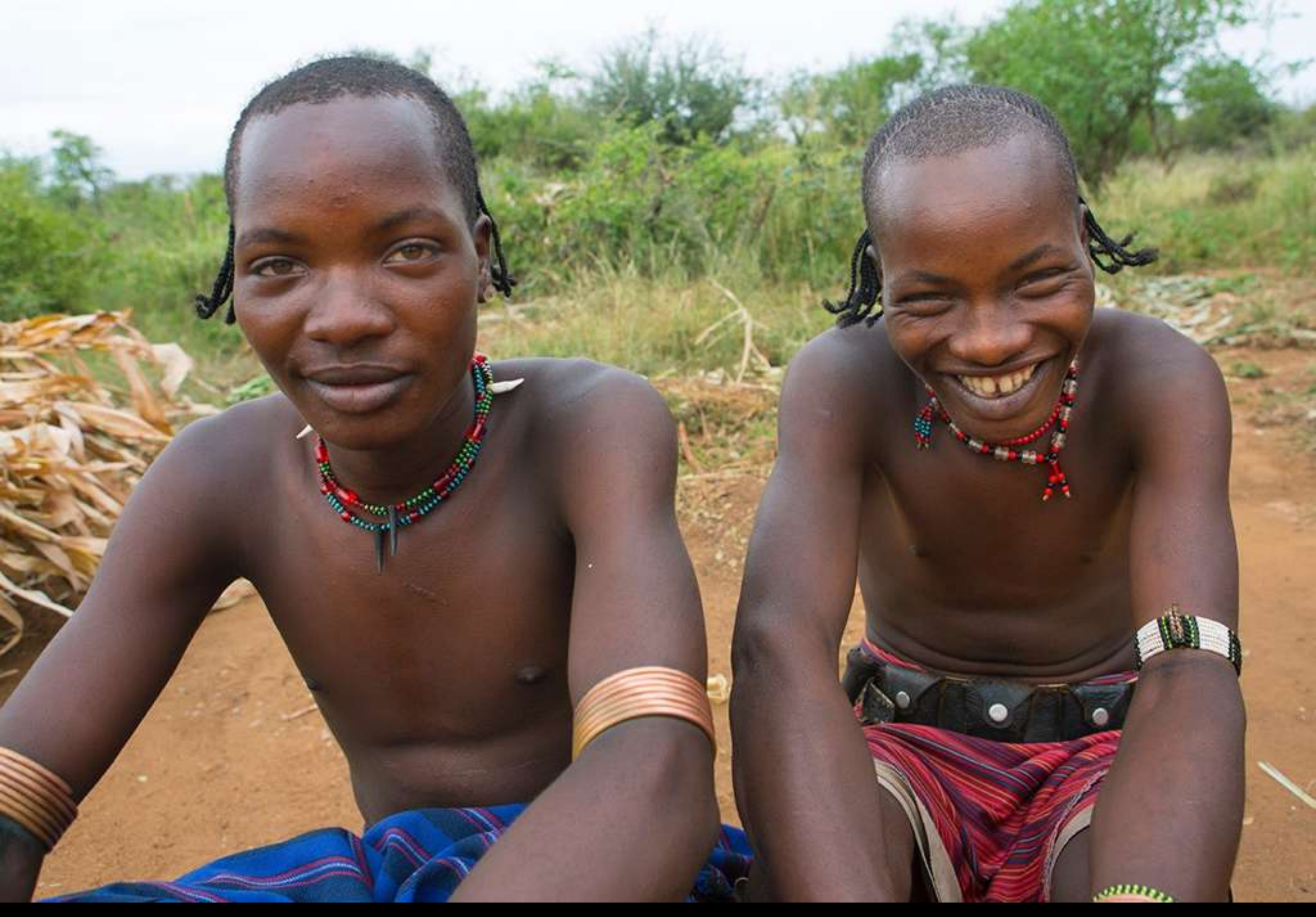
Twins from the Hamer tribe. The birth of twins is perceived as a curse and both babies may be declared Mingi. Those pictured were lucky enough to stay alive...