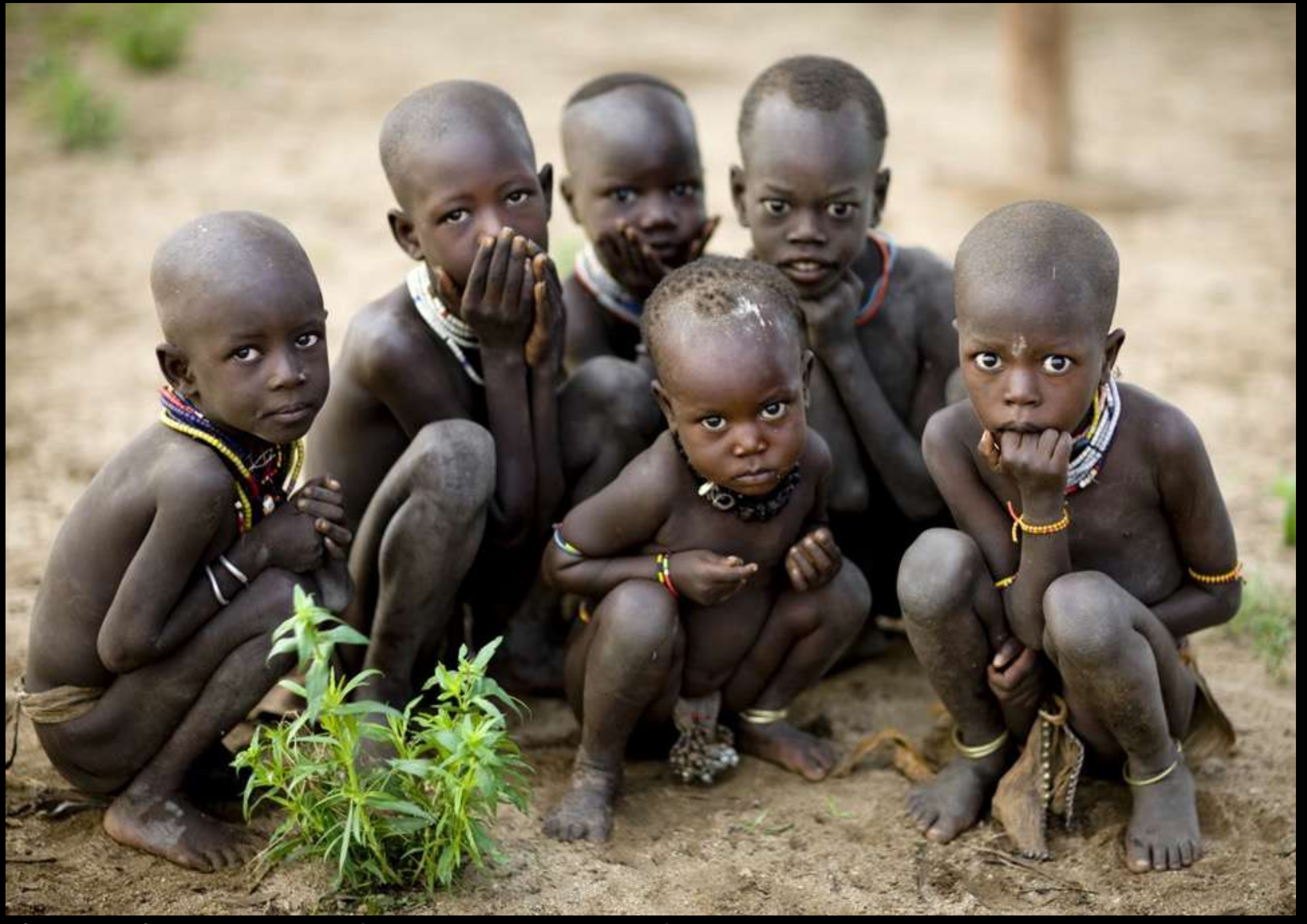
If parents of Mingi children don't cooperate with the elders' decisions, they themselves will be cursed and banished from the village.