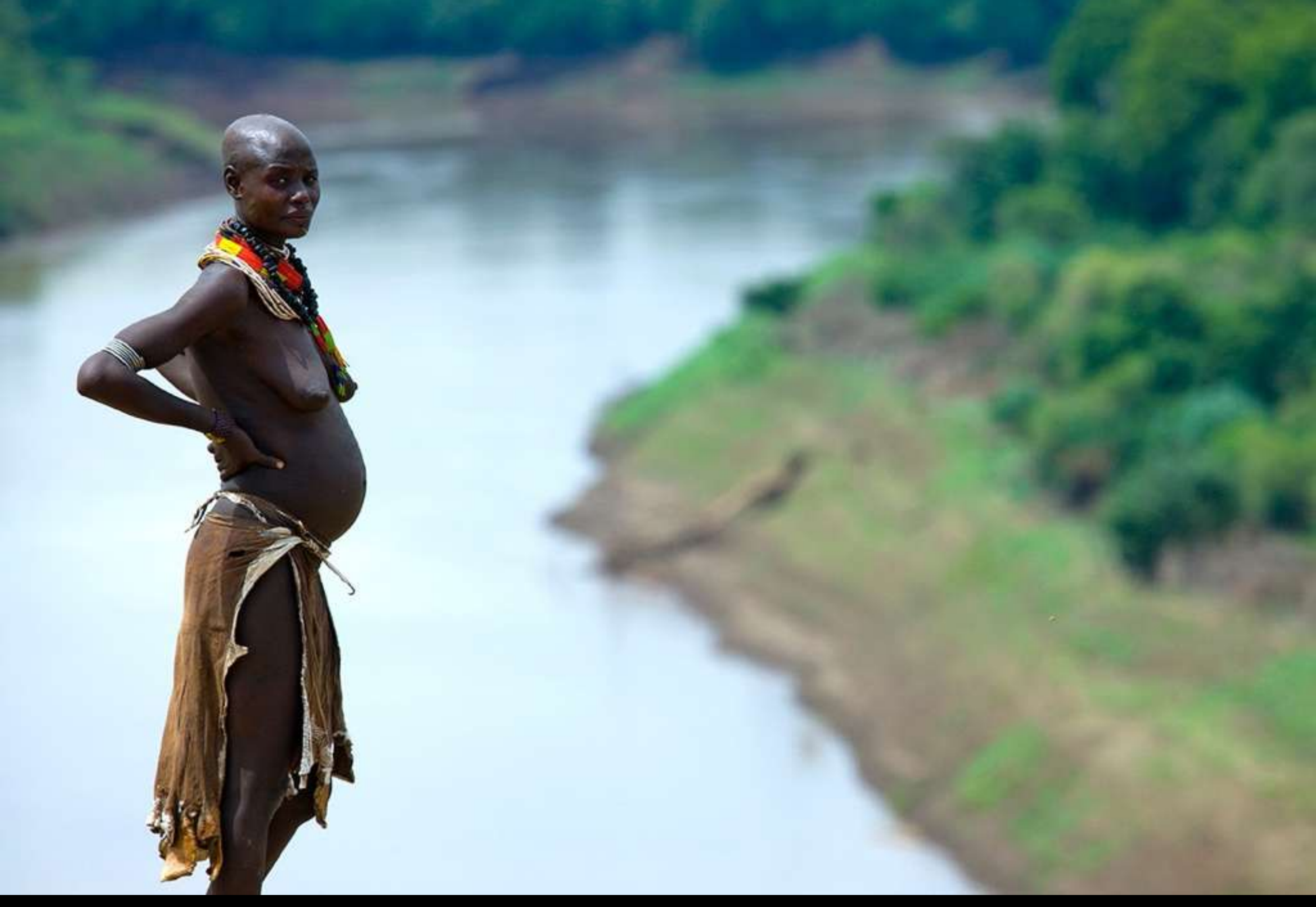
Karo woman in Korcho village.

Some women who know they are pregnant with a Mingi child agree to give their baby to the Omo Child organization instead of facing the dire alternative. Even them, some are pressured by the elders to change their minds and let the baby be killed.