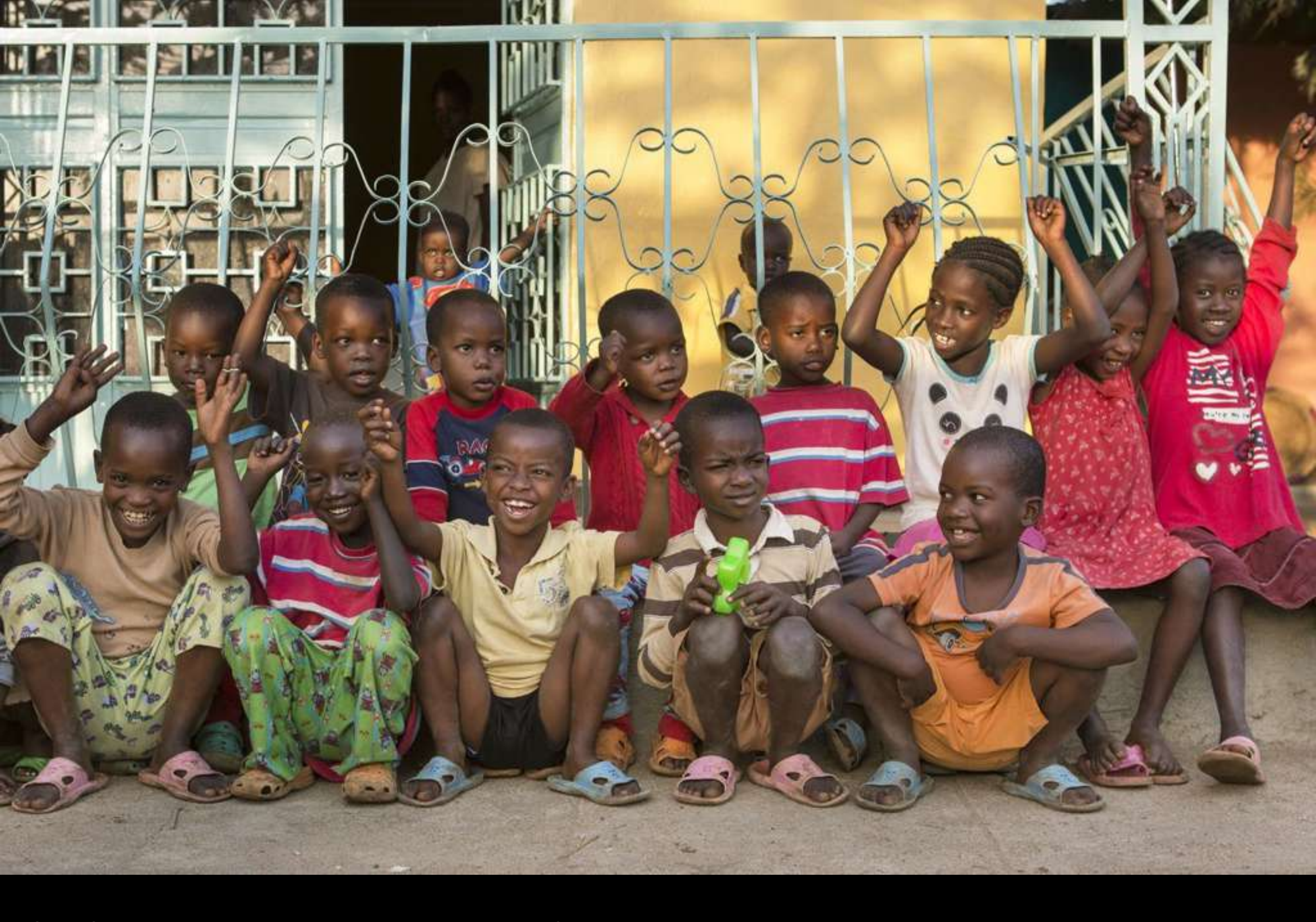
Omo Child currently has 37 rescued Mingi children from the Karo and Hamer tribes. They live together in Jinka, Ethiopia.