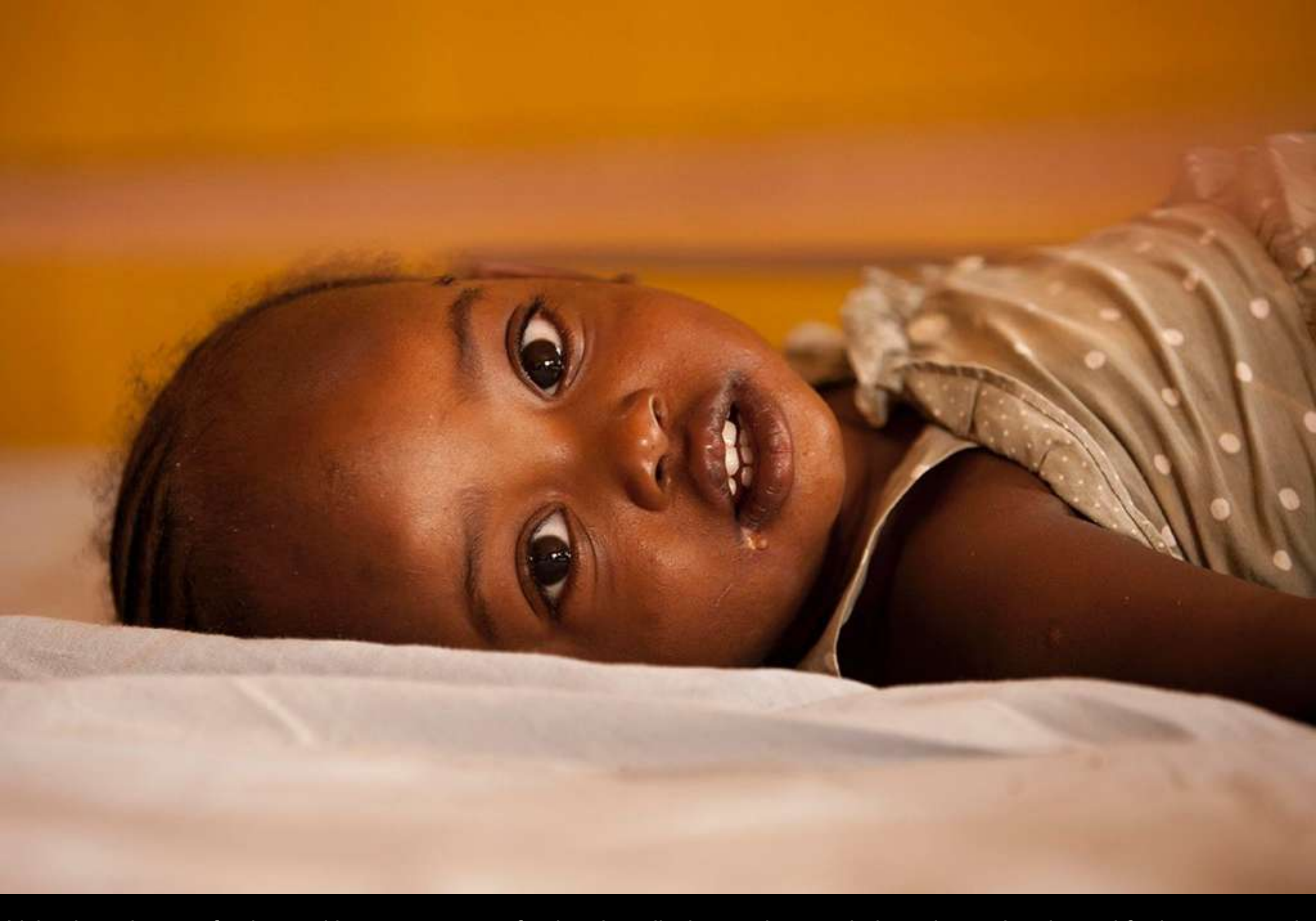
Living in a clean, safe place, with easy access to food and medical care, they are being educated and cared for by a top-notch team of nannies. They live a better life than the kids from the remote villages they left behind.