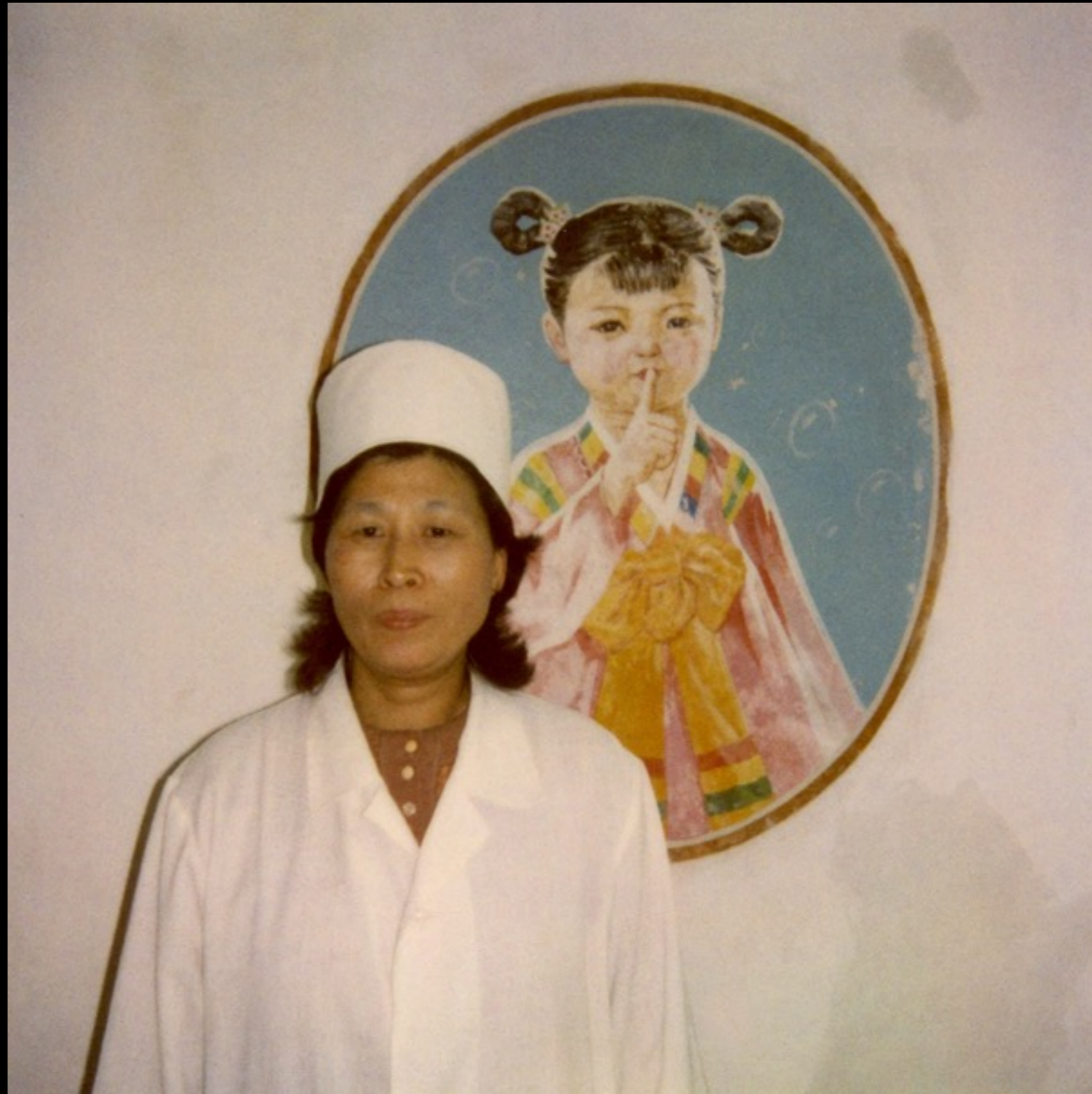
Photo taken during a visit in a kindergarten of Hamhung, a lady in the kids' sleeping room. The nurse was dumb and could not speak.