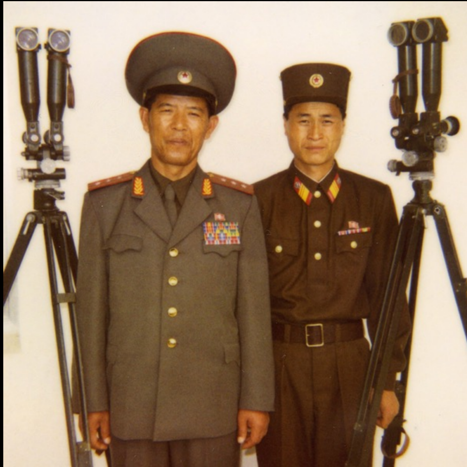
A North Korean colonel with a soldier on the DMZ, from where you see South Korea through binoculars. At first, he refused to pause, but when he saw the Polaroid of one soldier, he ordered me to take one of him too..