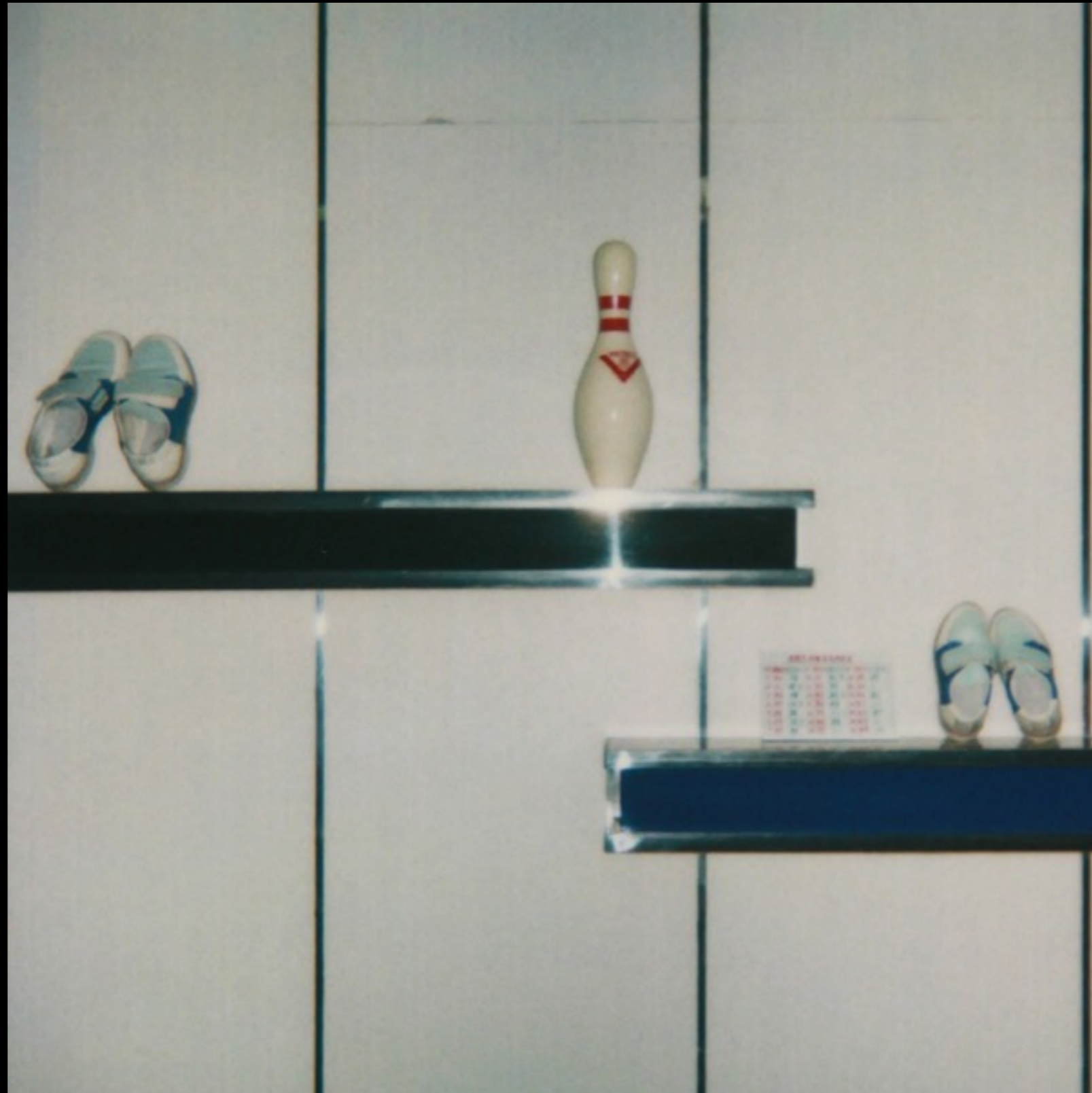
Decoration in the bowling in Pyongyang. A good place to see North Koreans having fun and dating. Tinder is not yet in North Korea.