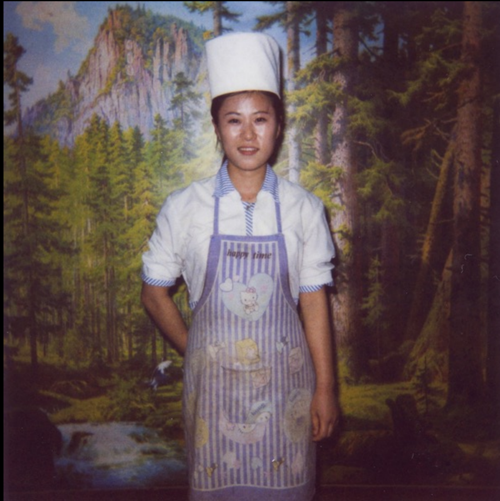
A cook in a restaurant in Pyongyang with a Hello Kitty apron. She did not know about this character, she thought it was from North Korea.