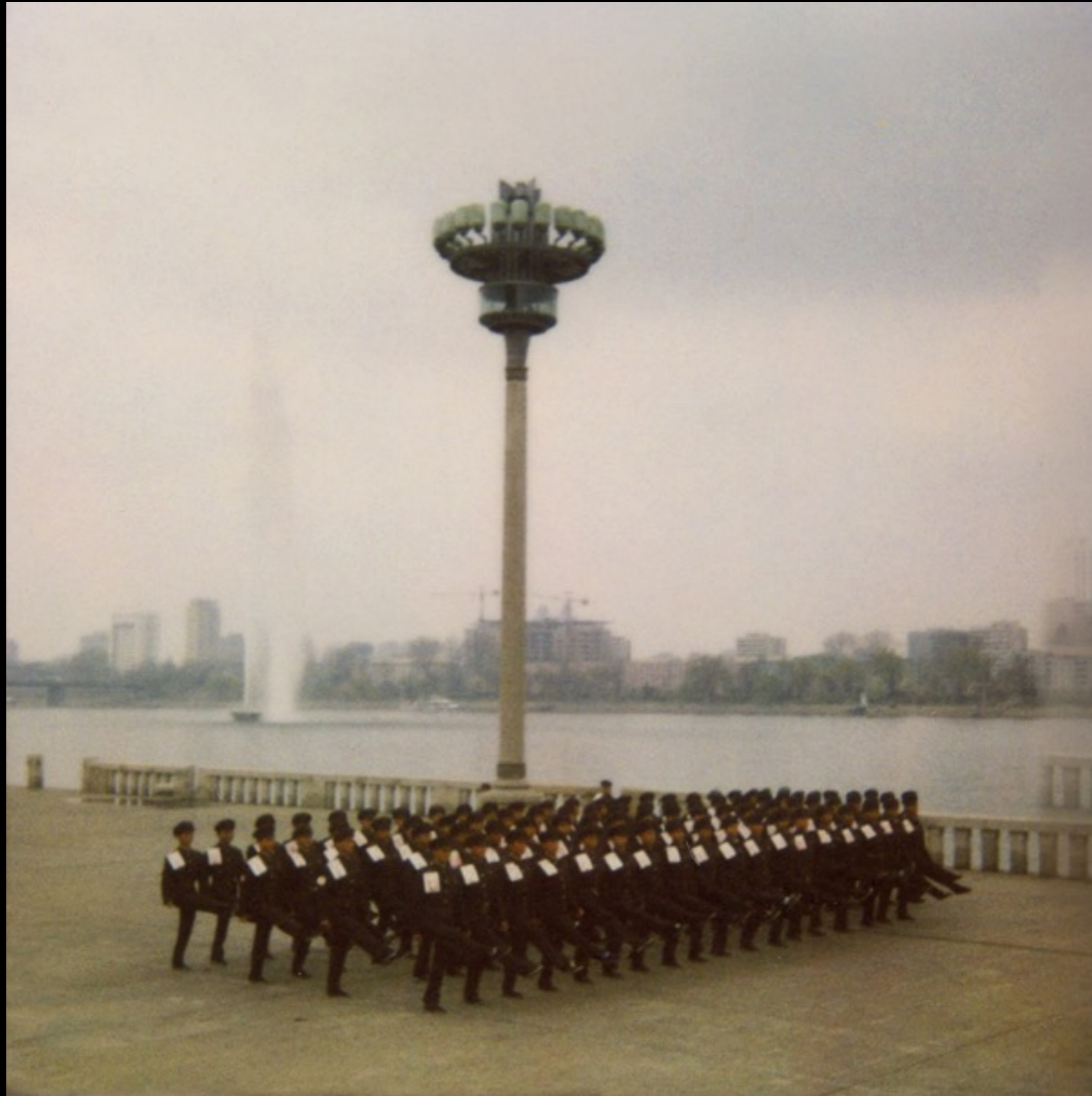
North Korean army parade in Pyongyang. It was a rehearsal. Each man had a number on his uniform, with the officer shouting orders to the ones not in good tempo..