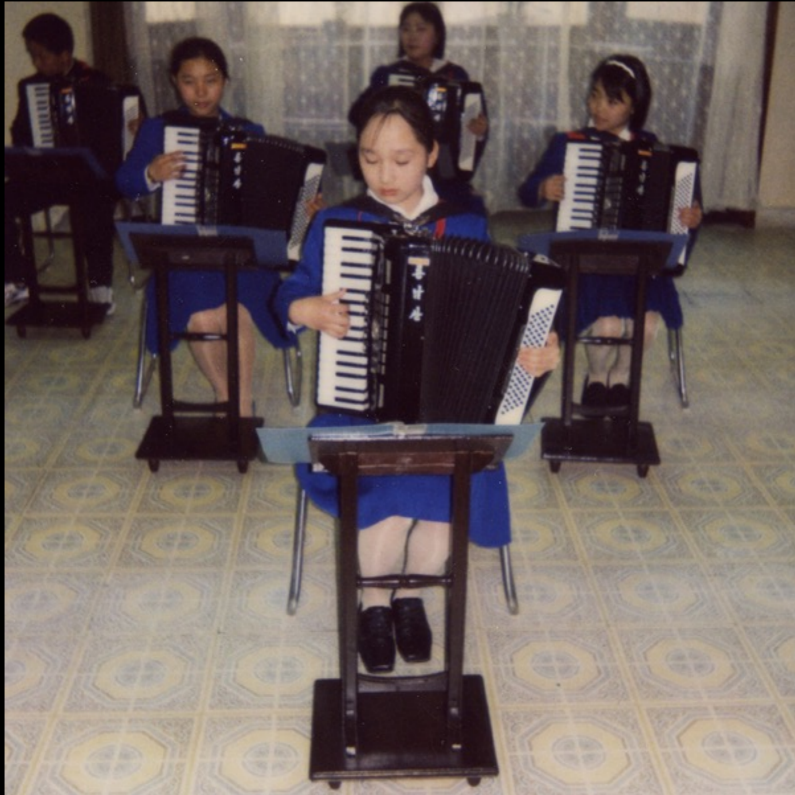
Accordion Classroom at Mangyongdae Schoolchildren's Palace in Pyongyang. The visit that every tourist makes. After the guide opened the door, inside you can see accordion, dance, singing and calligraphy...For only 30 seconds! Then the guide kept on rushing us, "We are late, we are late..."