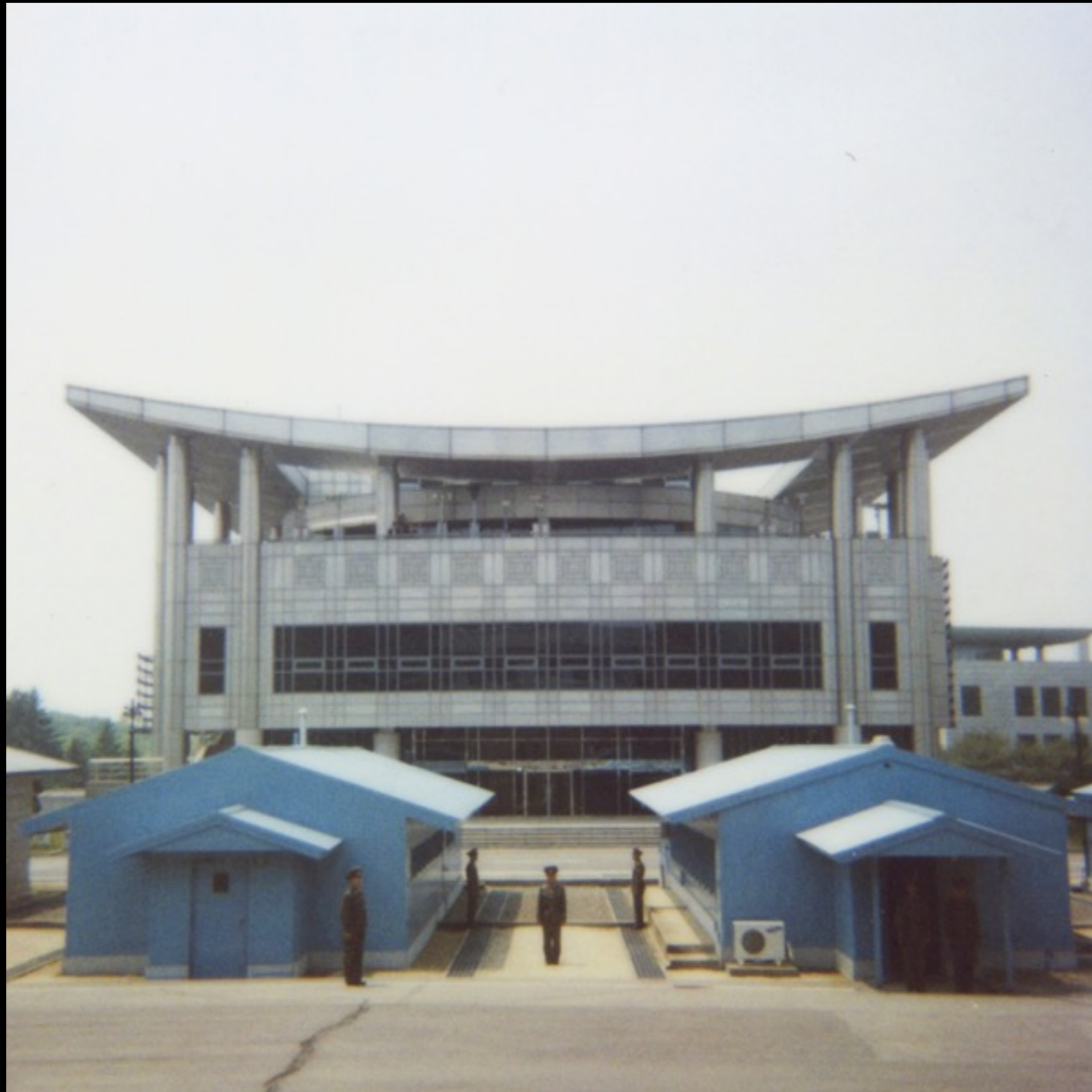
The DMZ from the North Korean side. As there were neither South Korean soldiers nor American soldiers on the other side, the guide explained that they were afraid to be seen. "Cowards", he said.