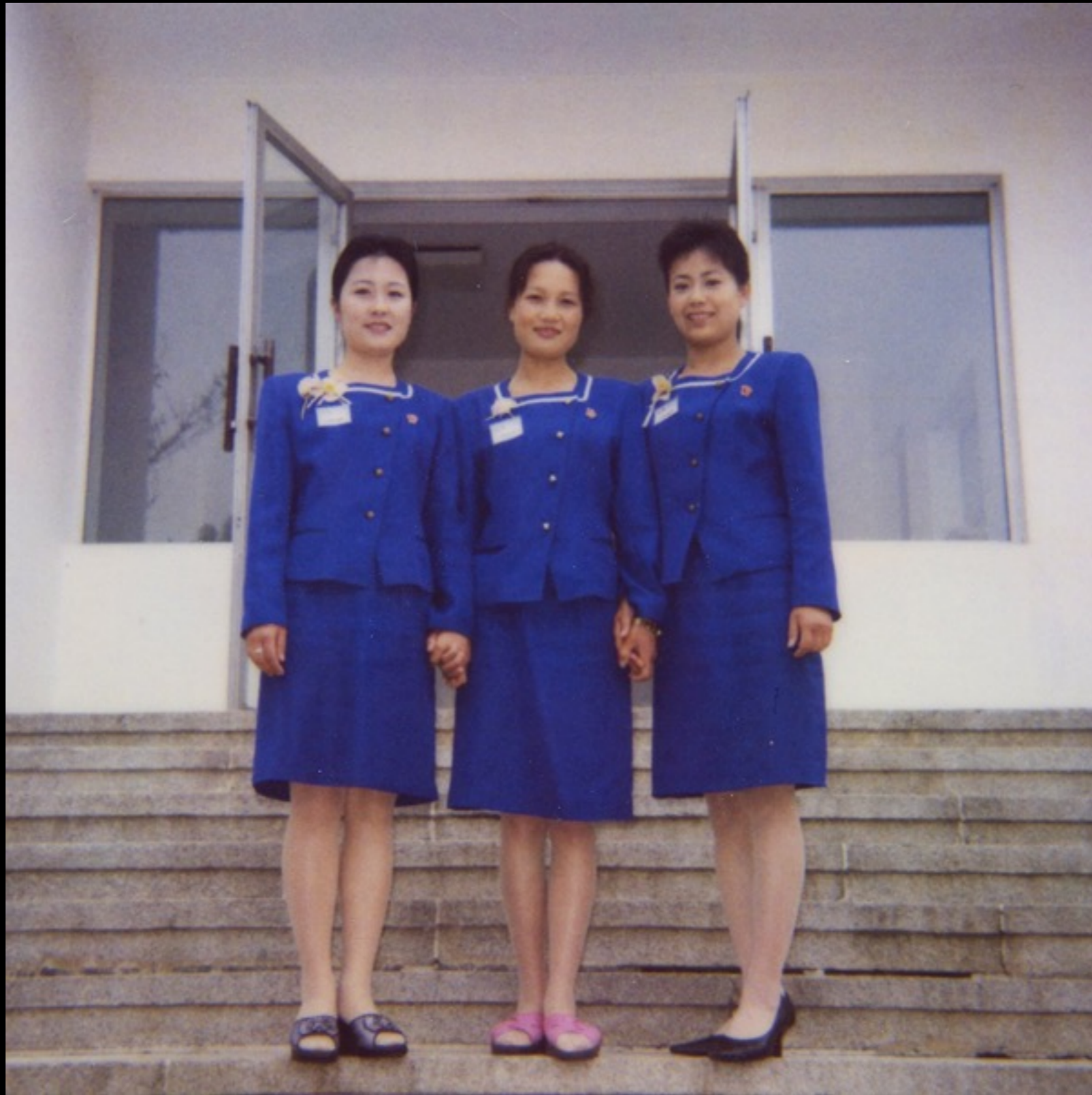
Women working in a highway restaurant near Pyongyang. They got to see very few people all day long. It is a boring job. At first, I thought they were flight attendants. This was the first time they saw a Polaroid, so I had to make one for each girl..