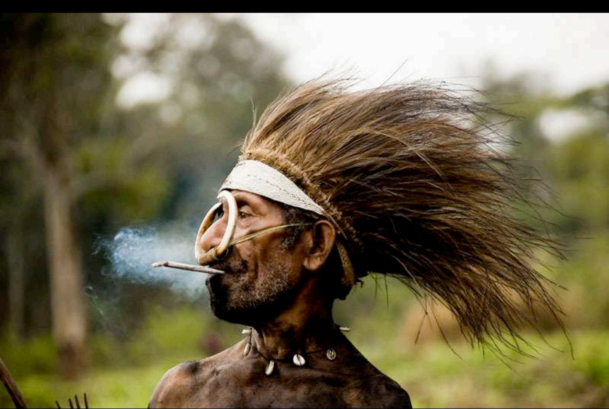
20 Man from the Chimbu province with Cassowary feathers on his head. His nose is not pierced, but he's wearing some pig tusks, a sign of wealth.