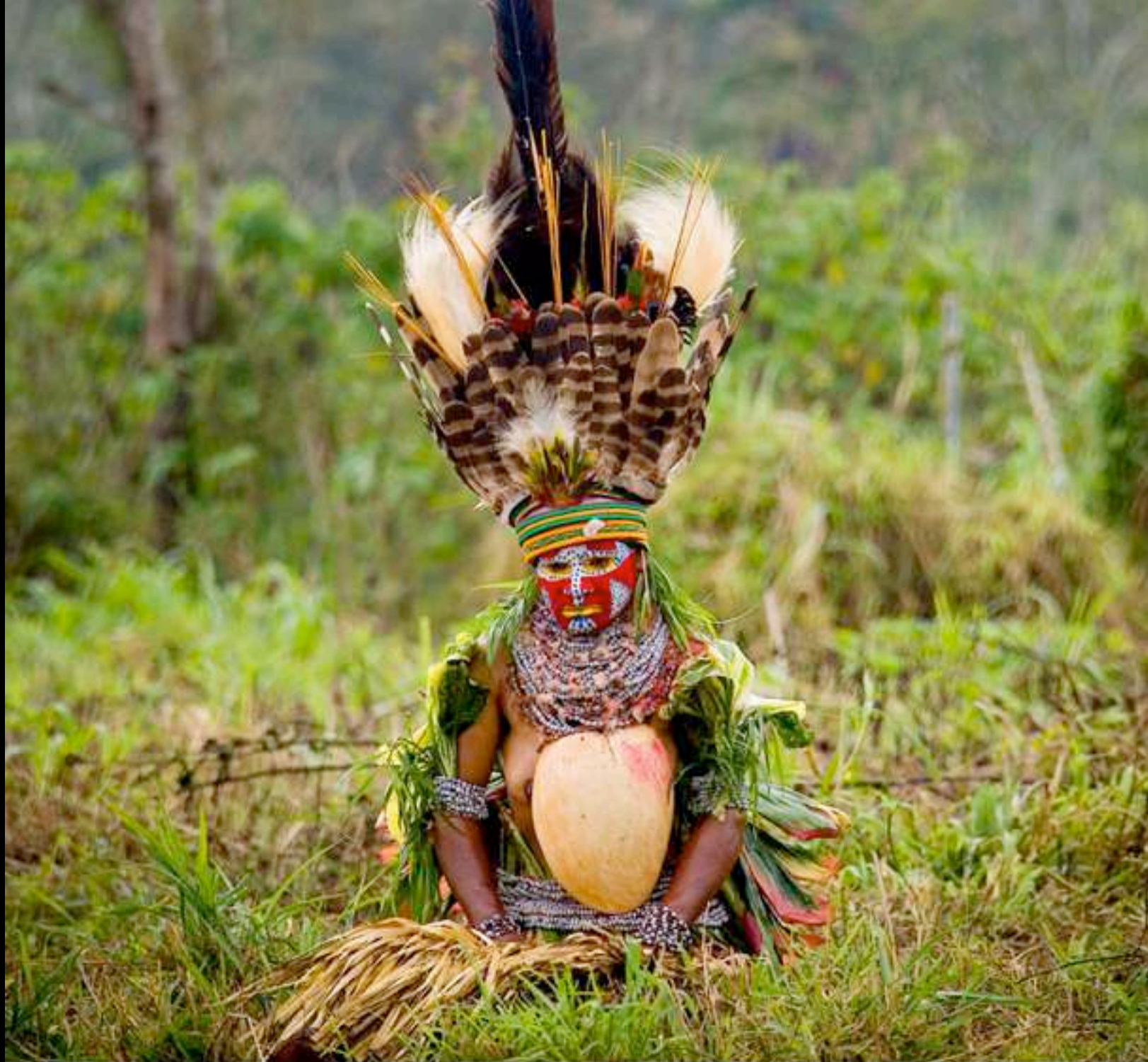
17 The vegetable based garments only last for one Sing Sing and reflect the tribes' environment, as they are collected on the day of the ceremony. The women cover each other in oil to shine in the sun.