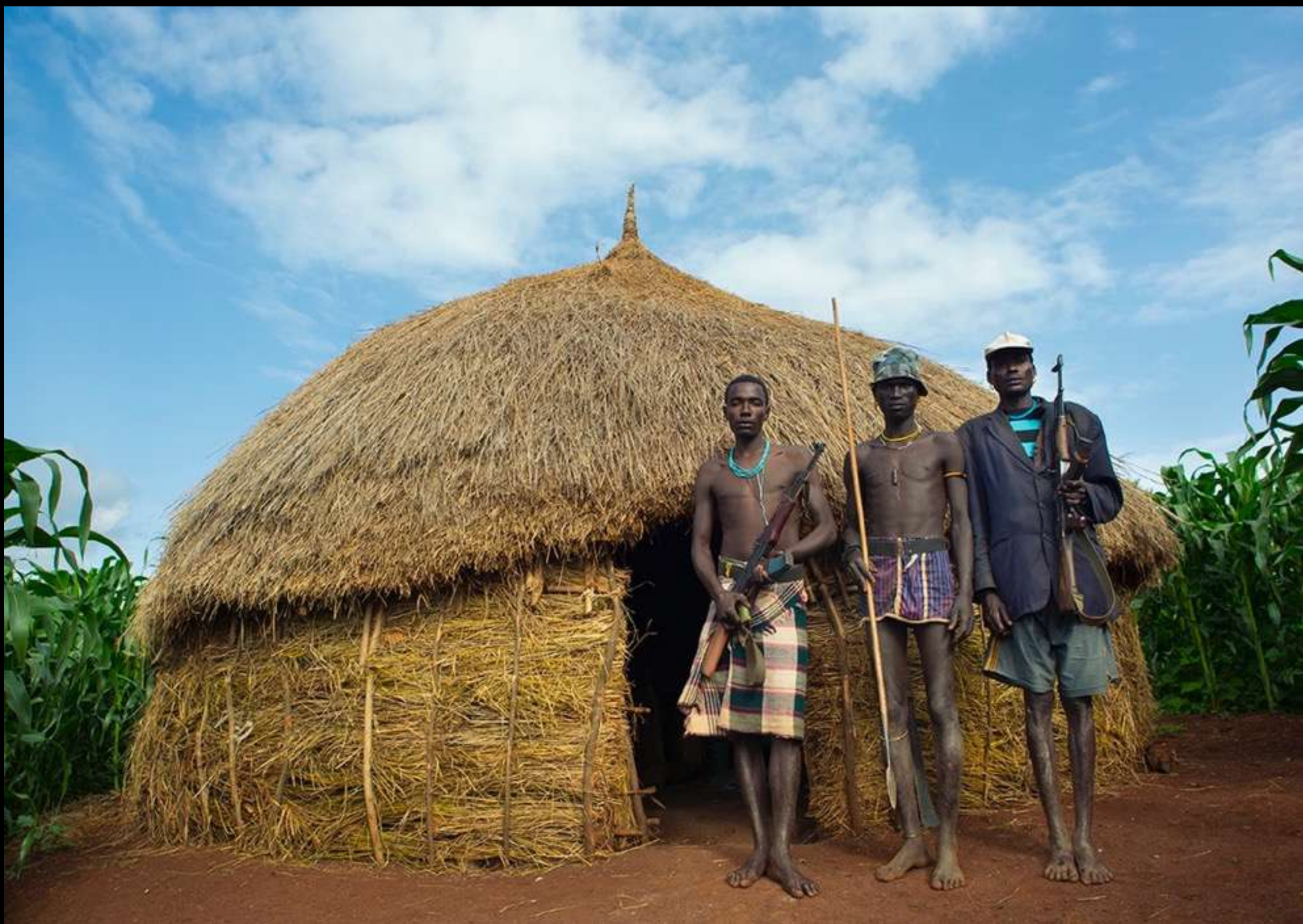
Menit men near the Toun village, in the new settlement. The government has taken their land, and they have already moved. Nobody will speak because they are afraid of the police around.