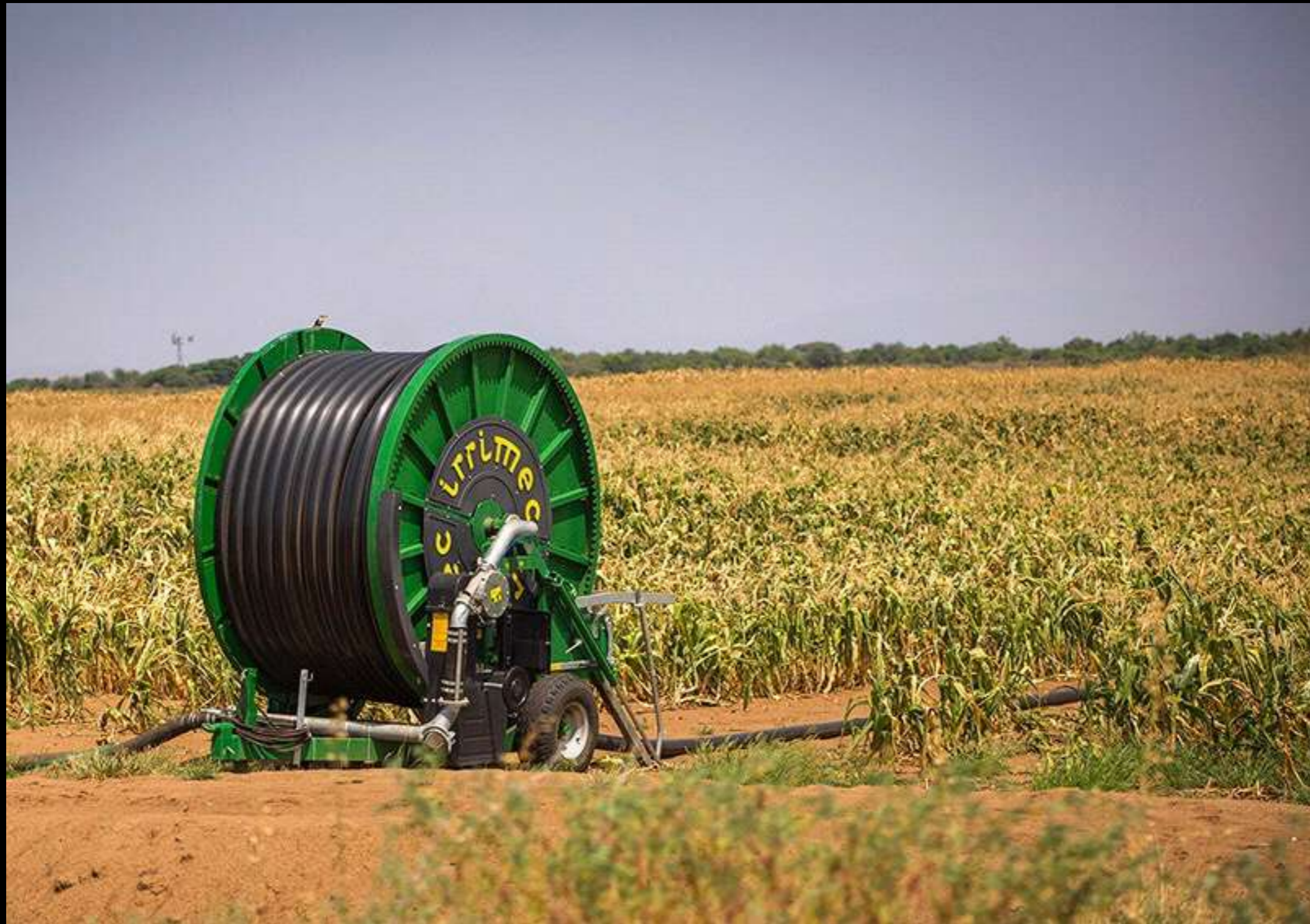
Irrigation system in the fields around Omorate