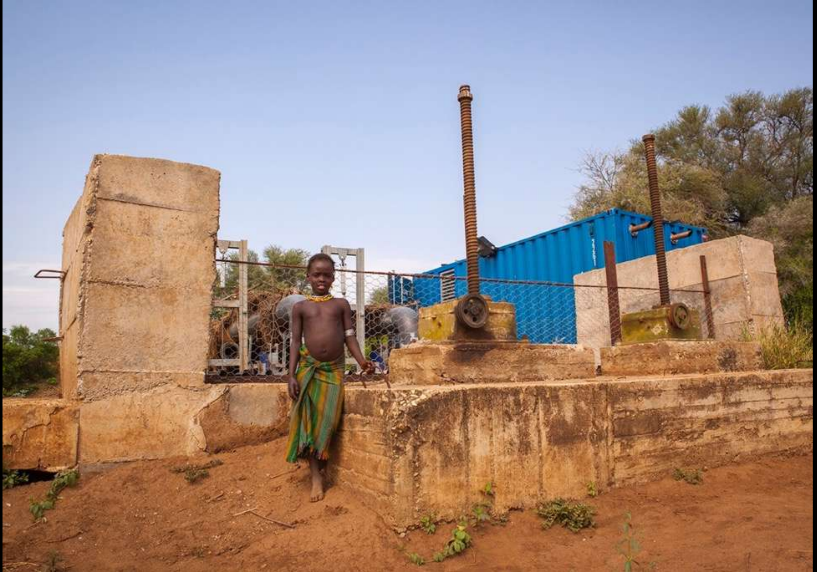
The giant pump in Omorate, set up by German company. The environing Dassanech tribe had to leave, only an old chief and his family remains, in the noisy atmosphere.