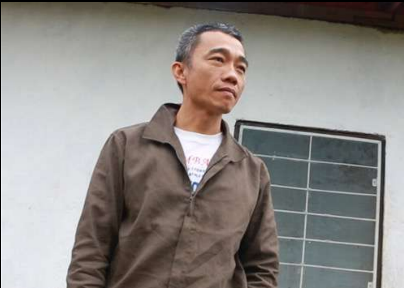
The malaysian manager of Koka plantation in Kibish.

The manager of the plantation is the last foreigner to stay, all the other Malaysian workers have left, and the Suris warriors have surrendered, fearing attacks.