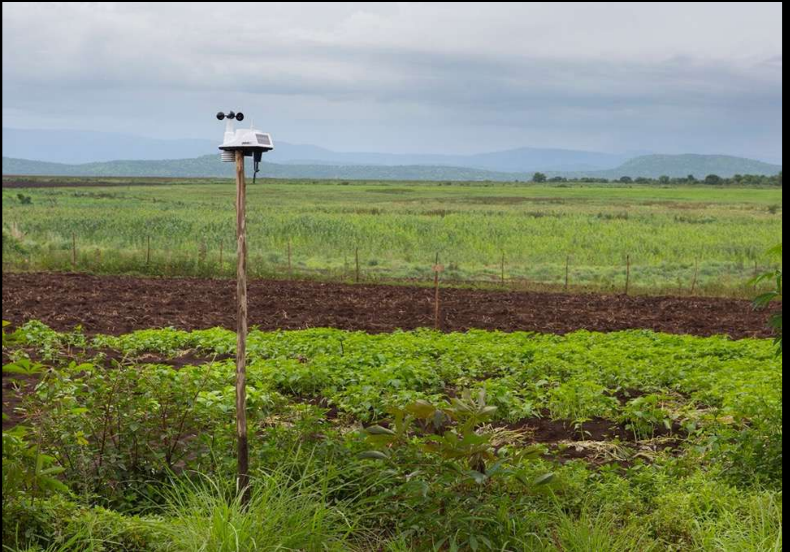
Koka plantation in near Kibish on the east side of the Omo, run by a Malaysian company. The lands are confiscated and rented out for 1 euro per hectare for a year to Lim Slow Jin company. The workers are penniless.