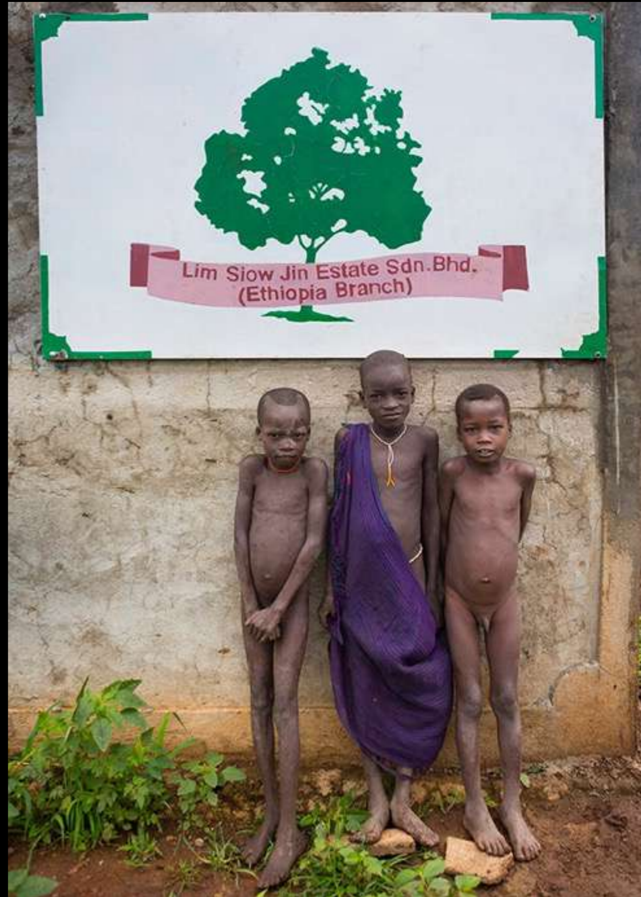
Suri kids at the entrance of of Koka plantation