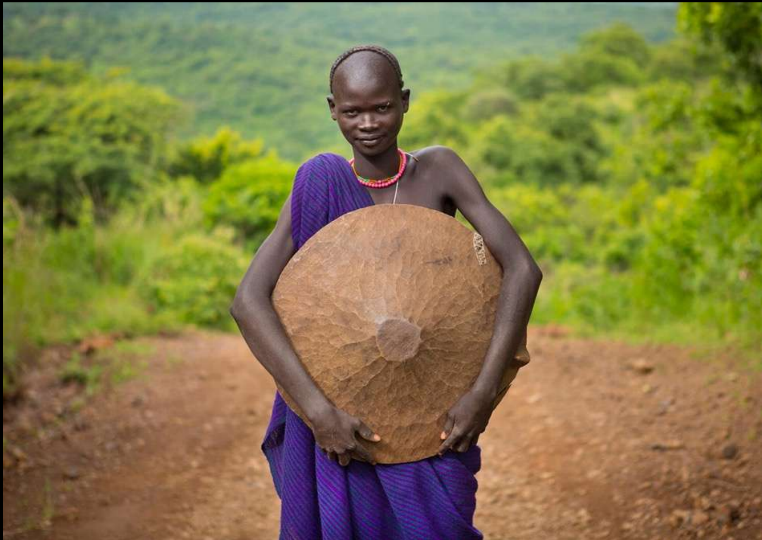
Since July 20, Suris are not allowed to sell their gold in Dima, and cannot access some areas of their own territory to dig for gold.