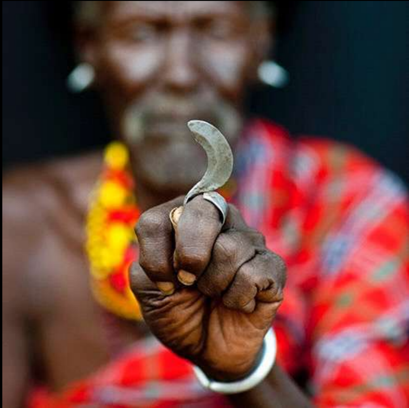
At the end of the line, the river Omo drying affects another country out: the north of Kenya. 300000 pastors. An El Molo village on the Turkana Lake where the Omo River flows to, and a Turkana chief.