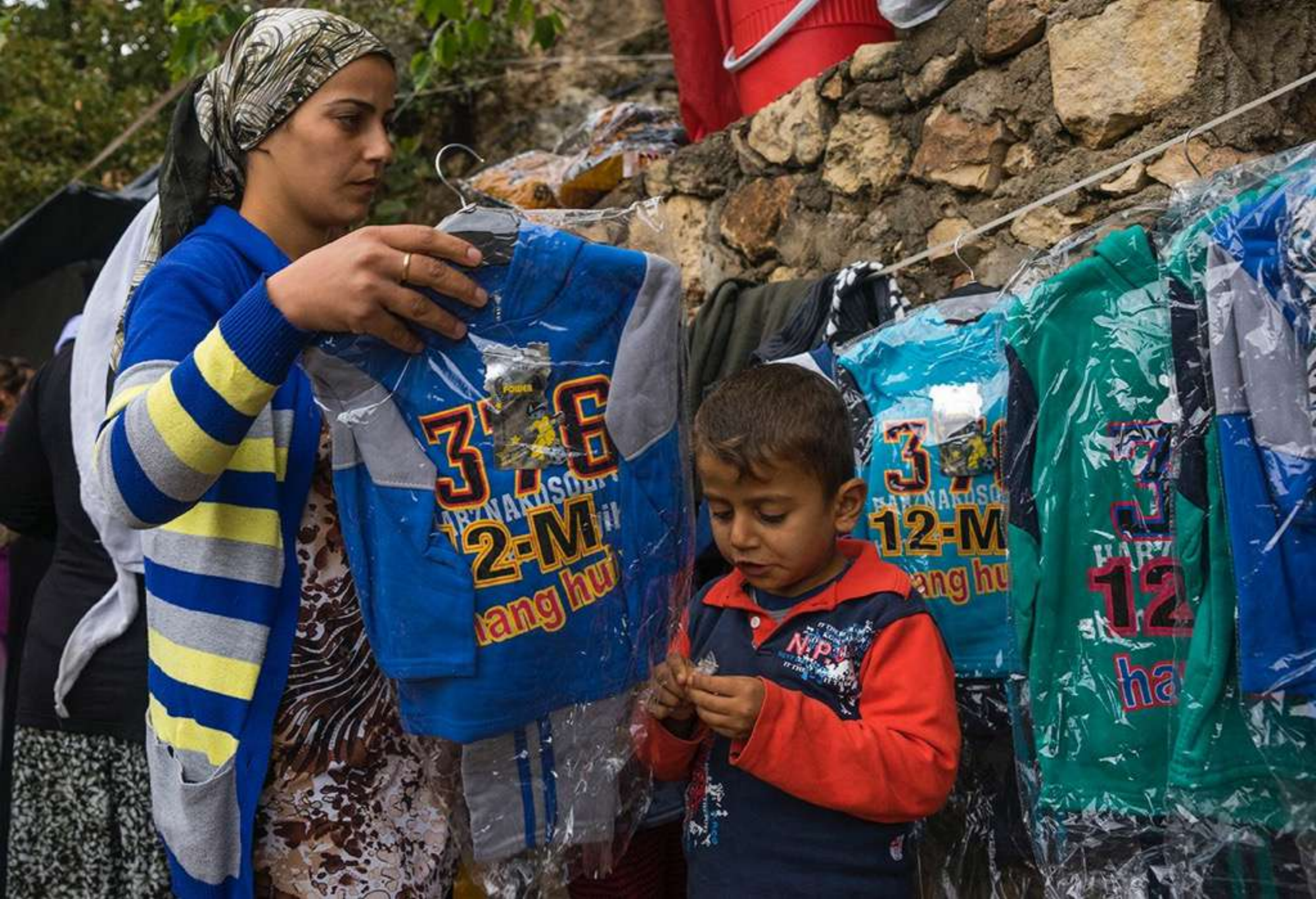
Free clothes for Ialash refugees. Most of them are Chinese shirts and do not protect against the cold that runs in the area.