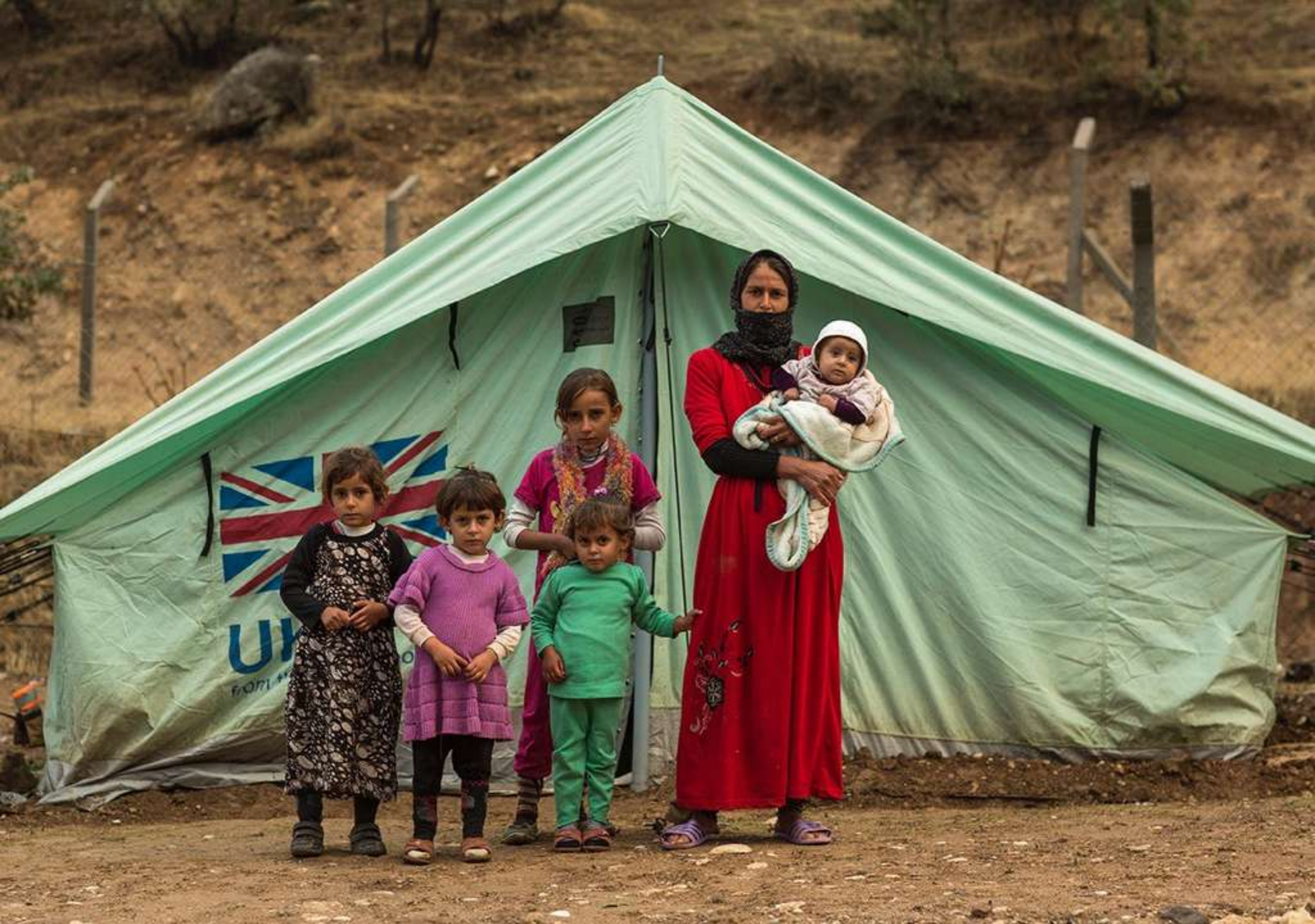
They crossed the hills for 7 days with 5 kids. The last one was named Nojin: « the new life »