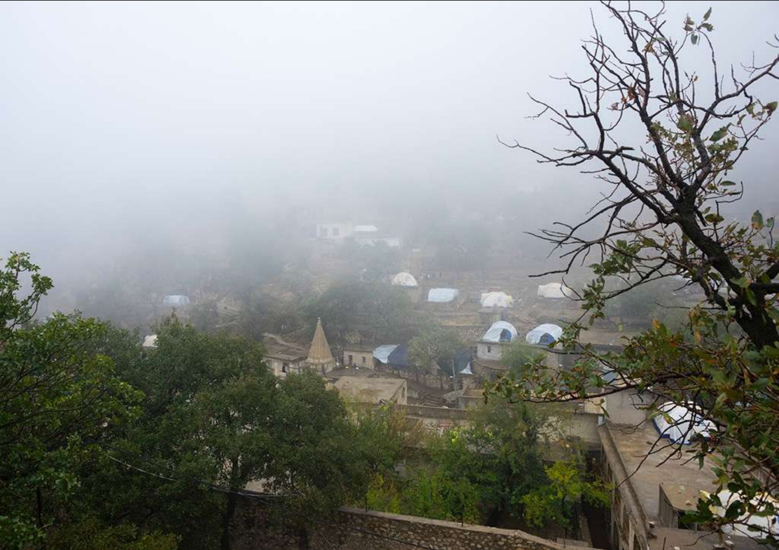
Lalesh yezedis temple