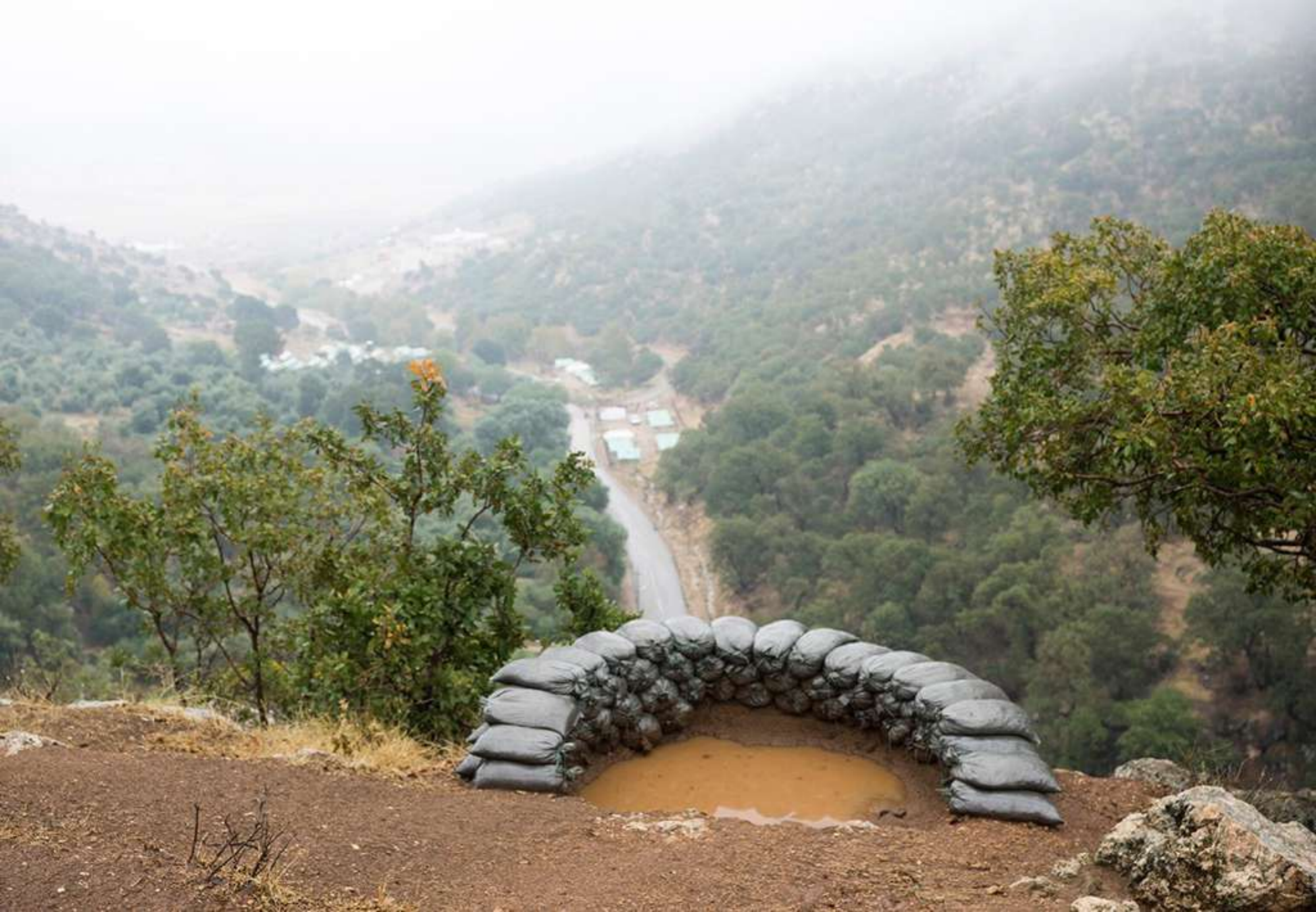
lalesh, the peshmergas are still looking around