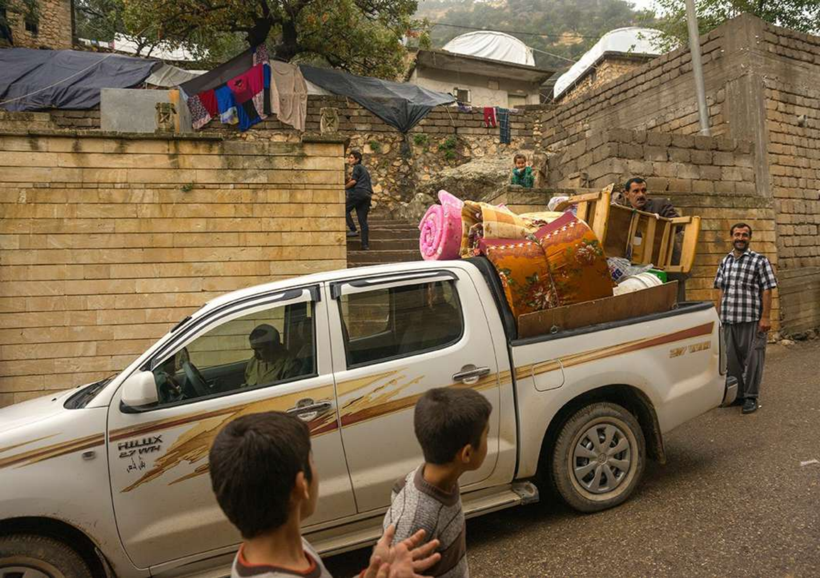
families still arrive in Lalesh temple, even if the place is overcrowded